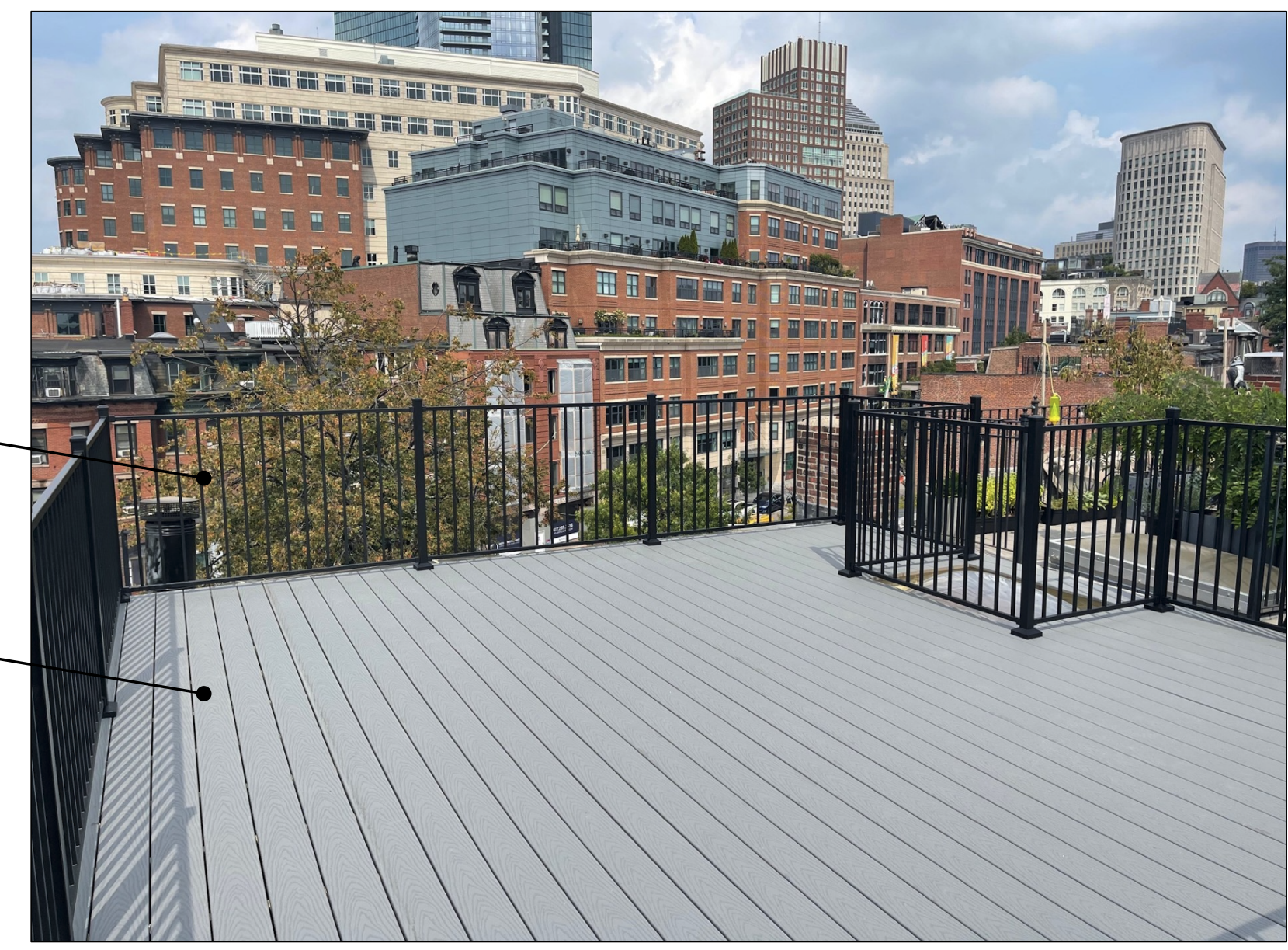
PROPOSED RENDERING SHOWING TYPICAL BUILDING MATERIALS.

1 Roof Plan - Proposed A-101 Scale: 1/8" = 1'-0"