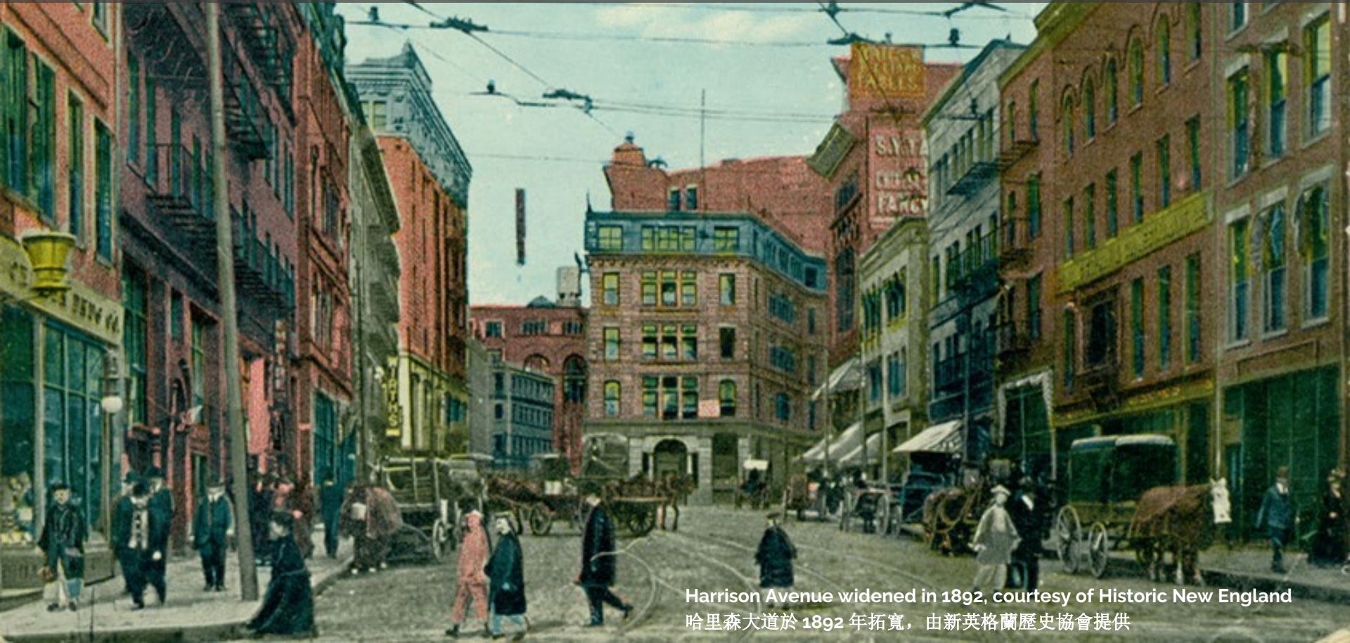
Harrison Avenue widened in 1892, courtesy of Historic New England 哈里森大道於 1892 年拓寬，由新英格蘭歷史協會提供