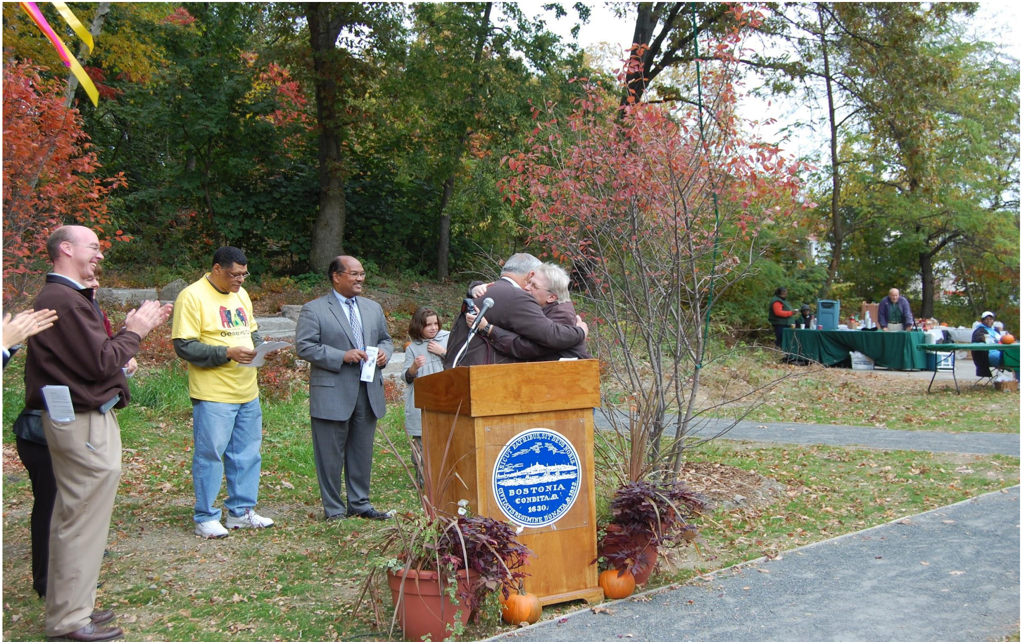
Celebration for 2008 renovation