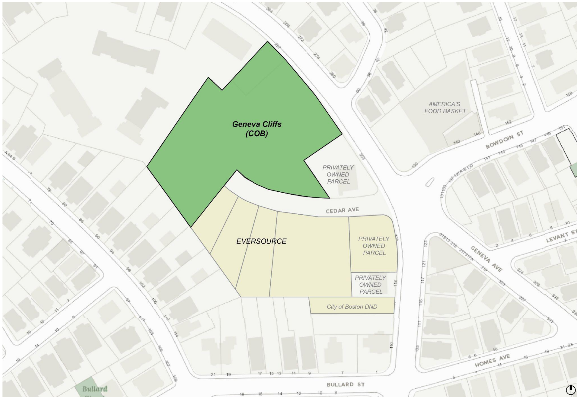
Geneva Cliffs (and adjacent vacant Eversource, Private and DND parcels)