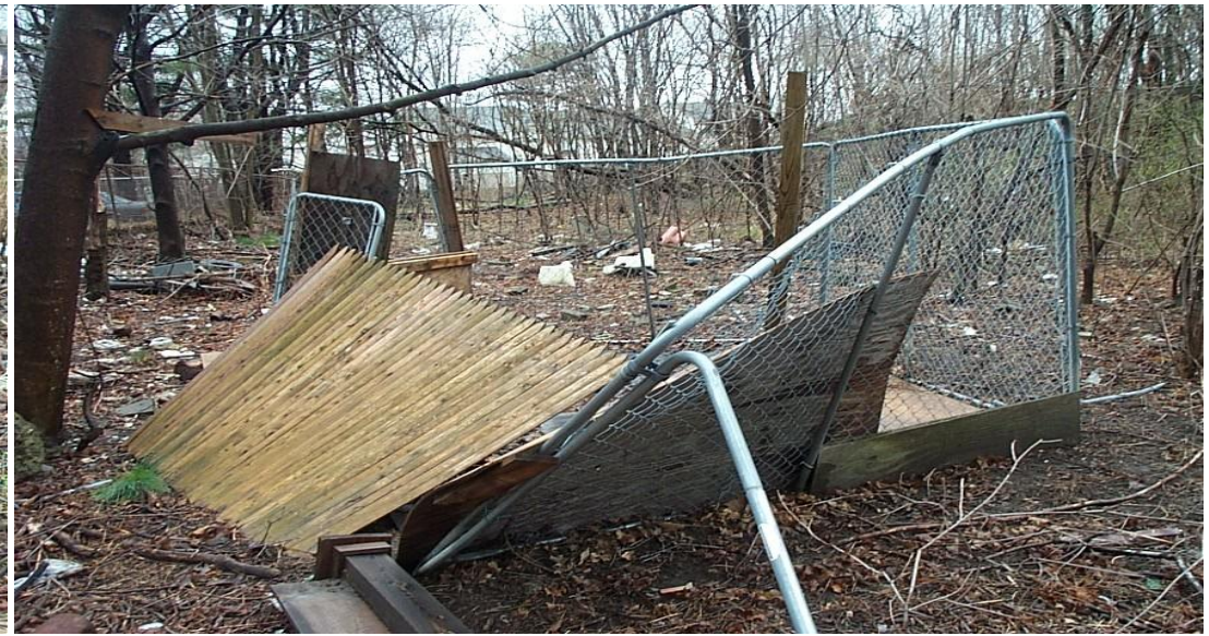
Site conditions at Geneva Cliffs before 2008 Renovations