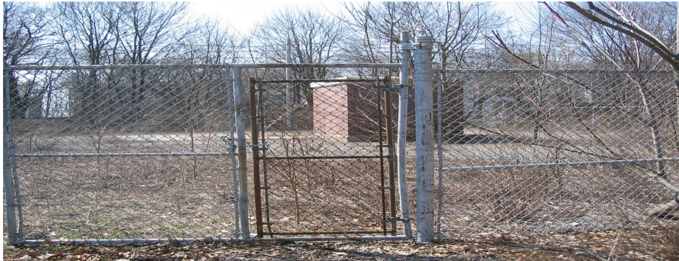
Adjacent Eversource parcel prior to demolition