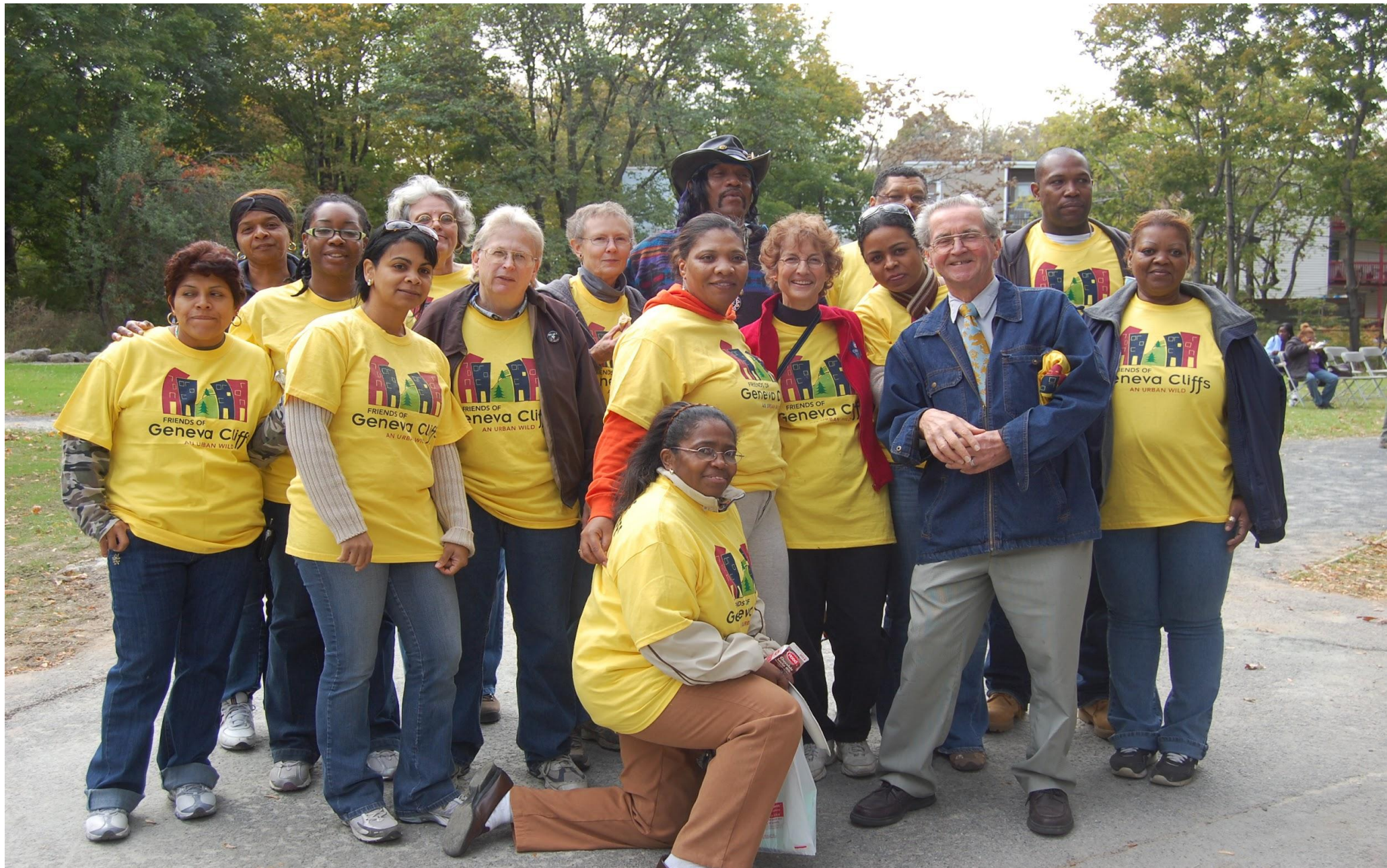
Friends of Geneva Cliffs