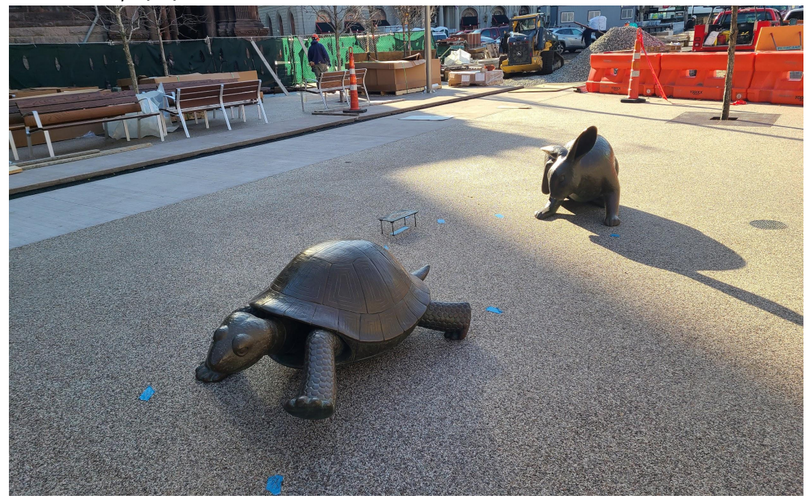
The Tortoise and the Hare are back at Copley! They are located in the area we'll be opening for New Years. Please feel free to drop by and welcome them back.