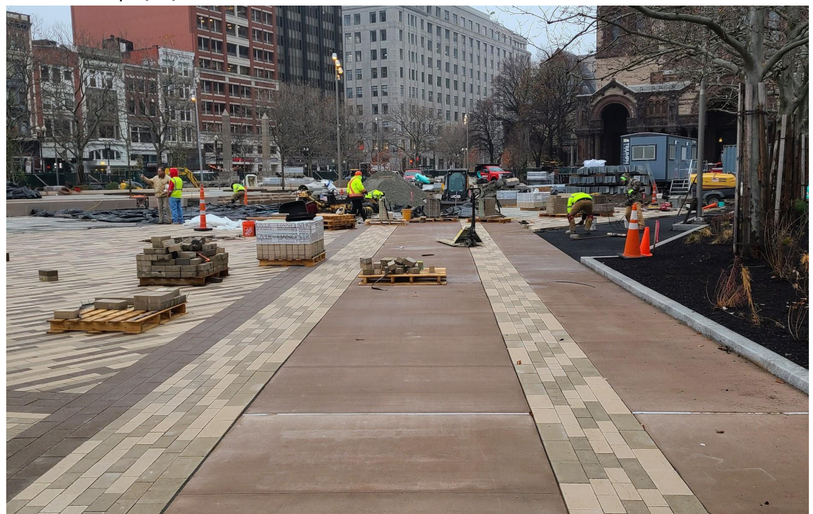
Standing at the corner of St. James and Dartmouth St., a view of the pavers along walkways and in the plaza, to the left. At the time of writing this report, the contractor has completed more of the plaza – but still not enough to open on 12/31/2024 unfortunately.