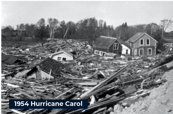
1954 Hurricane Carol

Category-3 Hurricane Carol, with wind gusts of 135 mph, caused 68 deaths and $461 million in damage in 1954.*