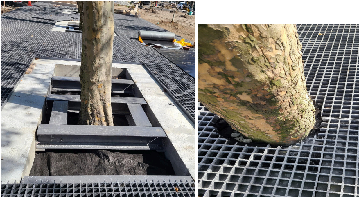
The Raised Grove is intended to protect existing London Plane trees, so we need to build the deck in a way that allows for continued growth. Photo on the left is the structure below our pavers, and the photo on the right shows the grating system to distribute the weight evenly along the concrete beams. We will be increasing the opening in the grating system at the trees - this attempt was too small . Trees need room to breathe and grow.