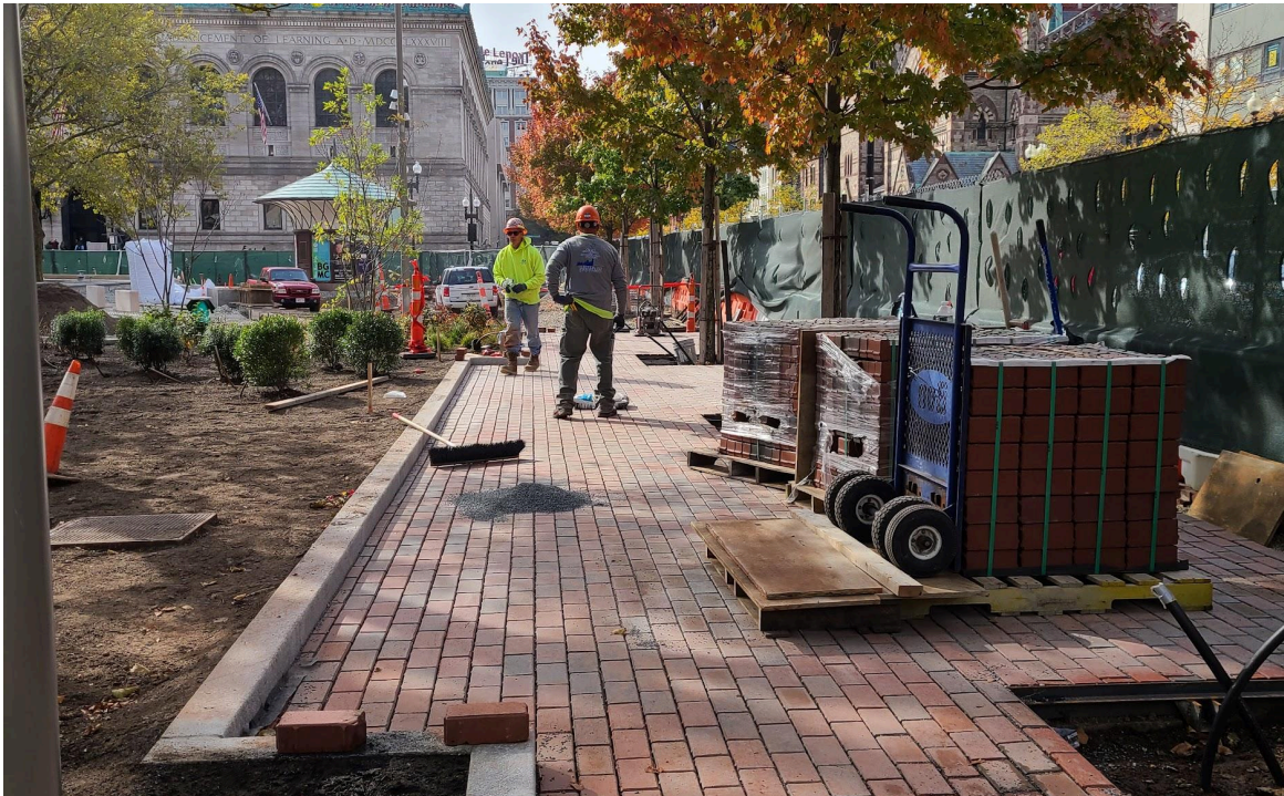
Pervious brick pavers being installed adjacent to the Boylston Street sidewalk area - we've now progressed this paving west of the fountain.