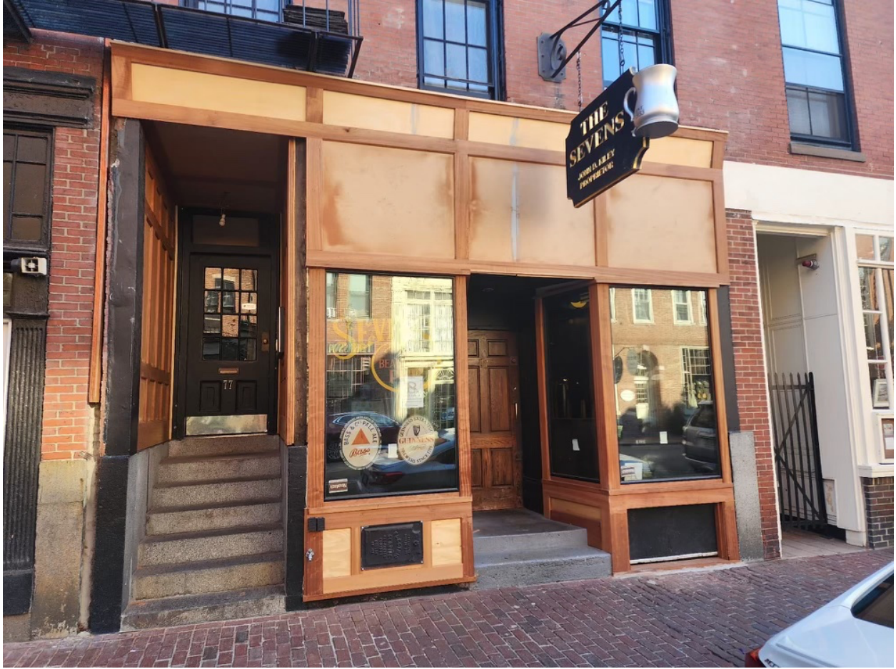
• Current Photo 9/4/24