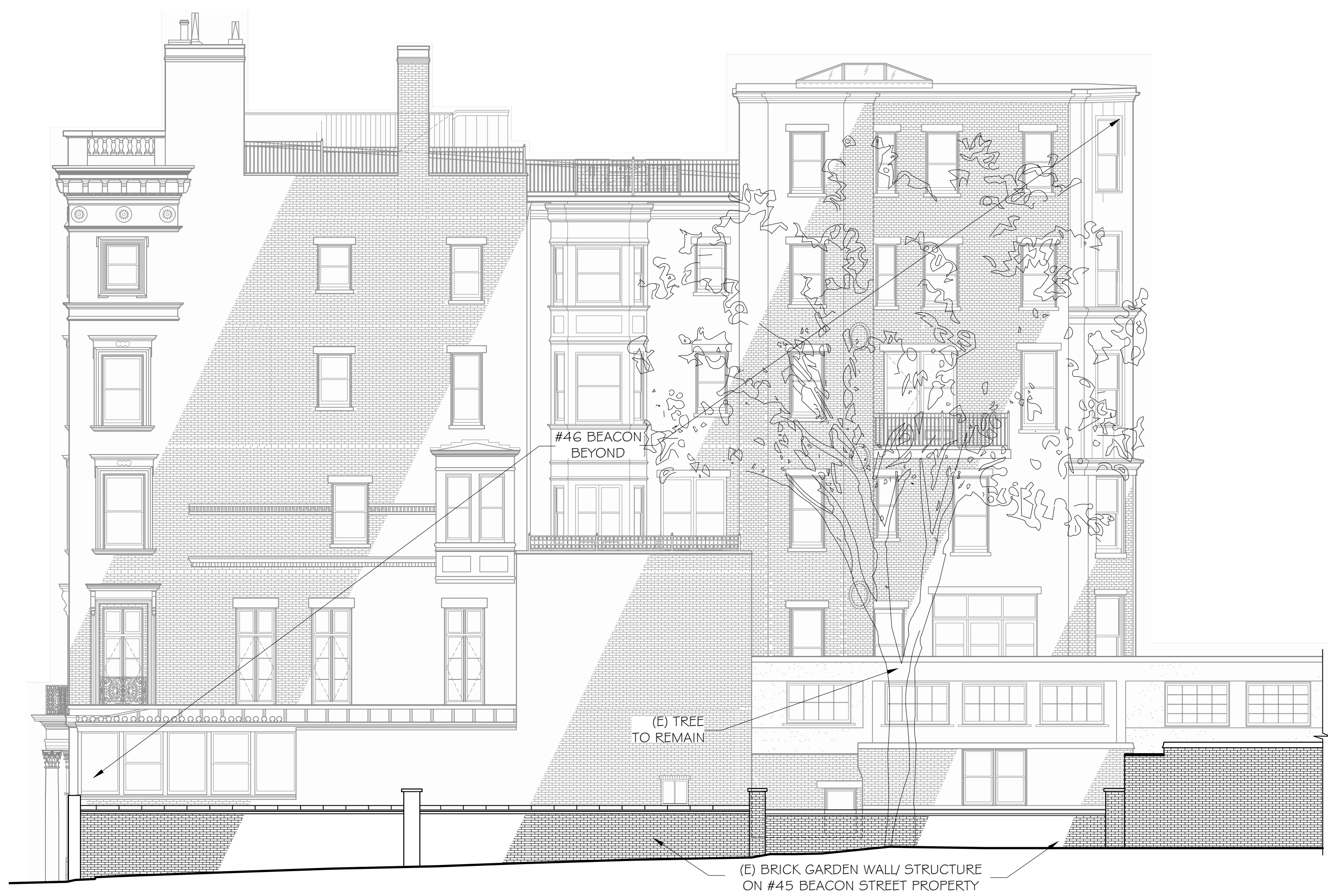
EXISTING EAST ELEVATION SCALE: \frac{1}{8}'' = 1'-0''