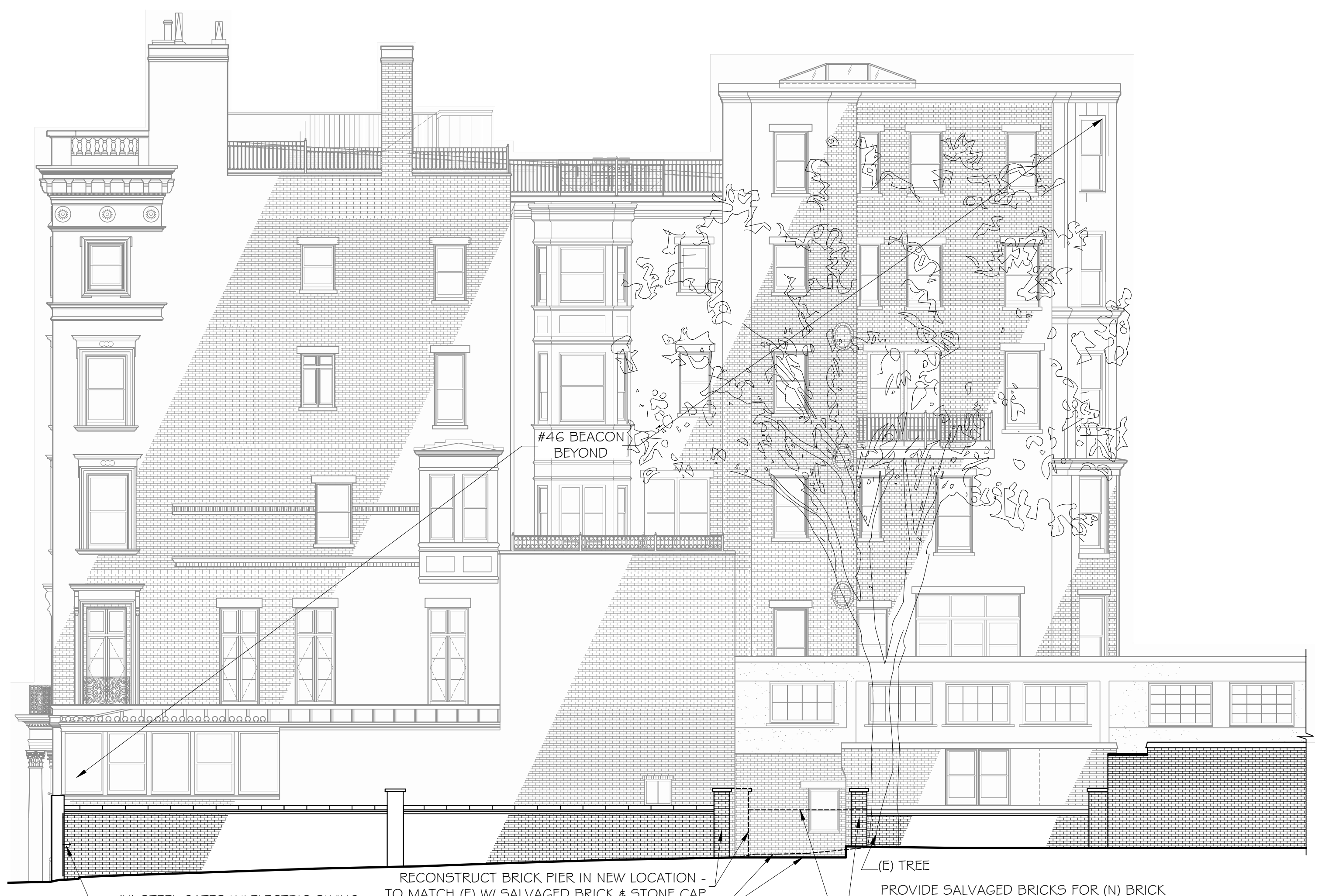
PROPOSED EAST ELEVATION SCALE: \frac{1}{8}'' = 1'-0'' RECONSTRUCT BRICK PIER IN NEW LOCATION - TO MATCH (E) W/ SALVAGED BRICK & STONE CAP SHORTEN (E) PLANTER & STONE CURB - REGRADE & REUSE (E) COBBLE PAVERS (E) TREE PROVIDE SALVAGED BRICKS FOR (N) BRICK PIER TO MATCH (E) - STONE CAP TO MATCH (E) REMOVE PORTION OF (E) GARDEN WALL