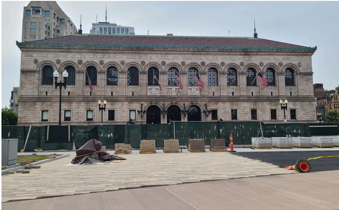
Pavers are being installed in the new open plaza space, directly across Dartmouth St. from the library.