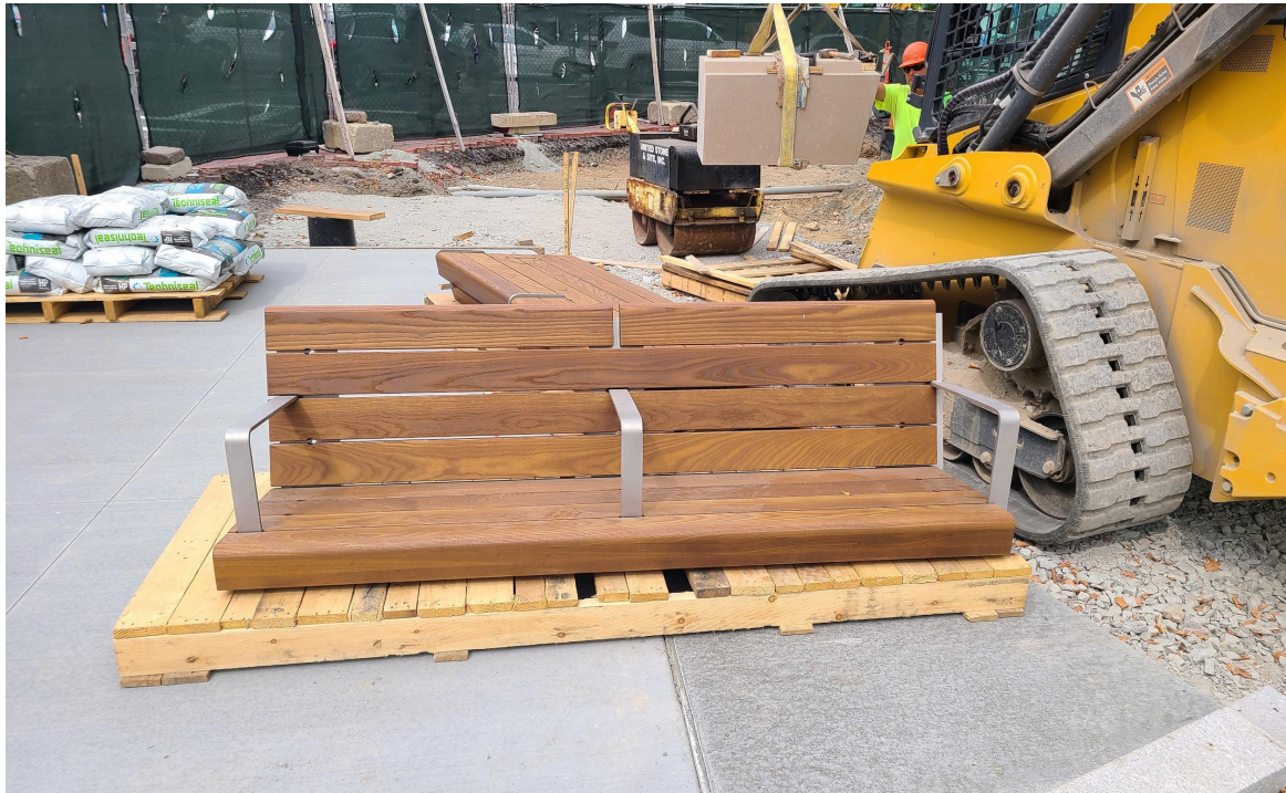
One of the wooden bench tops, resting on a pallet. These are made of thermally modified ash - no more tropical hardwoods, and these should last much longer than oak, as well.