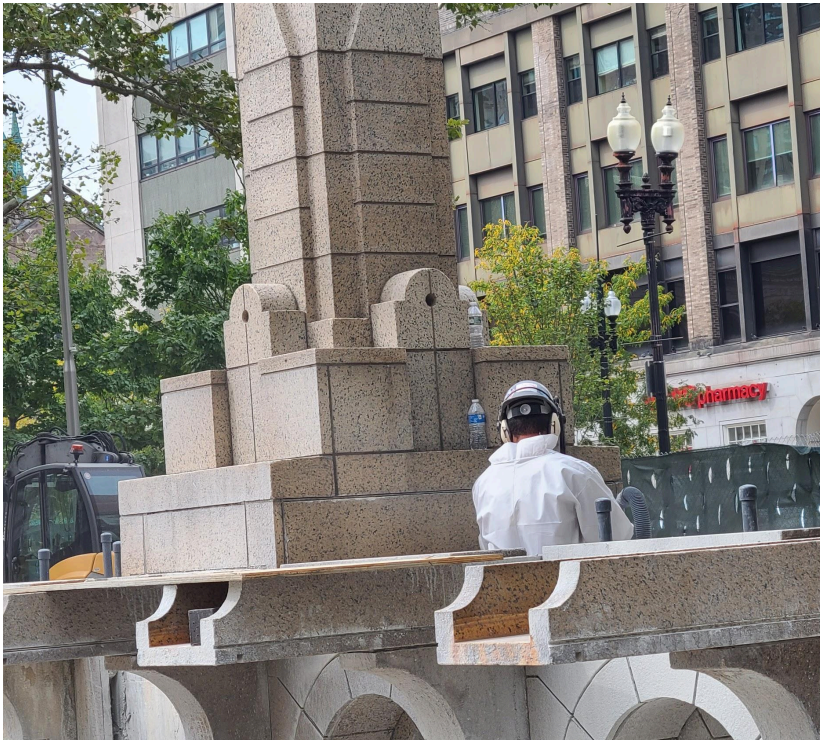
Chipping out the old mortar between fountain stones - tyvek suit, eye protection, and two sets of earplugs required!