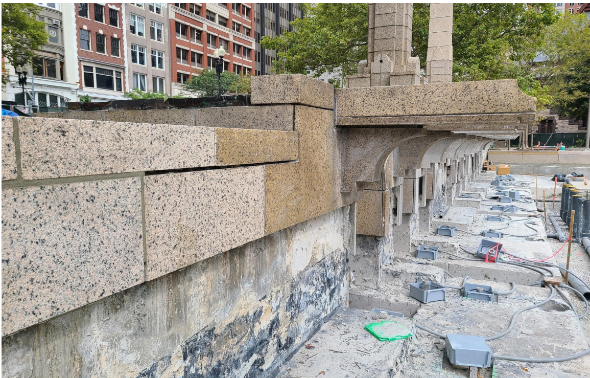
The granite closest to the camera has been cleaned and repointed, for review. They haven't affixed the new boxes that will house uplights yet. New brass nozzles have been installed below the arches too.