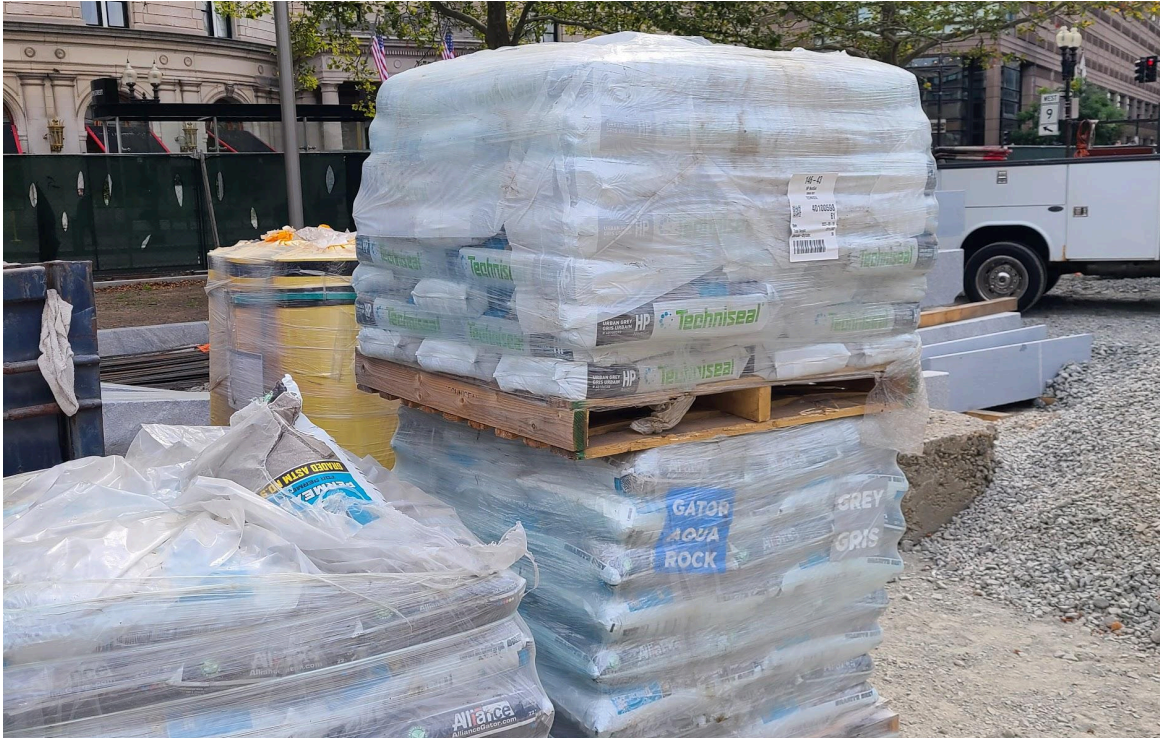
Two of the many pallets of aggregate that will be combined with resin to create porous pavement in seating areas on either side of the fountain, and just north of Trinity Church.