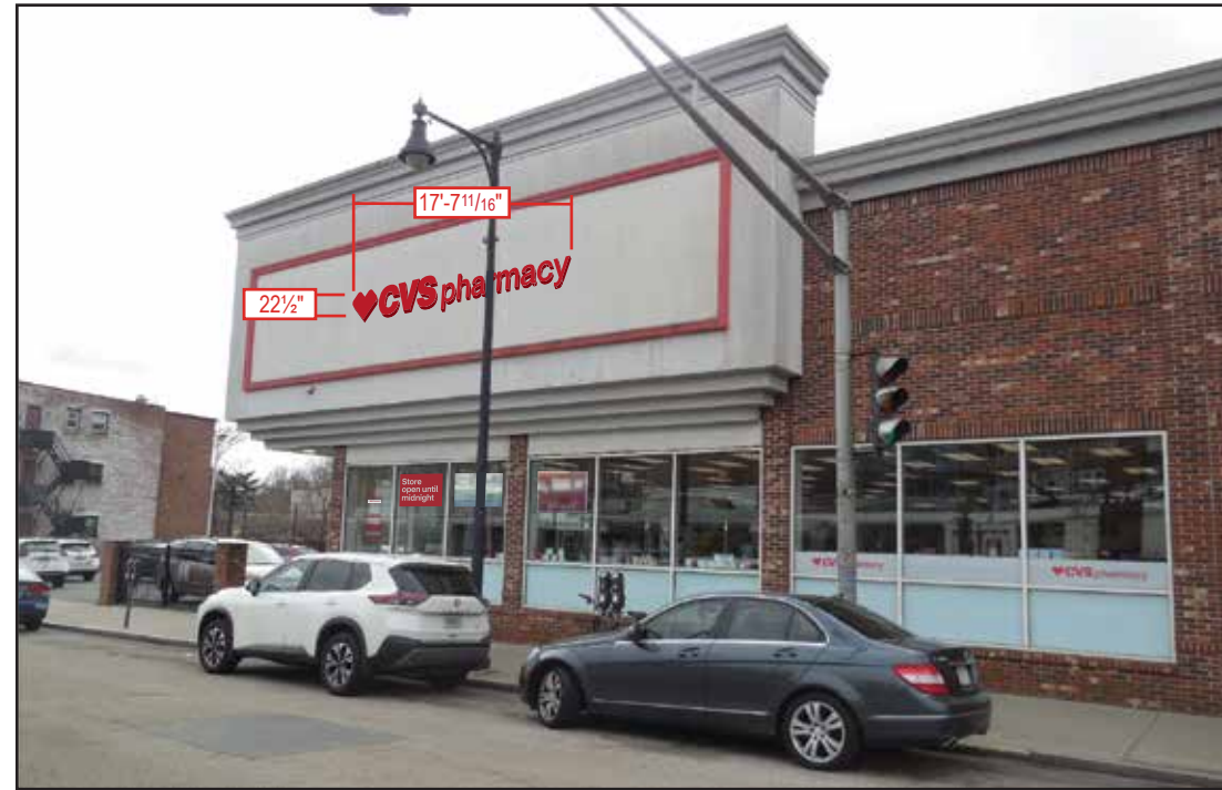
B Photo Comp - Proposed Not To Scale