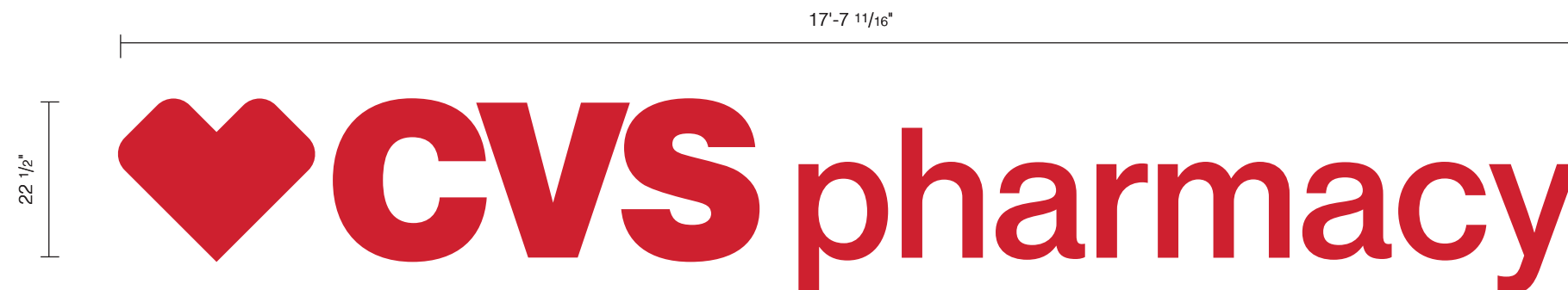
2 Proposed Sign #2 - Front View Scale: 1/2"=1'-0"

Brightness may be adjusted upon request of BPDA Urban Design