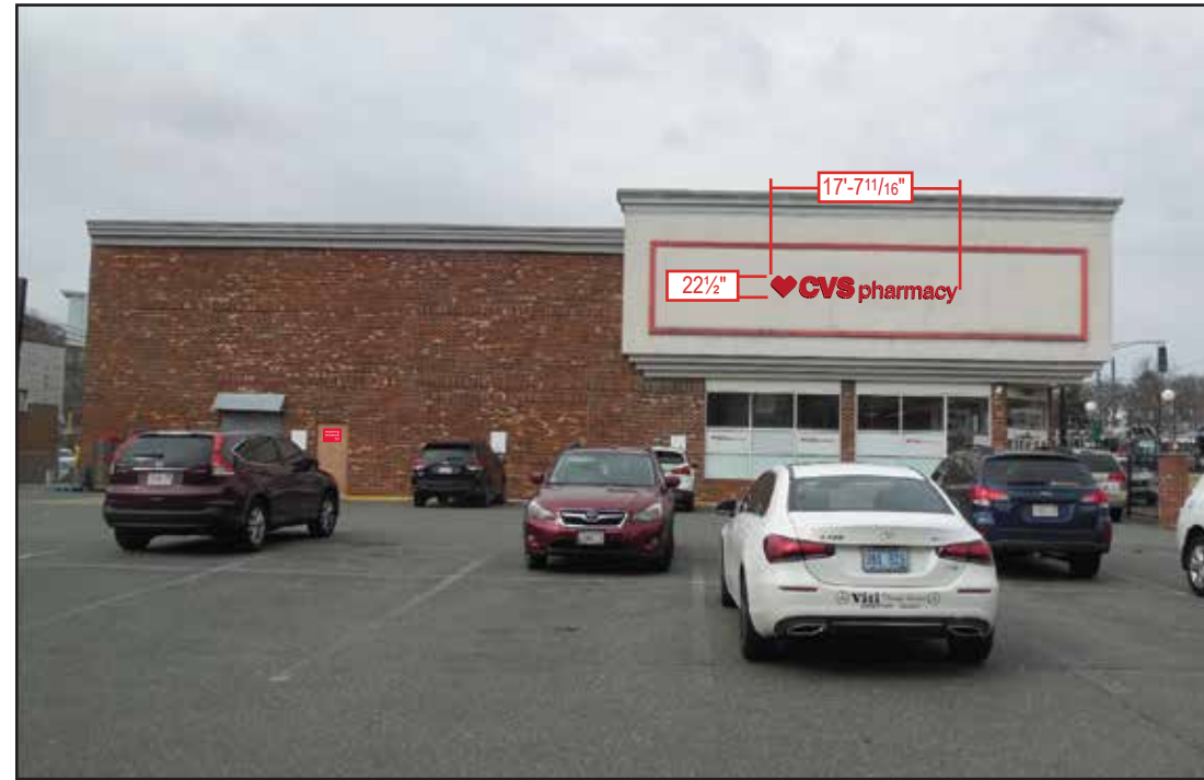
B Photo Comp - Proposed Not To Scale