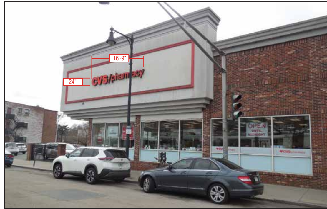
A Photo Comp - Existing Not To Scale