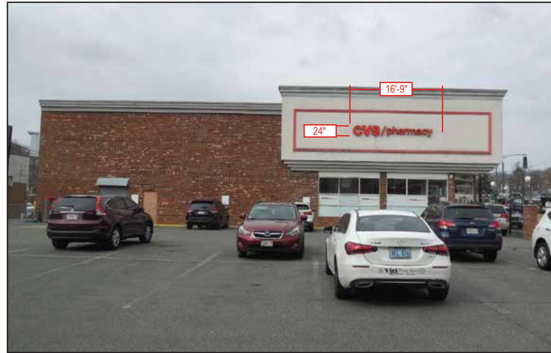
A Photo Comp - Existing Not To Scale