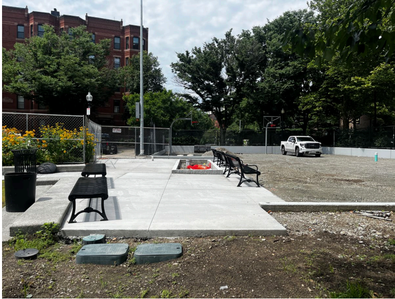
Site furnishings at basketball courts and basketball backstops installed SITE PHOTO 7/18/2