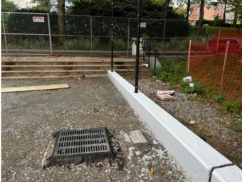
Curb wall at basketball court repaired and freshly painted. SITE PHOTO 7/18/24