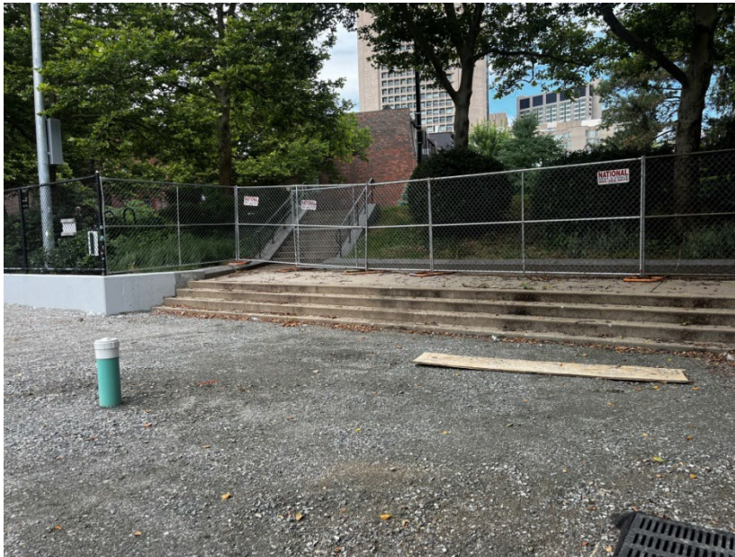
New cleanout for subgrade stormwater system installed! SITE PHOTO 7/18/24