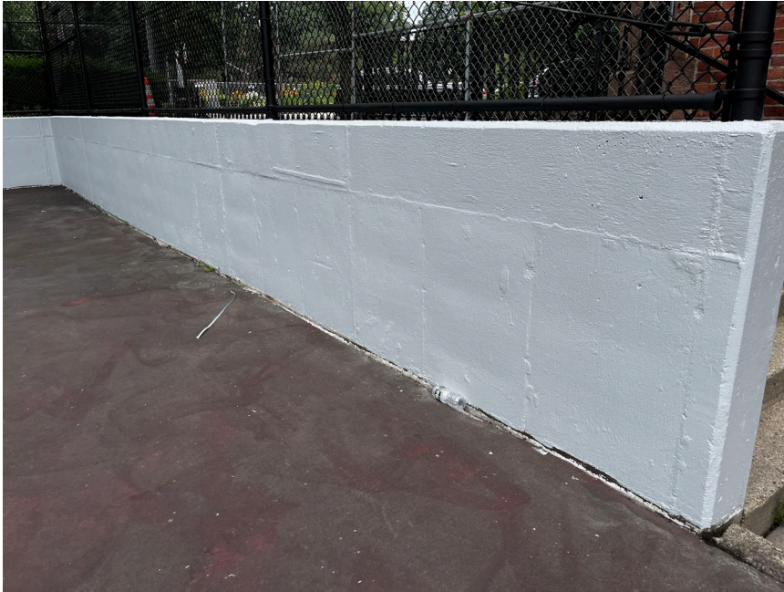
Site walls at Tennis Courts have been repaired and repainted! SITE PHOTO 7/18/24

THIS IS A BOSTON RESIDENTS JOBS POLICY PROJECT: For employment opportunities, call WES Construction Corp. at (781) 294-1080