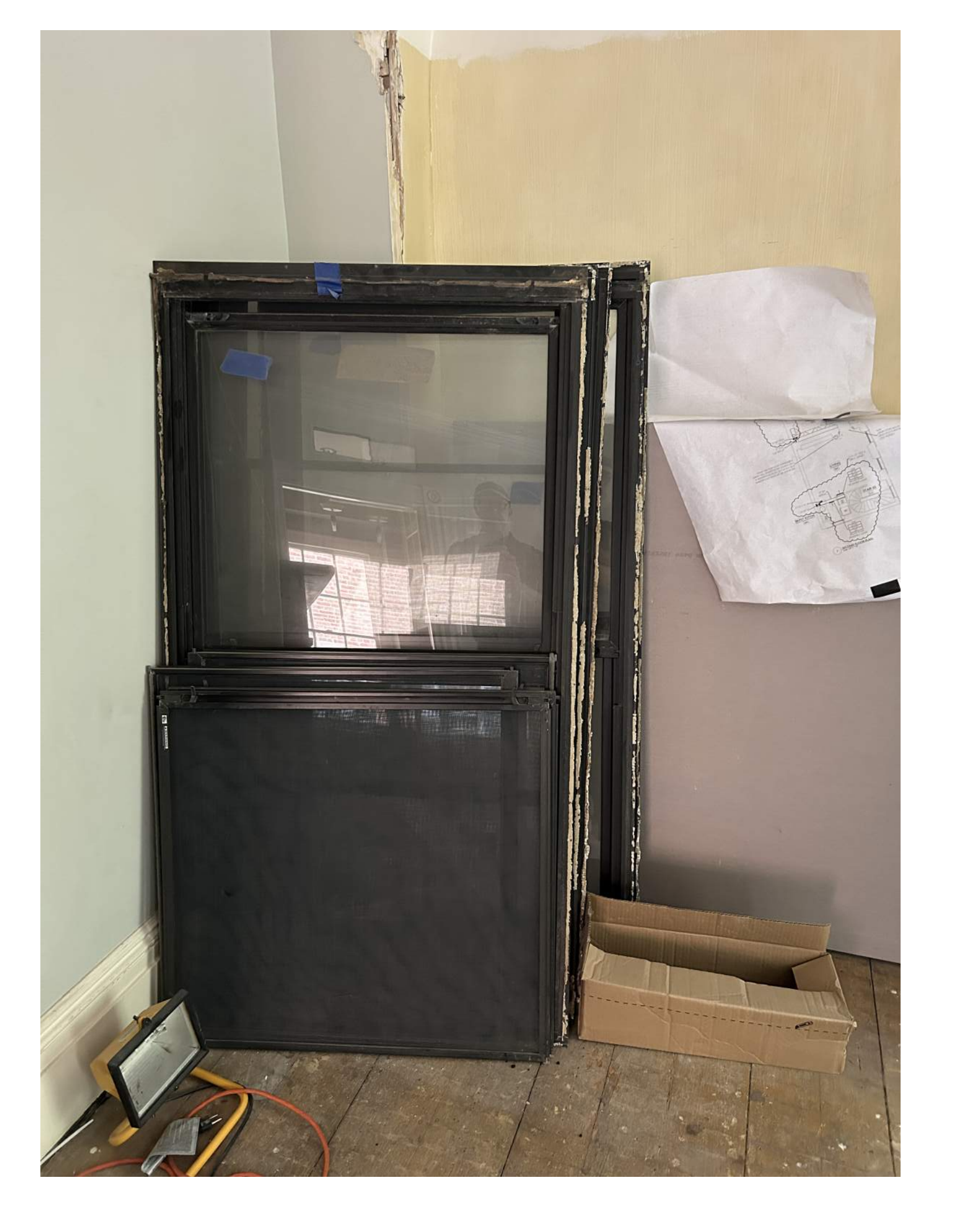
Existing black triple track storm windows.