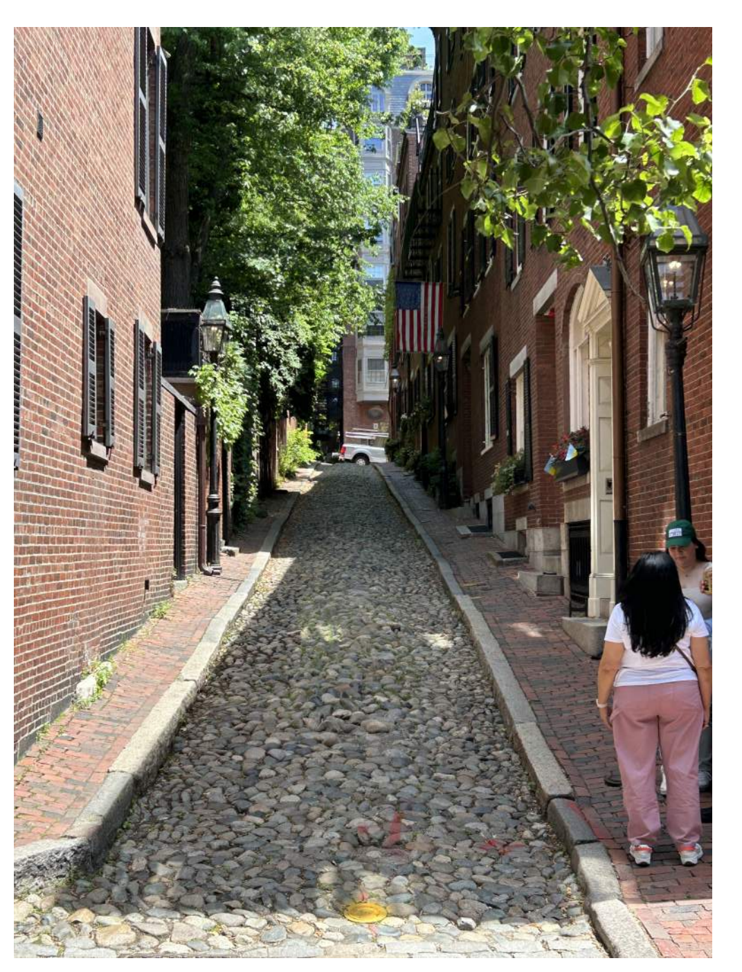
9 Willow Street at the upper end of Acorn Street from 5 West Cedar has the same light-colored bay and window combination.