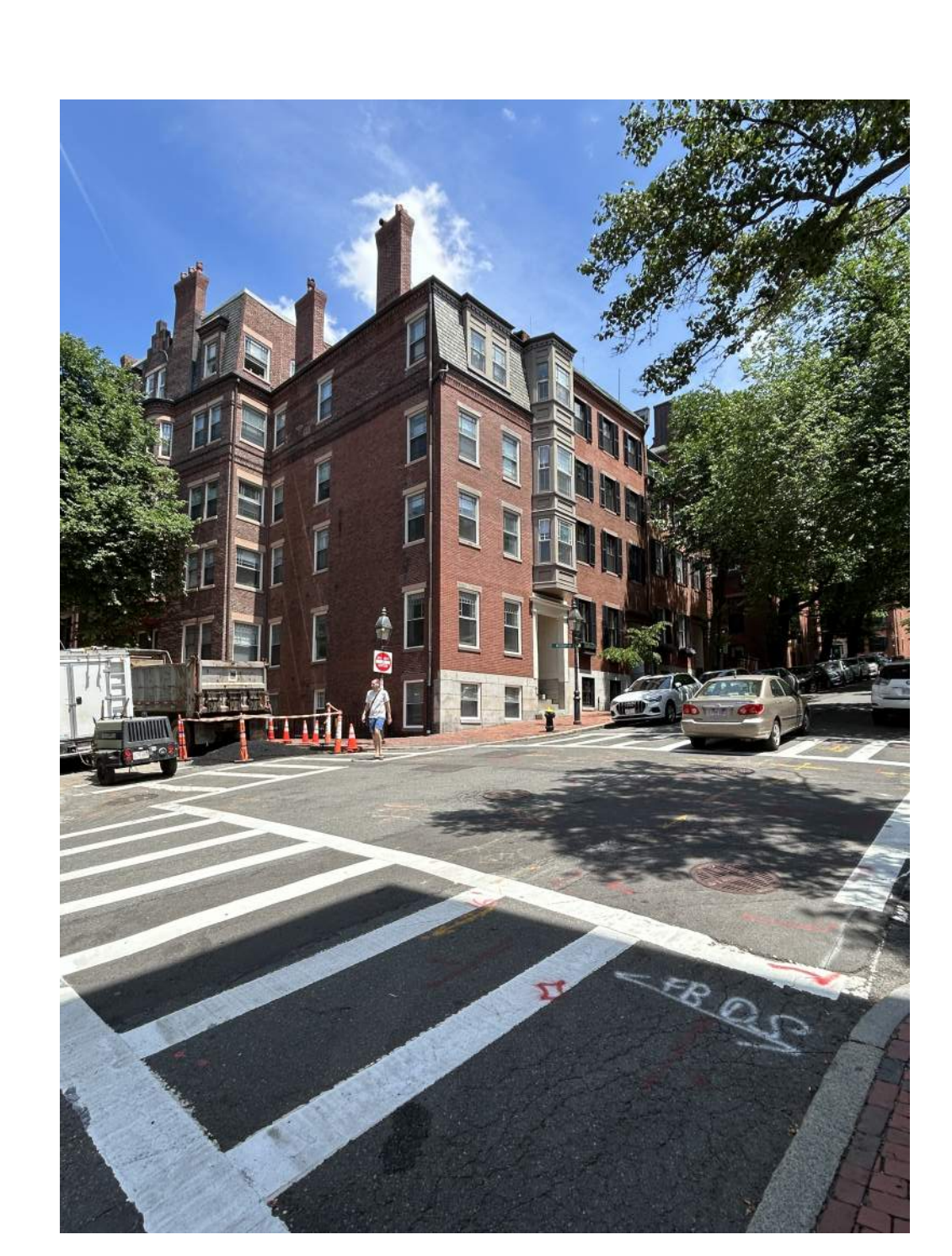
bays on 108 Mount Vernon Street are light-colored, matching the trim and sash.