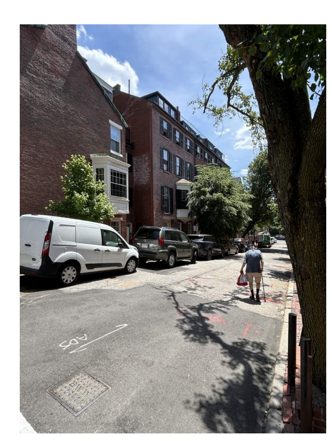
Two bay windows at 11 West Cedar Street (in the same block as number 5) match their houses' off-white trim and sash.