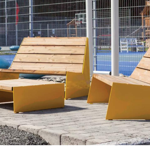
Fixed Seating for Parents