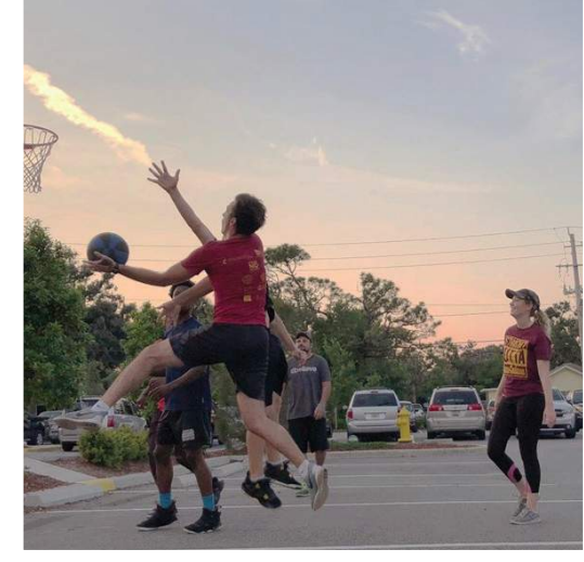
Fixed Basketball Hoop