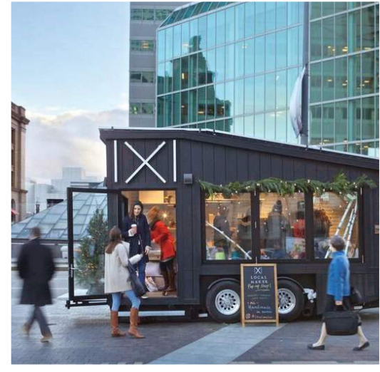
Pop up or Food trucks