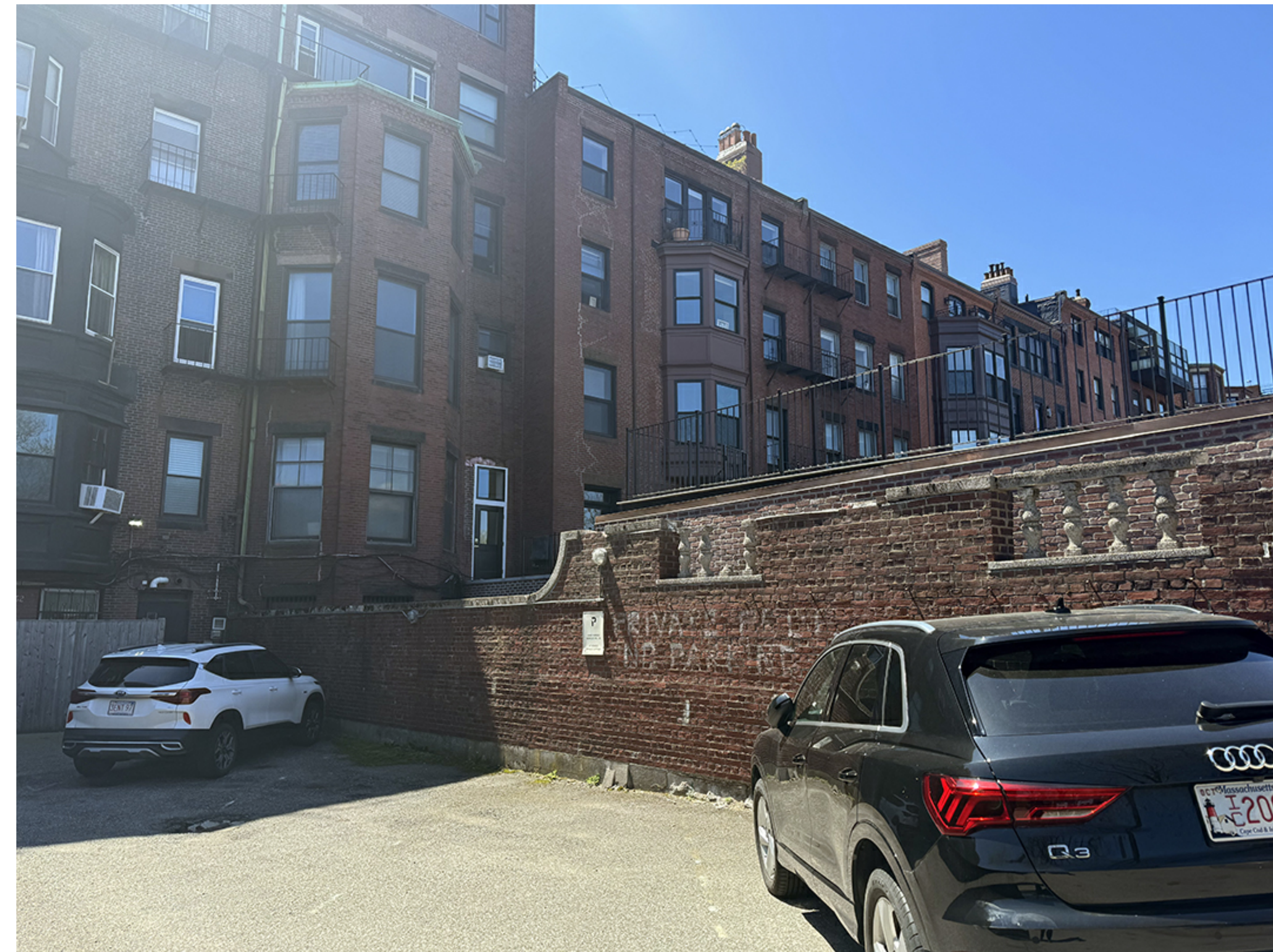
EXISTING MASONRY WALL BETWEEN PROPERTIES, NOTE DECORATIVE ADDITION TO WALL