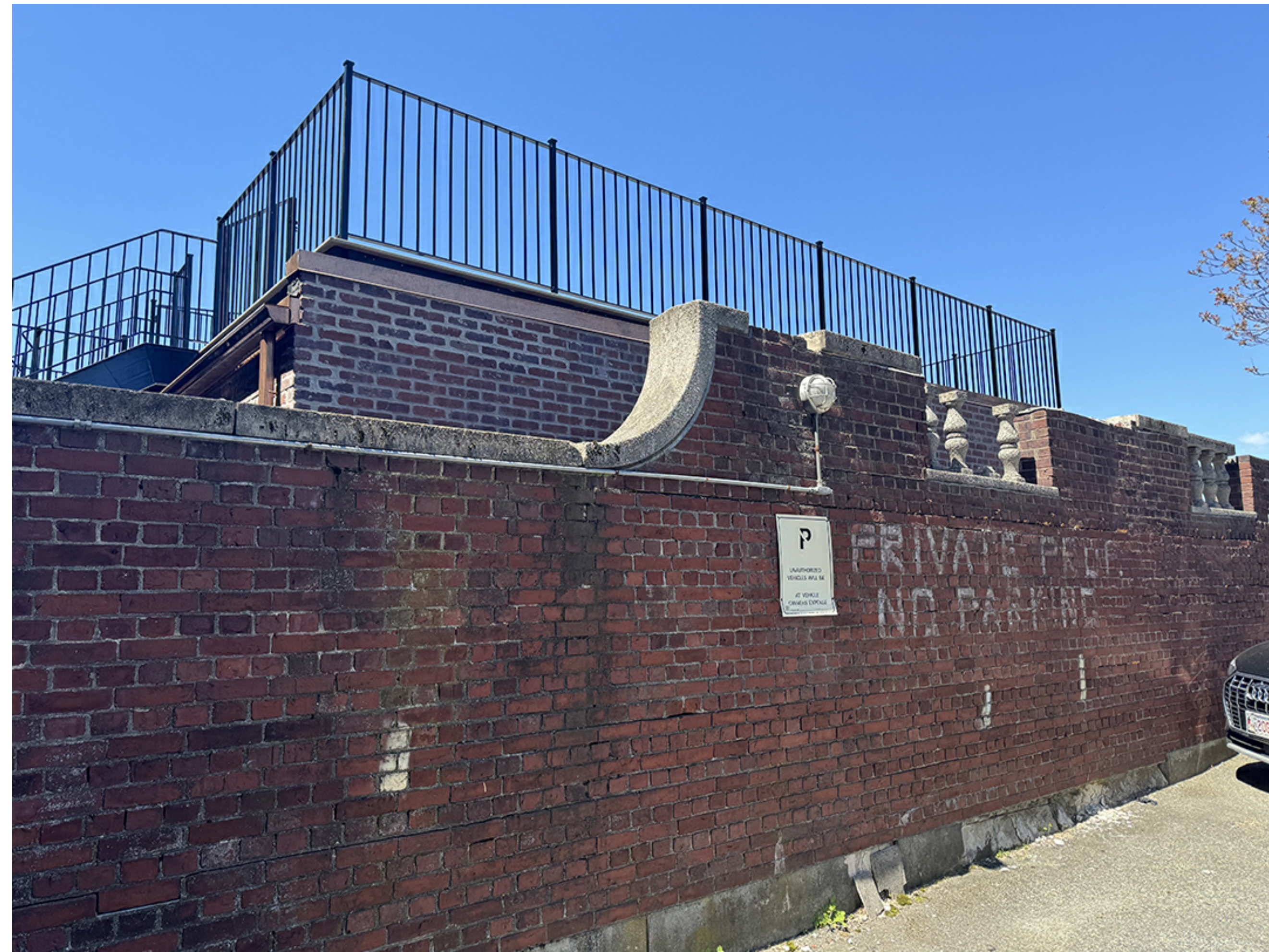
EXISTING MASONRY WALL BETWEEN PROPERTIES, NOTE DECORATIVE ADDITION TO WALL