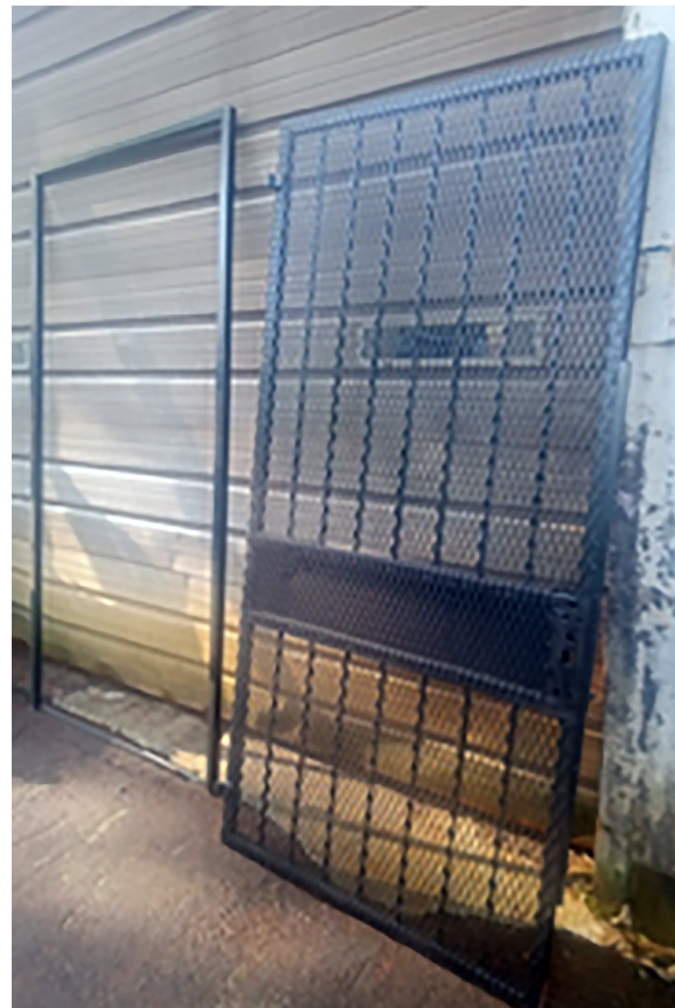
PROPOSED BLACK IRON GATE