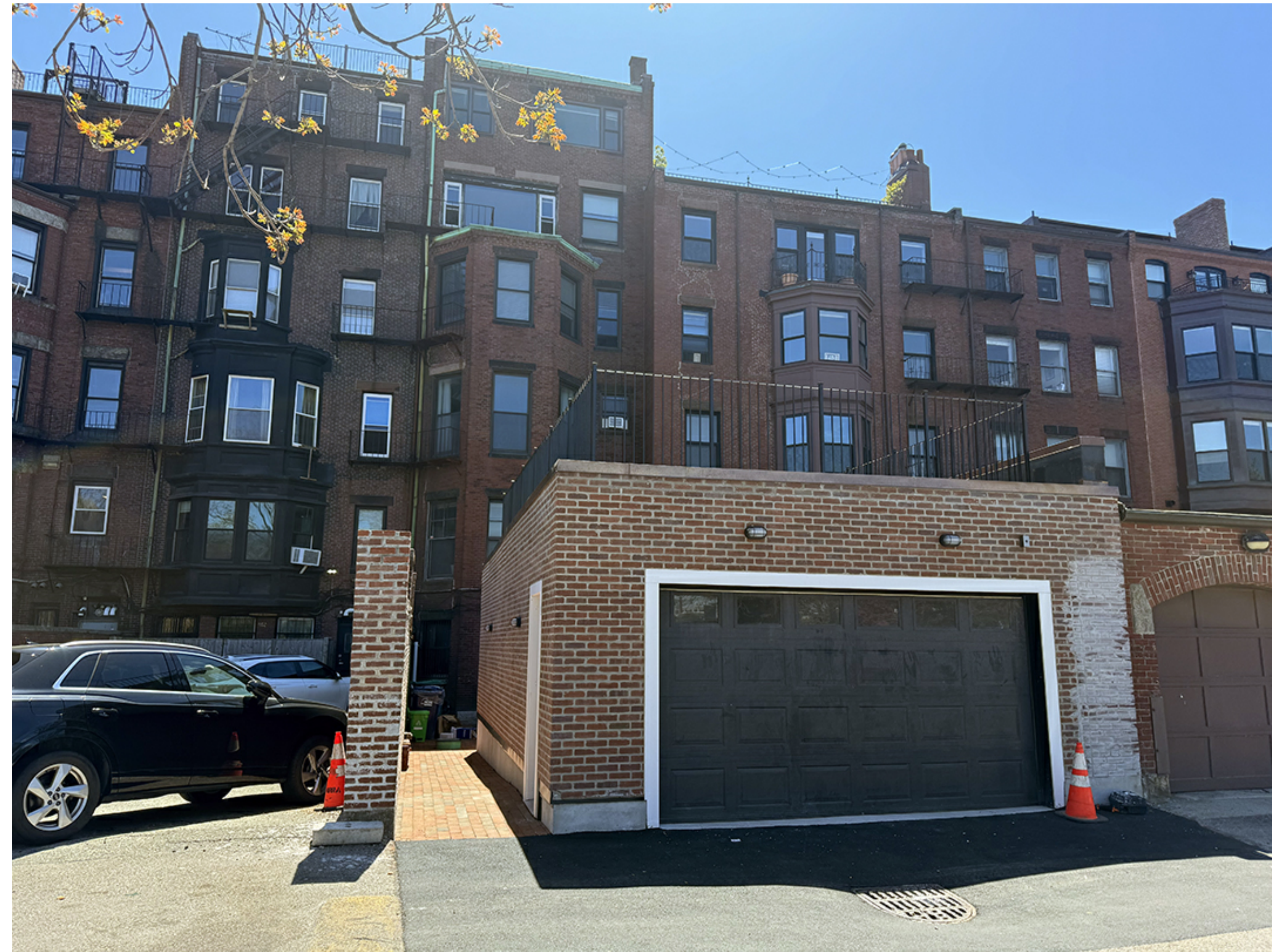
EXISTING REAR FACADE SHOWING GARAGE REBUILD