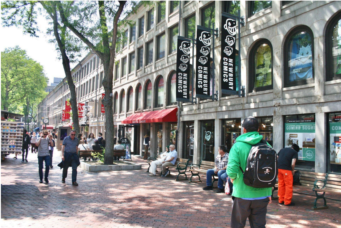
Figure 2. North Market St. façade. View from Commercial St., May 2023.