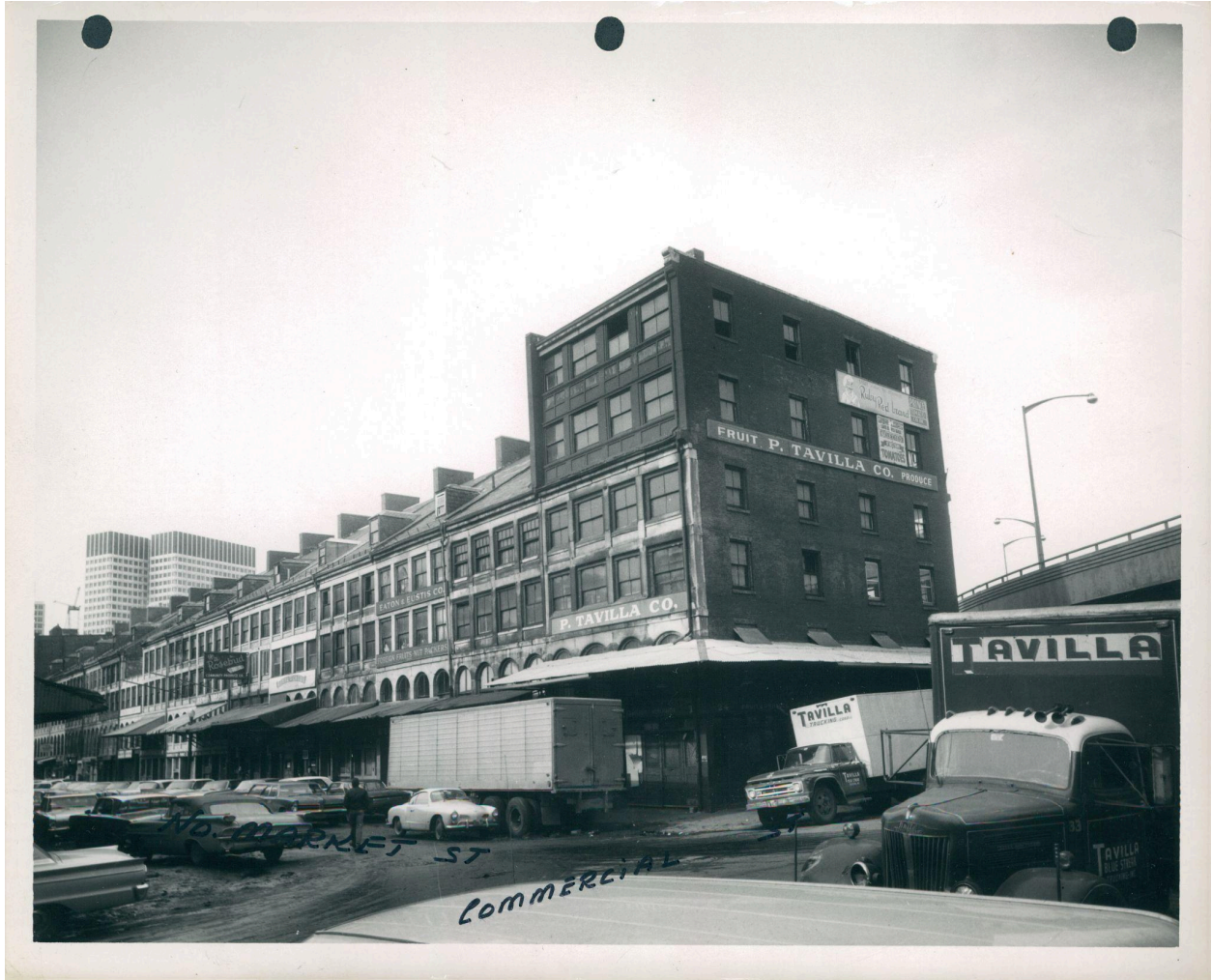
Figure 21. View northwest on North Market St. from intersection with Commercial Street showing the eastern end of North Market, February 12, 1966.