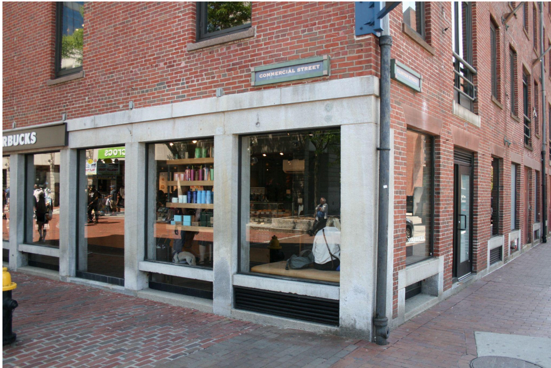
Figure 5. Detail of northeast corner, east elevation on Commercial St. (left) and rear elevation on Clinton St. (right), May 2023.