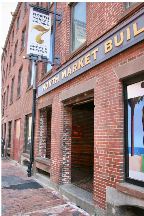
Figure 16. Brick bays converted to integral porch with recessed entry, 7 North Market Building, rear elevation, May 2023.