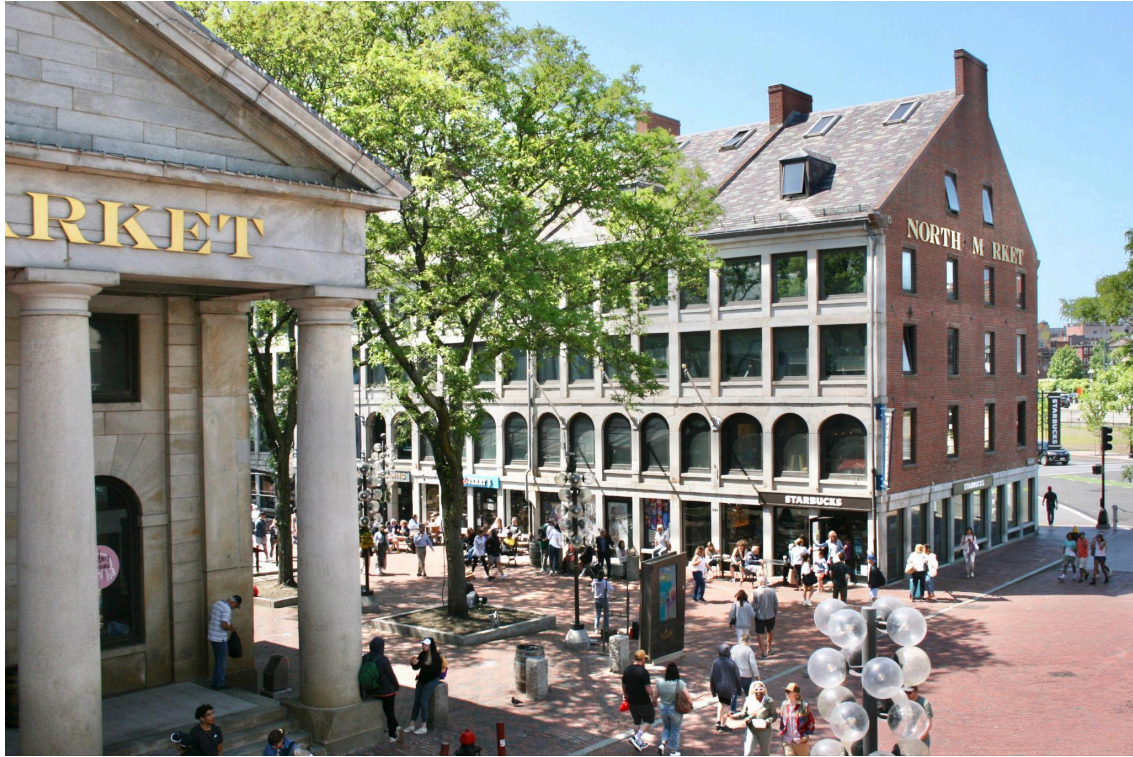
Figure 11. View across Commercial Street intersection with North Market St. showing the east end of the North Market block. Quincy Market is at left, May 2023.