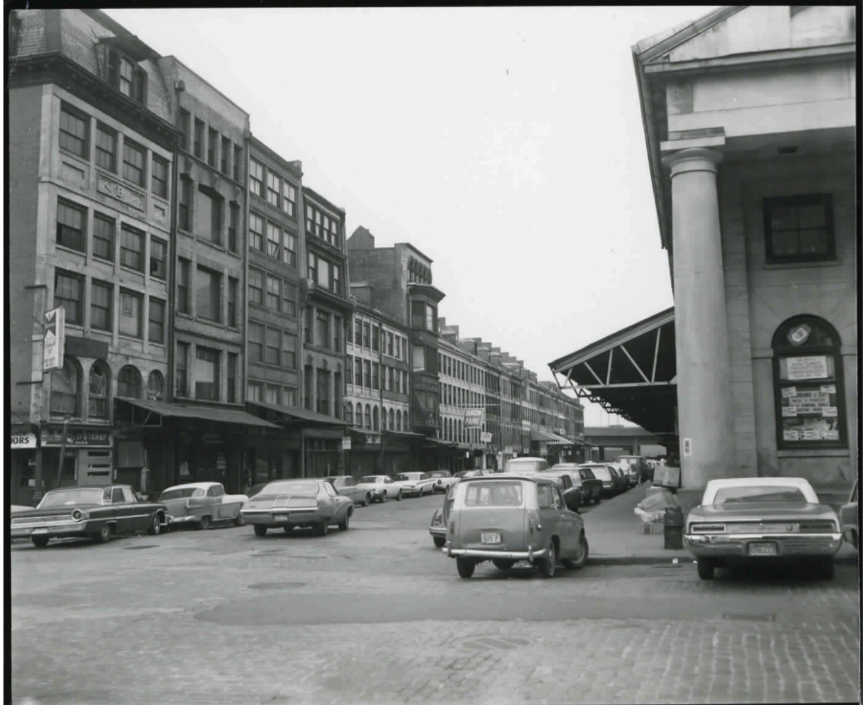
Figure 20. View northeast on North Market St. showing North Market (left) and Quincy Market (right), April 13, 1970.