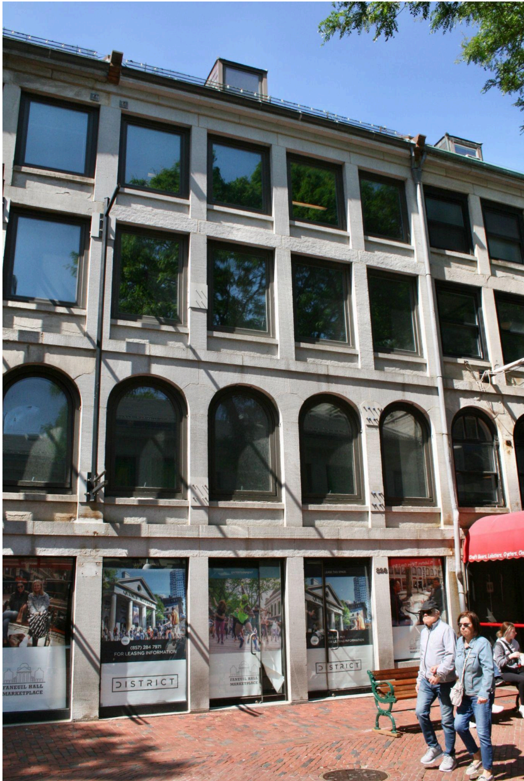
Figure 6. Typical four-bay building on North Market St. façade, May 2023.