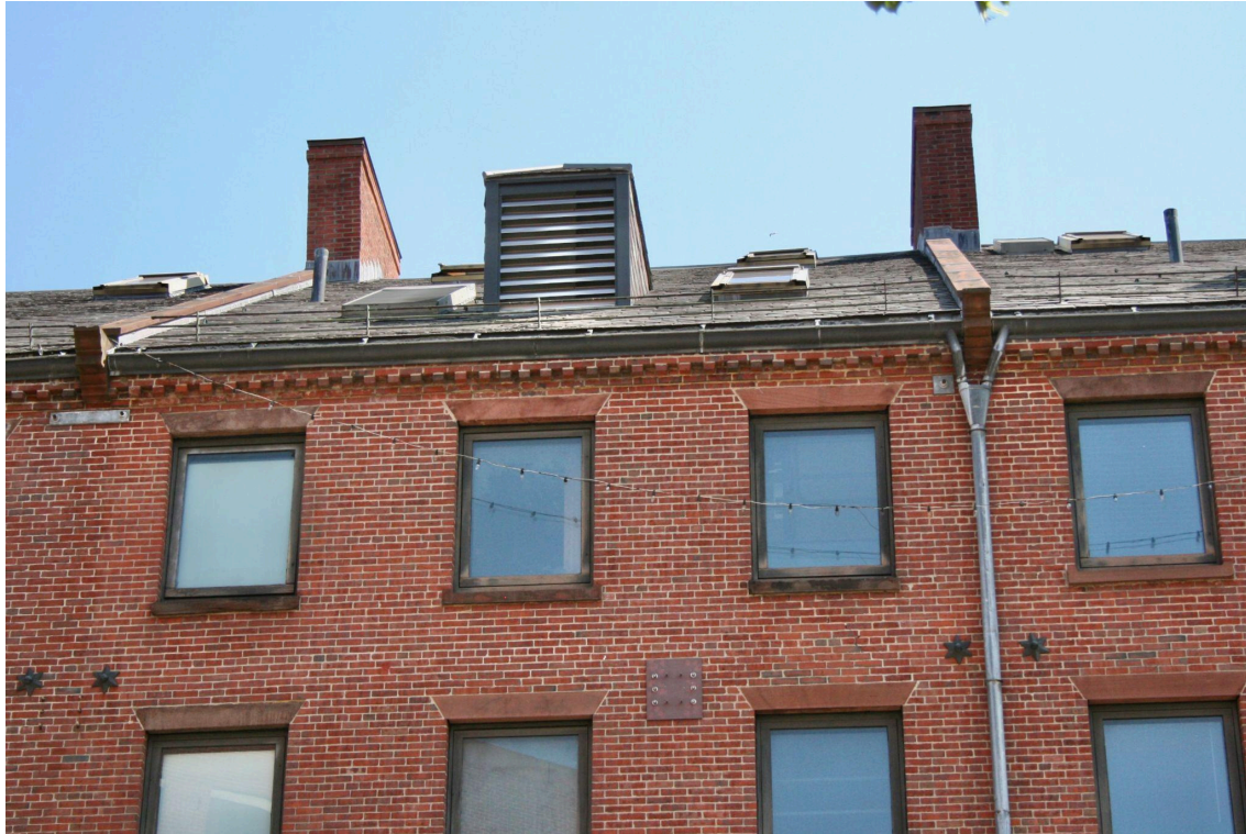
Figure 9. Brick construction detail, rear elevation on Clinton St., May 2023.