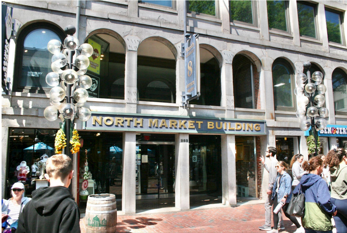
Figure 15. Granite bays converted to integral porches with recessed entries (first and second stories), 8 North Market Building façade, May 2023.