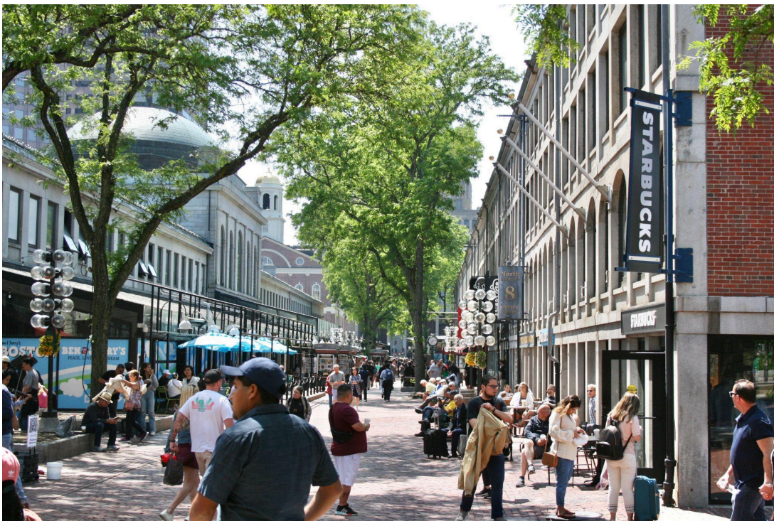
Figure 3. North Market St. façade. View from Commercial St. showing Quincy Market (left) and Faneuil Hall (left background), May 2023.