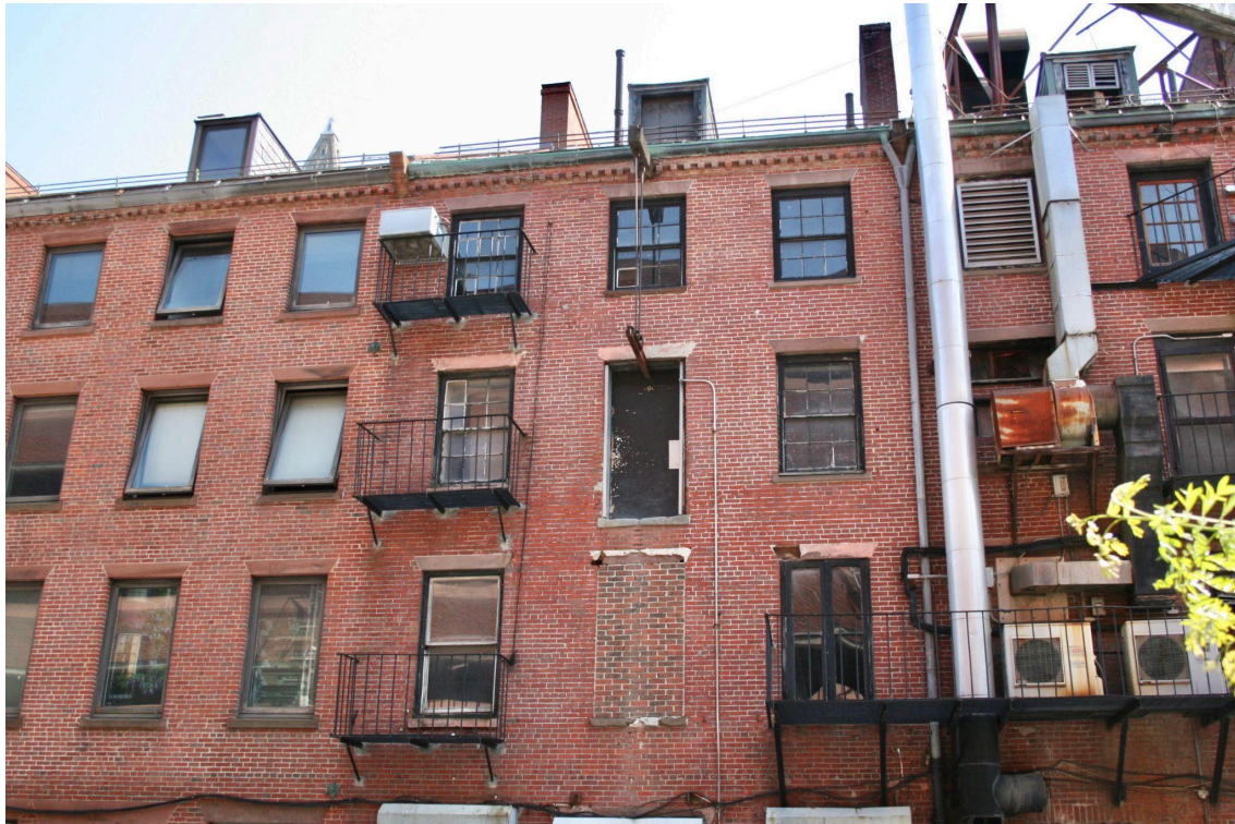
Figure 10. Rear elevation of 28-27 Clinton St. (center) and 30-29 Clinton St. (right), former Durgin-Park restaurant, May 2023.