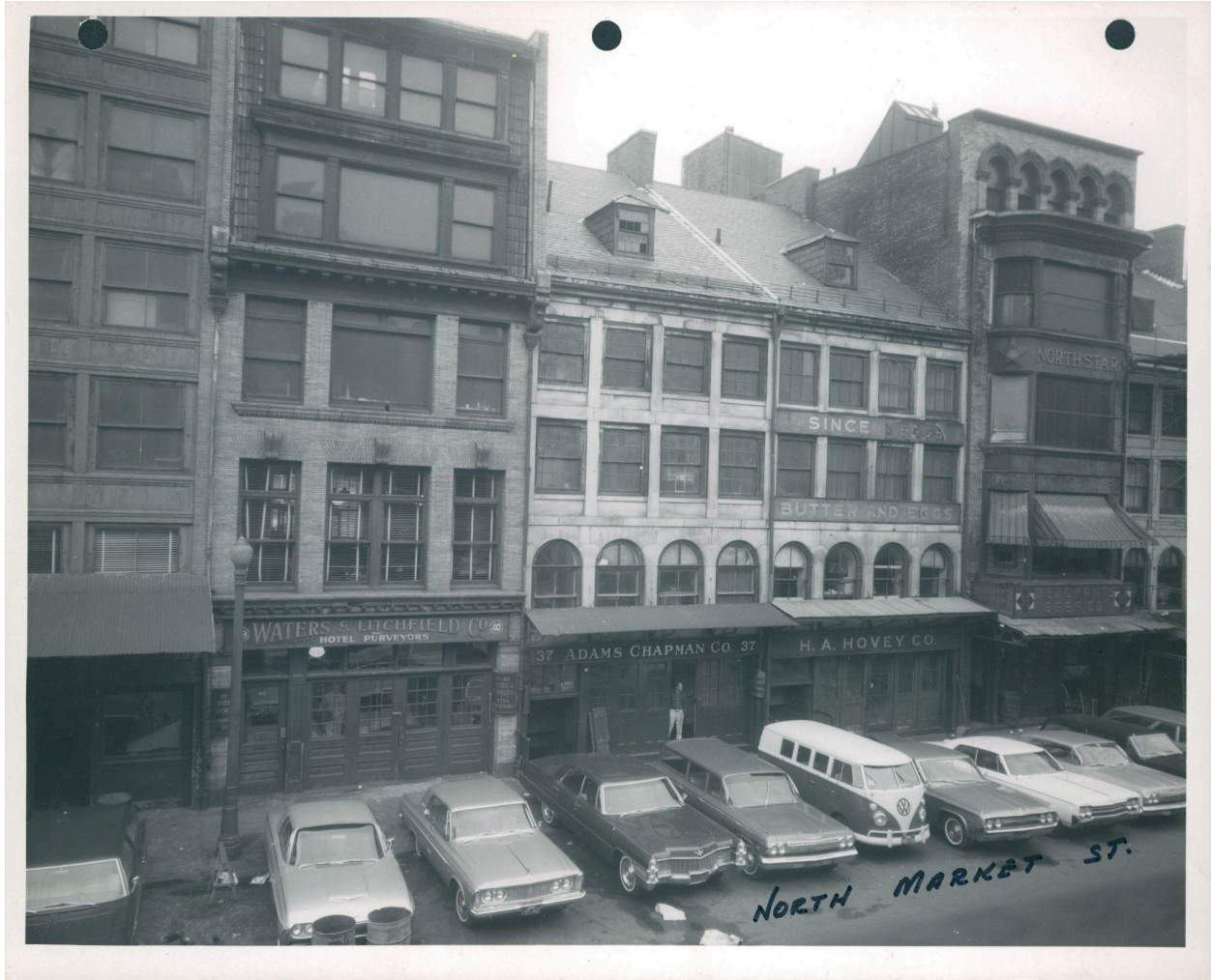
Figure 22. Detail of North Market façade, showing 41, 39-40, 37, 35-36, 33-34, and 30 North Market St. (left to right), April 29, 1966.