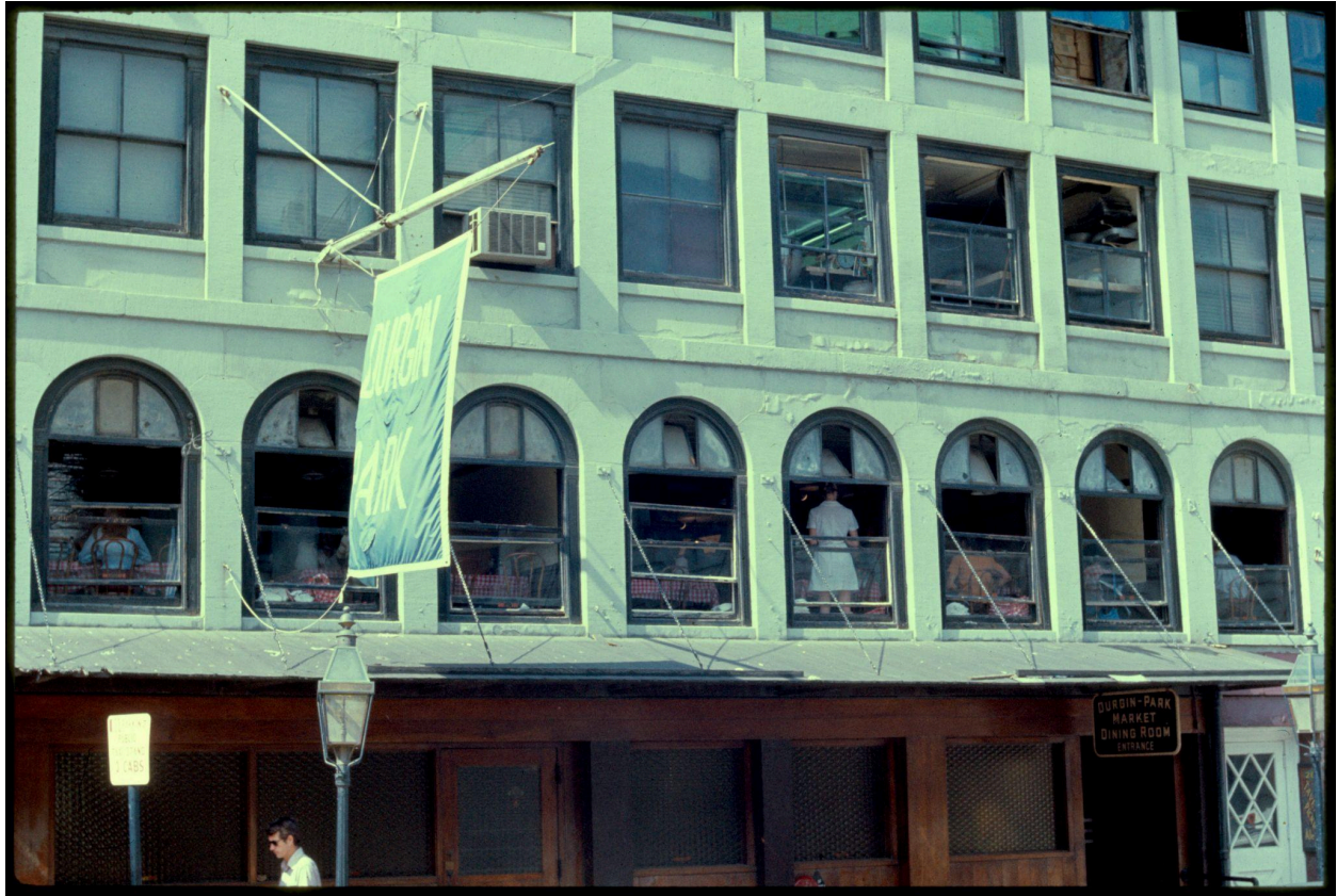
Figure 25. Durgin-Park restaurant, North Market St.