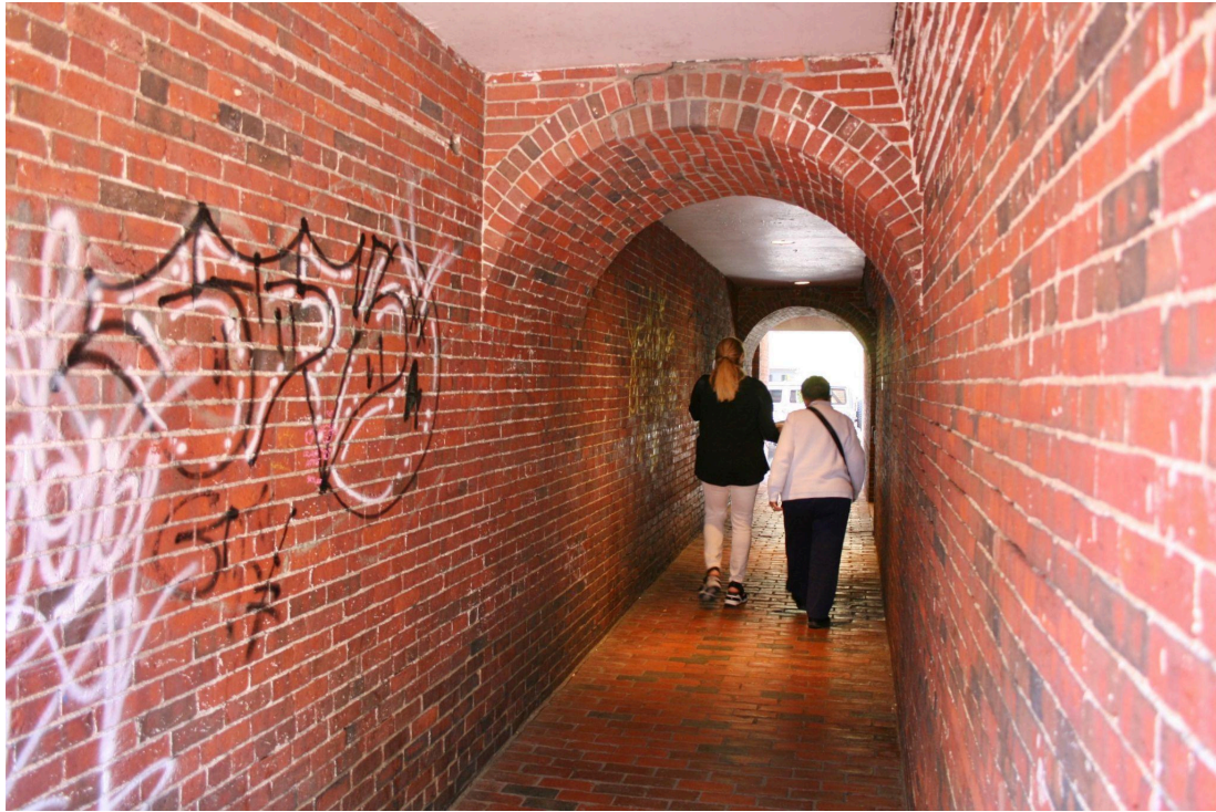
Figure 4. Passageway north from North Market St. to Clinton St., May 2023.