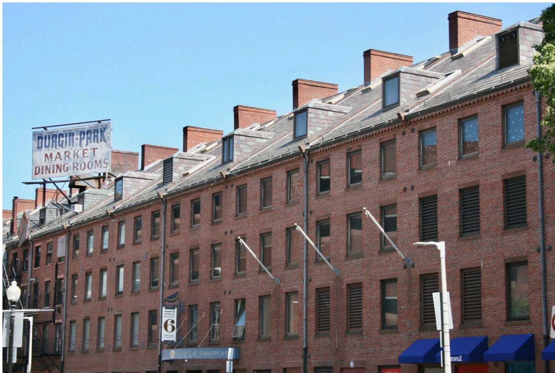
Figure 12. Roofline on Clinton St. rear elevation, May 2023.