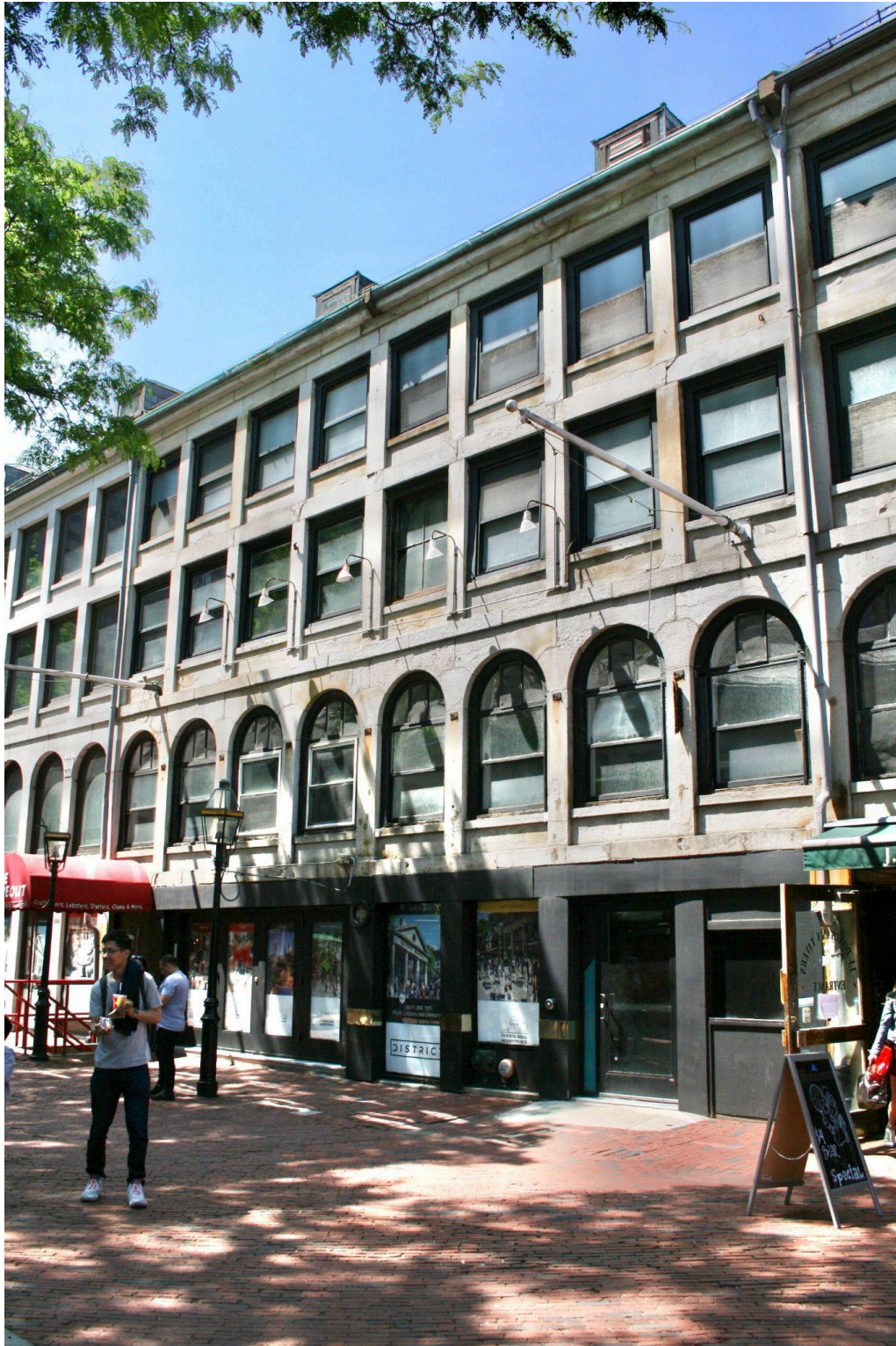
Figure 17. Former Durgin-Park restaurant. North Market St. façade, May 2023.