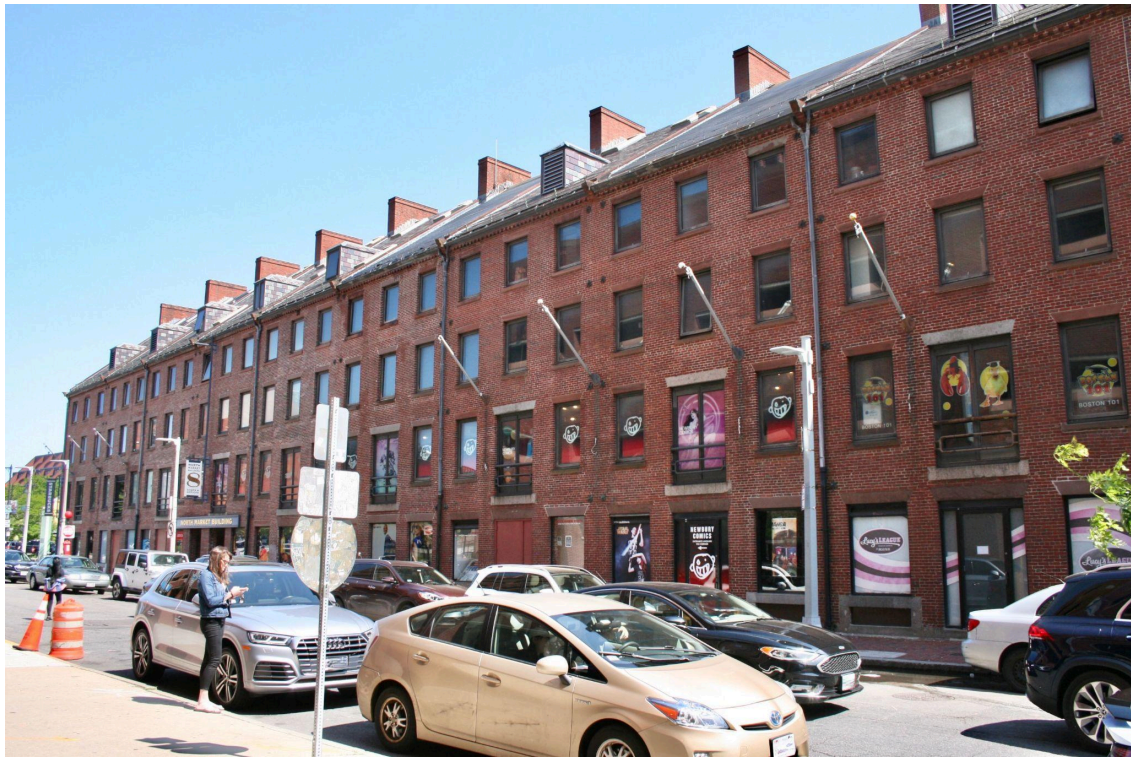
Figure 8. West end of rear elevation on Clinton St., May 2023.