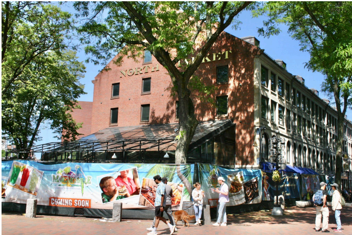
Figure 14. West elevation greenhouse addition. View from the intersection of North Market St. and Merchants Row, May 2023.