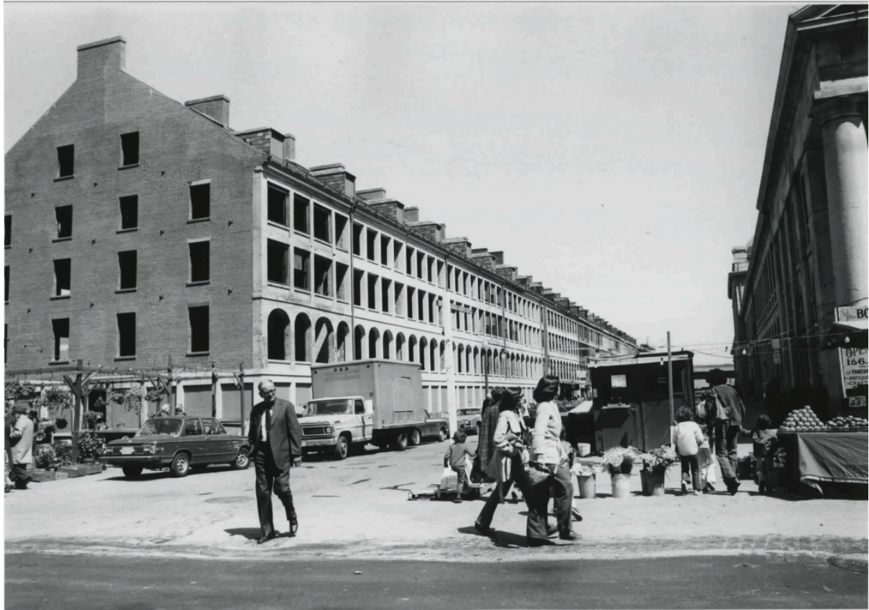
Figure 24. View of North Market St. showing North Market (left) after restoration of exterior to its 1826 appearance. Quincy Market is at the right. April 1975.