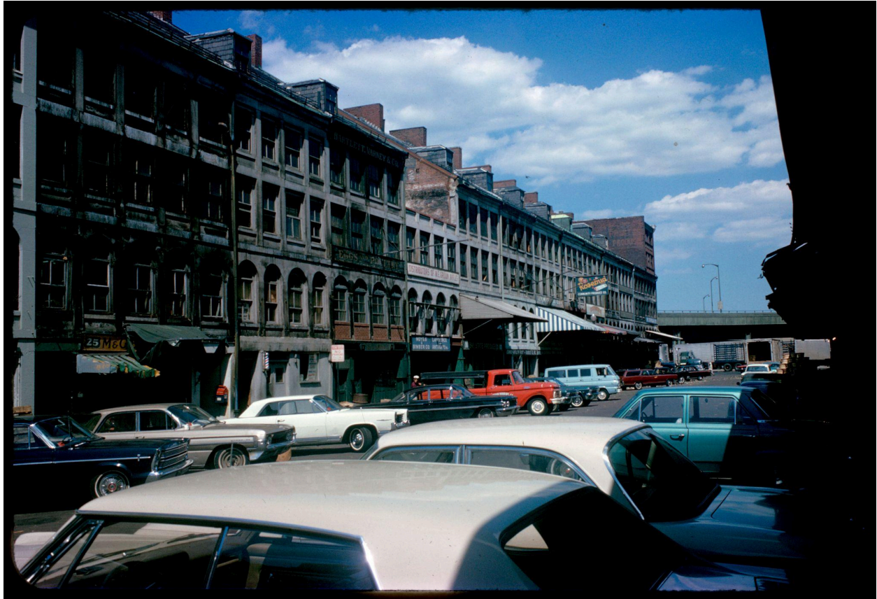
Figure 23. North Market St. View northeast, including 19 North Market St. (at center, behind red truck) after the fourth story and attic were removed. 1966.