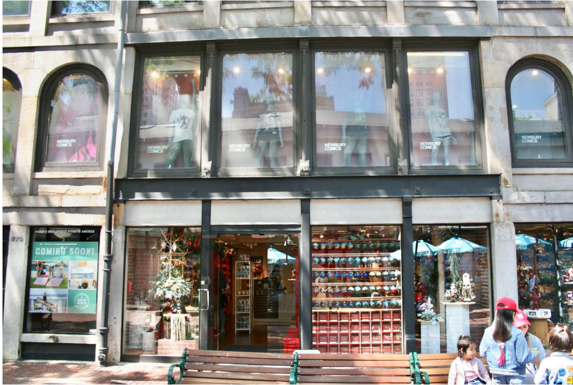
Figure 13. Iron storefront detail, 12 North Market St. façade, May 2023.