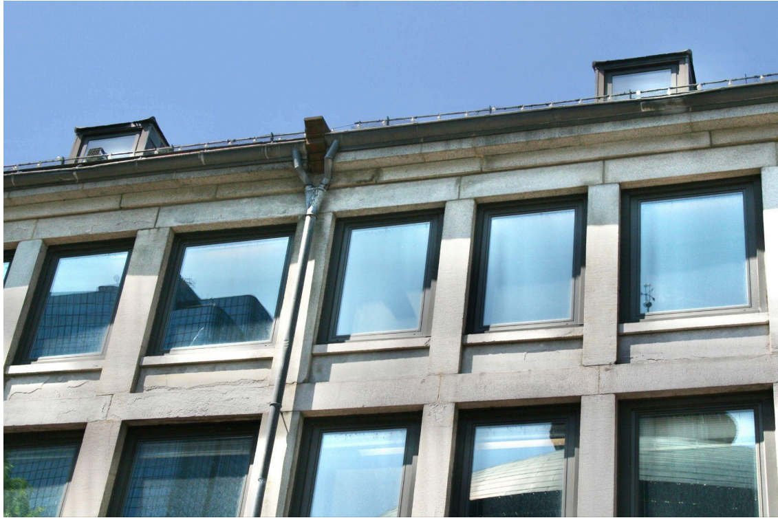
Figure 7. Granite construction detail, North Market St. façade, May 2023.