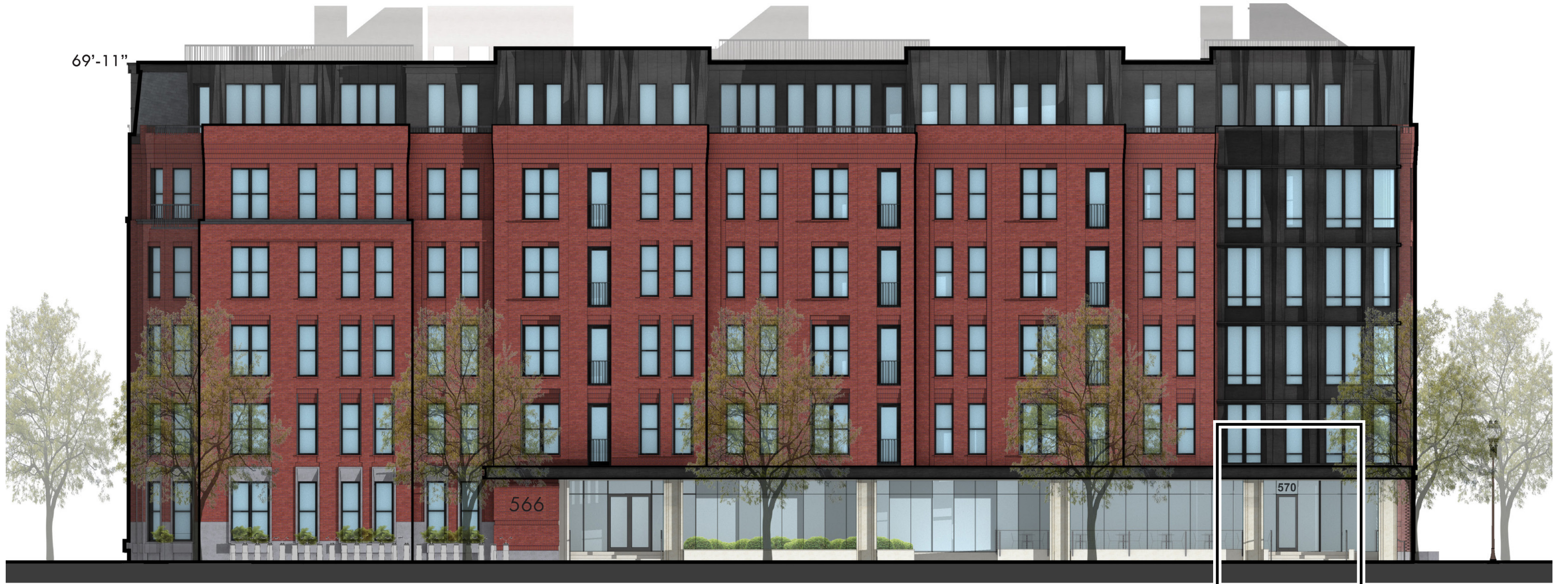
CORNER RETAIL SIGNAGE