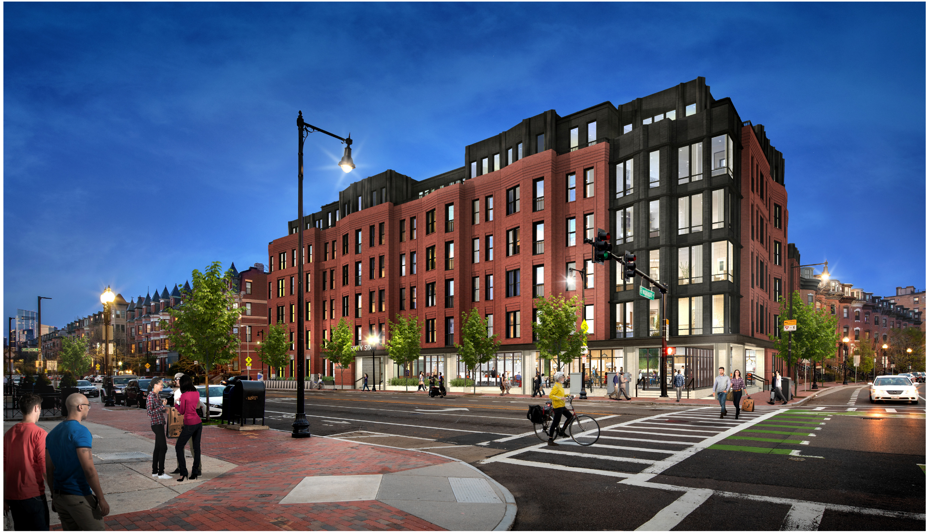
566 COLUMBUS AVE., SOUTH END // SOUTH END LANDMARKS // MARCH 2024