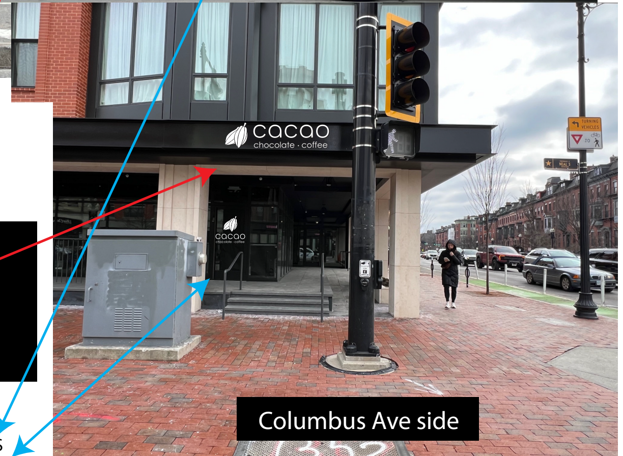
Columbus Ave side

36" WHITE VINYL LOGOS WILL BE INSTALLED ON 2 WINDOWS