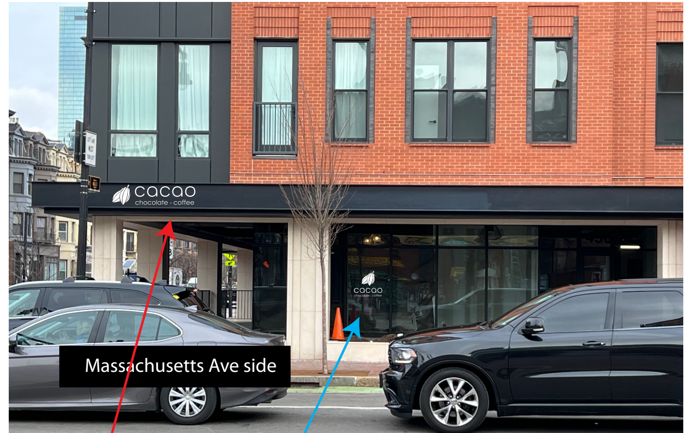
Massachusetts Ave side

1" THICK PAINTED PVC LETTERS WILL BE ATTACHED USING 3M VHB MOUNTING TAPE AND SILICONE GLUE