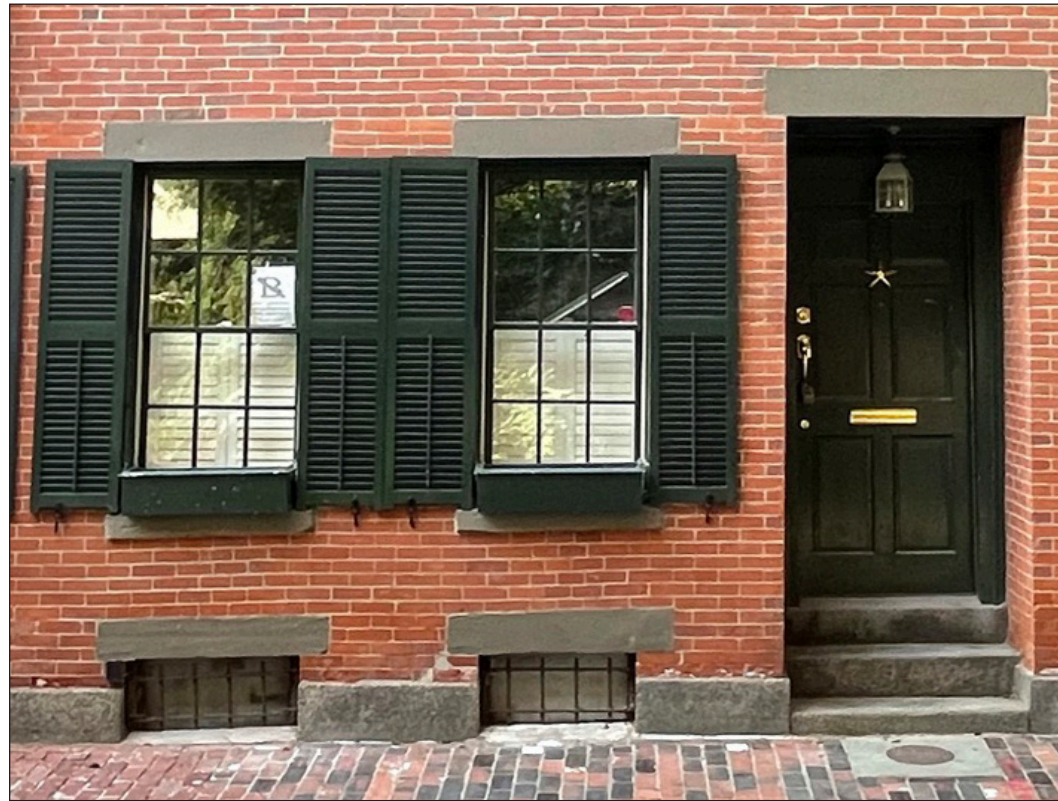
EXISTING WORK AREA

NEW DOOR LEAF AND JAMBS TO MATCH EXISTING. ADD THRESHOLD TO IMPROVE WEATHER SEALING. SEE ATTACHED CUT SHEET.