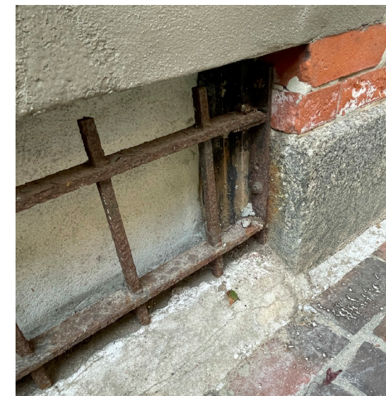
EXISTING PREVIOUSLY INFILLED BASEMENT WINDOWS