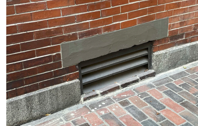
EXISTING LOWER WINDOW INFILLS ON LAWRENCE STREET

AT EACH LOW WINDOW: NEW SLOPED GRANITE CURBS TO REPLACE DETERIORATING PARGED SILLS. MATCH GRANITE MATERIAL AT BUILDING'S EXISTING WATER TABLE AND STEPS. TOP OF CURBS TO BE 2" ABOVE BRICK SIDEWALK FOR IMPROVED WATER DRAINAGE. CURB TOPS TO BE SLOPED 1/4" PER FOOT AWAY FROM BRICK FACADE.