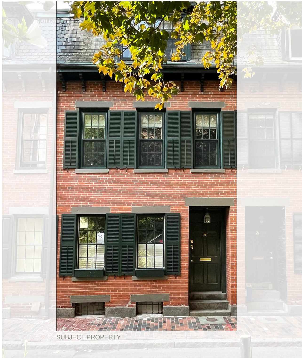
EXISTING FRONT FACADE