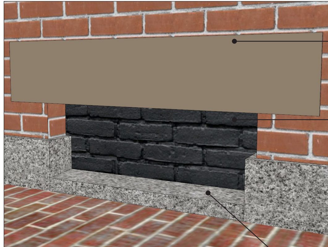
PROPOSED IMPROVEMENTS TO INFILLED LOW WINDOWS