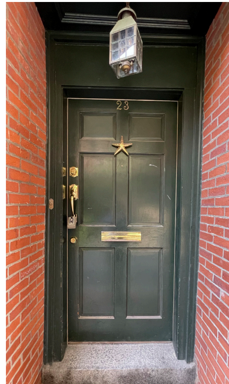
EXISTING FRONT DOOR