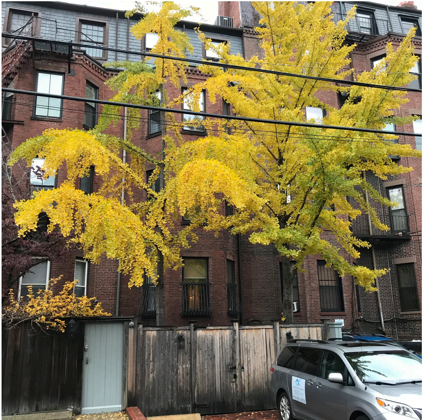
① FEMALE GINKGO (LEFT) MALE GINKGO (RIGHT)