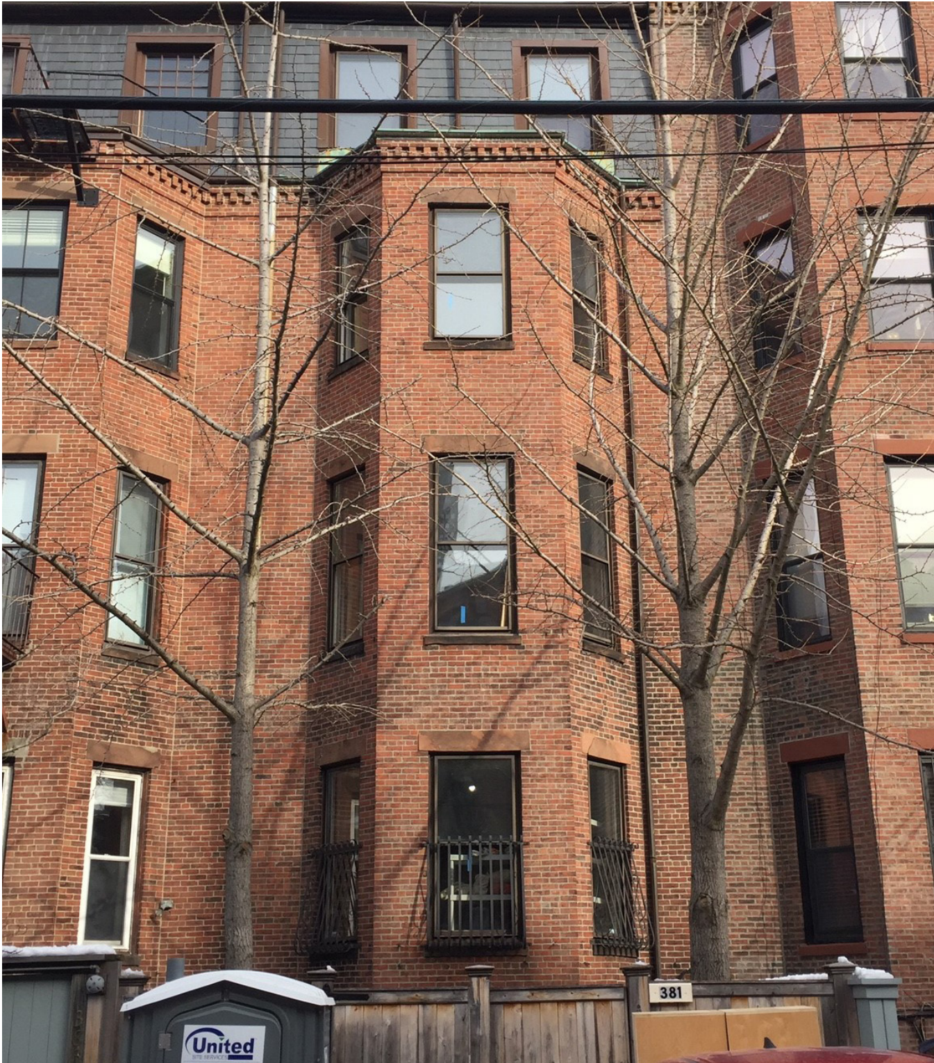
② FEMALE GINKGO (LEFT) MALE GINKGO (RIGHT)