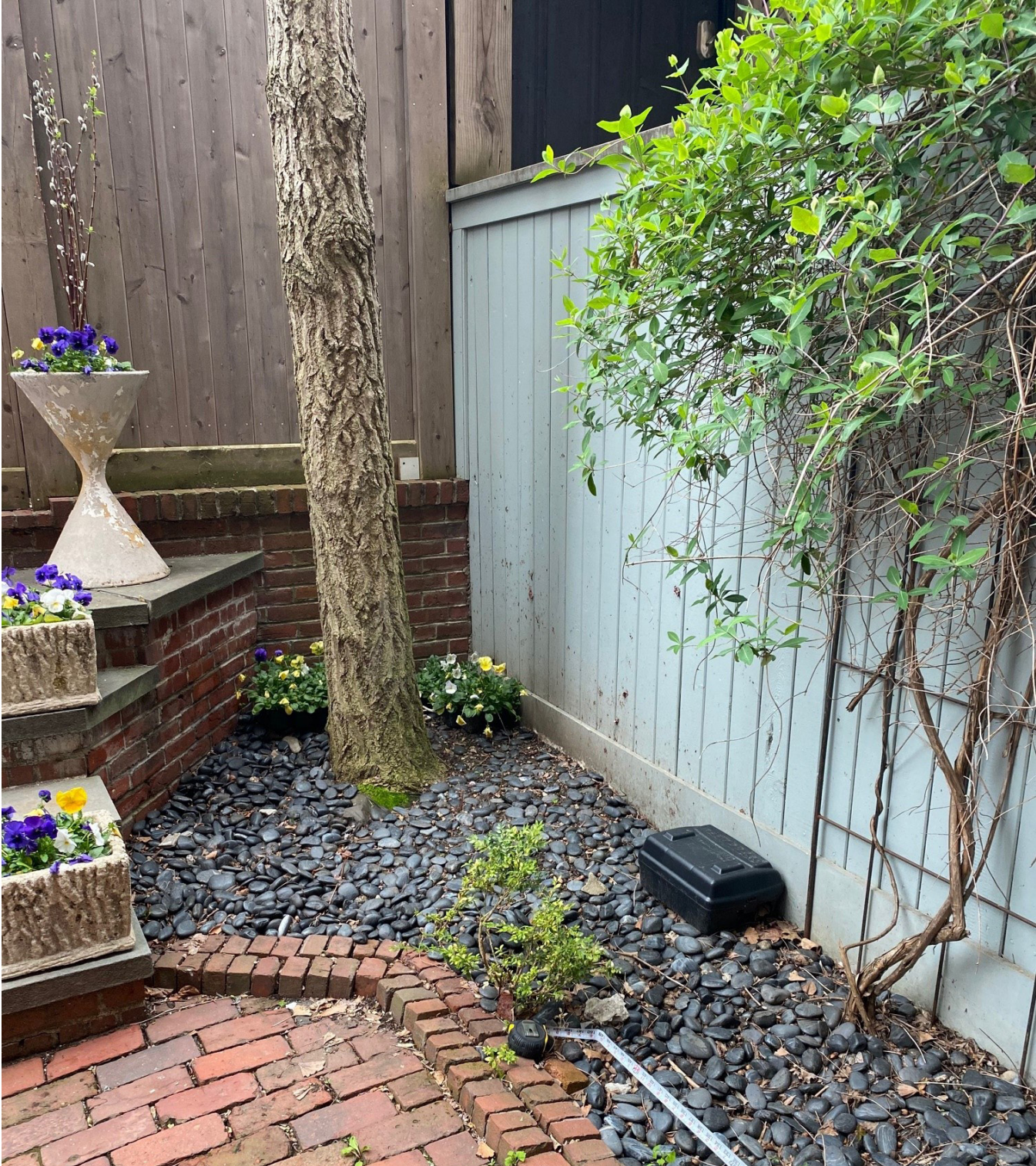
3. FEMALE GINKGO