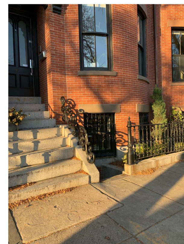
5 EXISTING RAILING 97 WARREN AVE 1 1/2" = 1'-0"