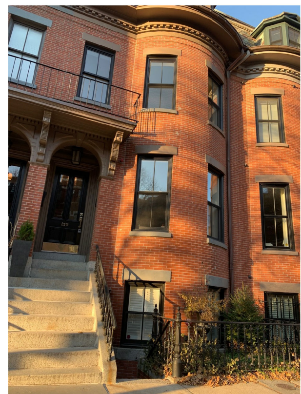
8 EXISTING RAILING 139 WARREN AVE 1 1/2" = 1'-0"