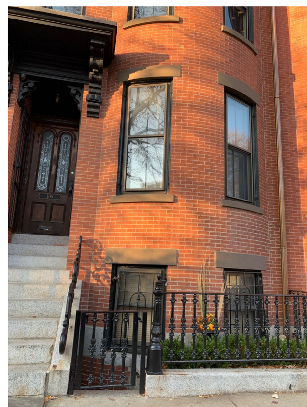
7 EXISTING RAILING 109 WARREN AVE 1 1/2" = 1'-0"