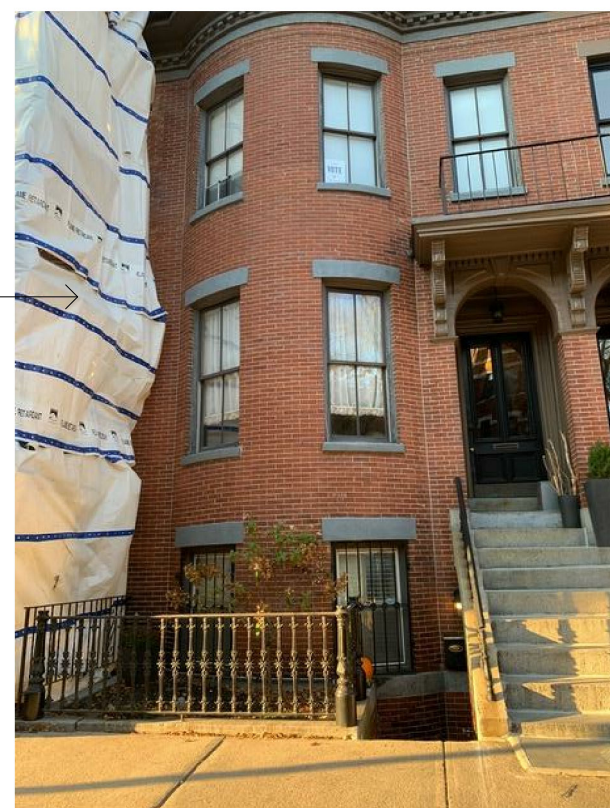
9 EXISTING RAILING 141 WARREN AVE 1 1/2" = 1'-0"