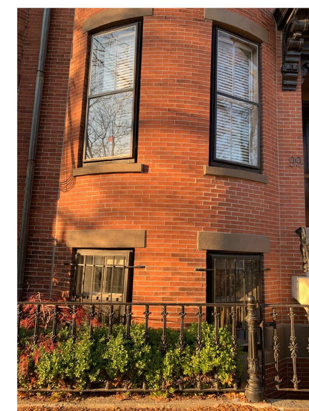
4 EXISTING RAILING 90 WARREN AVE 1 1/2" = 1'-0"