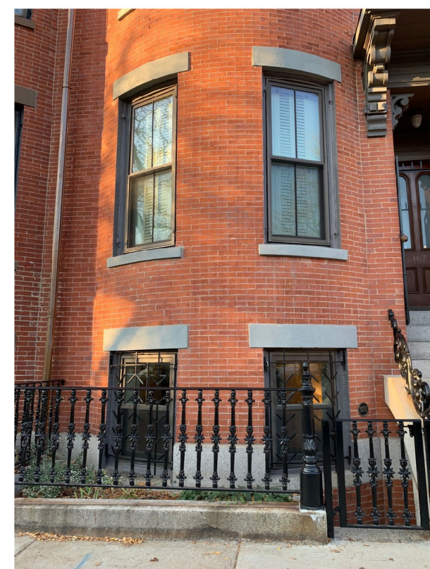
6 EXISTING RAILING 107 WARREN AVE 1 1/2" = 1'-0"