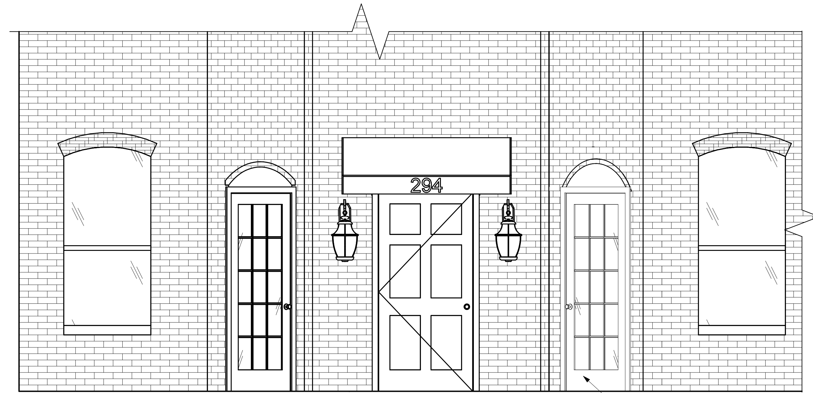
4 ELEVATION - PROPOSED ENTRY - NORTH 1/2" = 1'-0"

NEW FREHNCH MULLION DOOR TO MATCH NEIGHBORING ENTRY