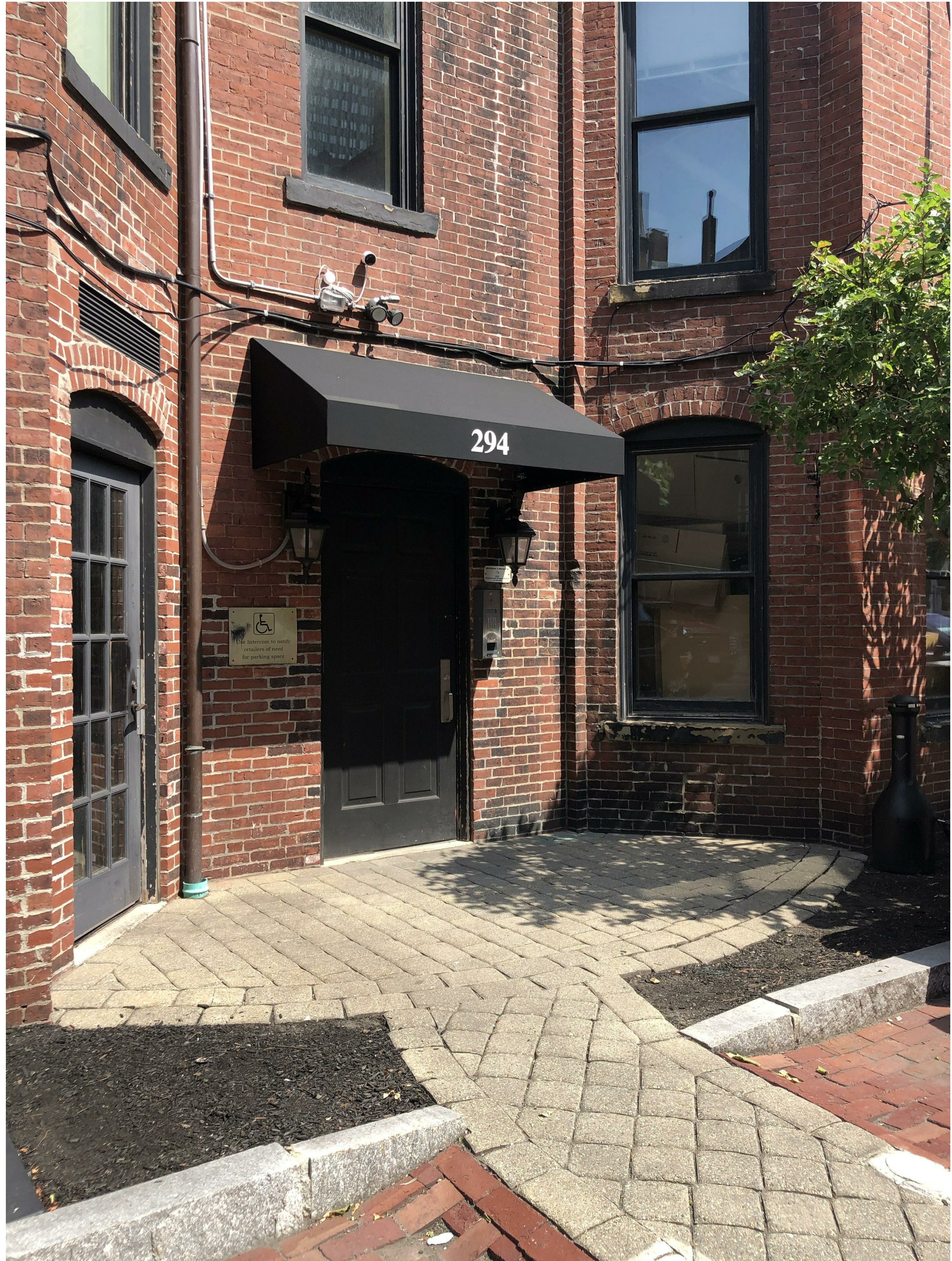
1 292 NEWBURY STREET - EXISTING REAR ENTRY 1 1/2" = 1'-0"