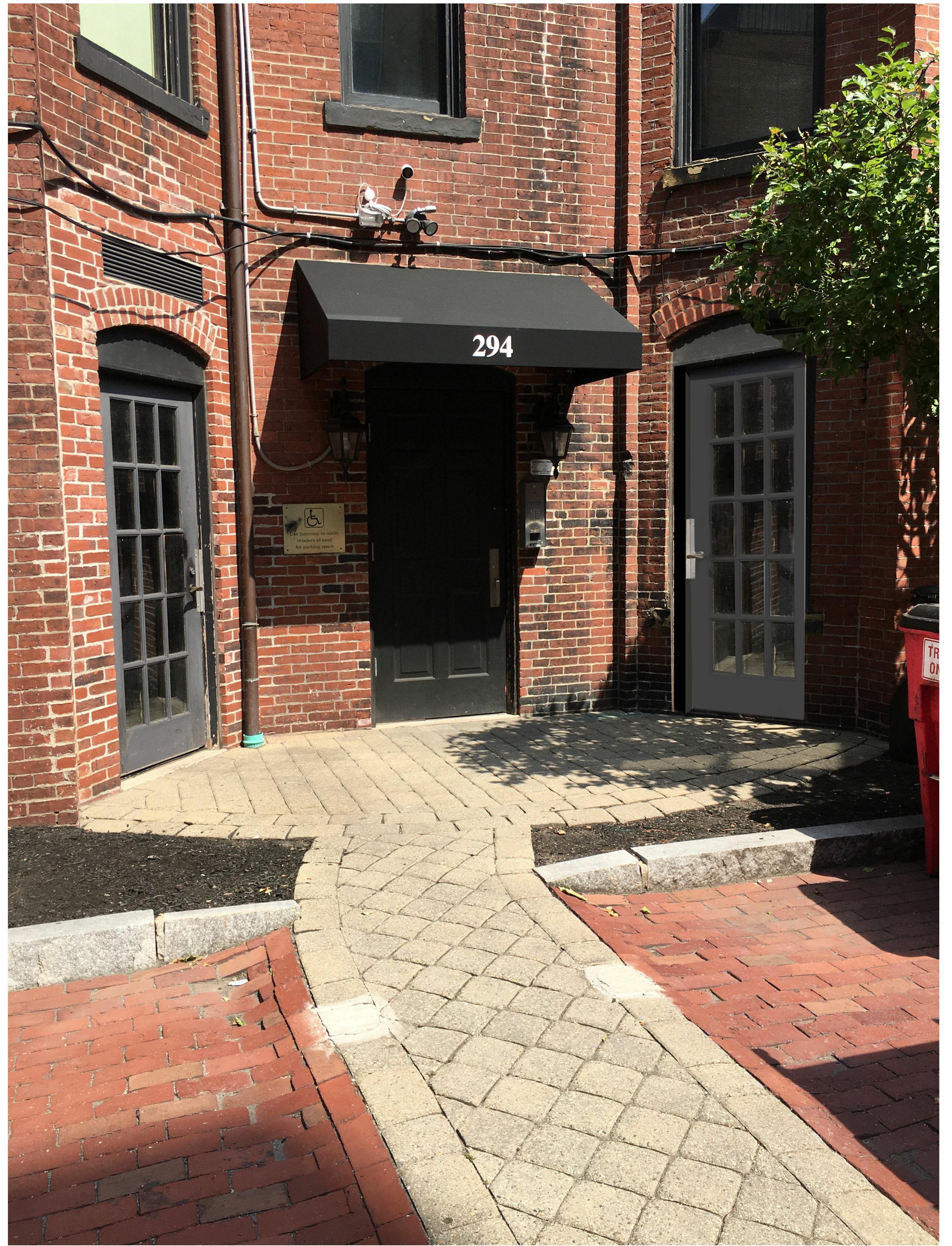
2 292 NEWBURY STREET - PROPOSED REAR ENTRY 1 1/2" = 1'-0"