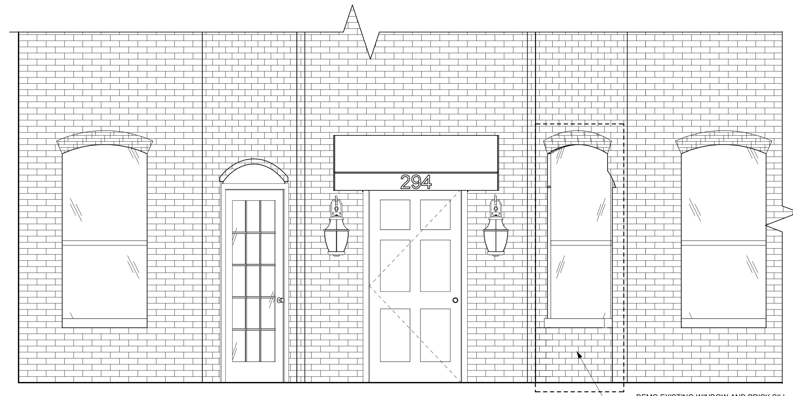
2 ELEVATION - EXTERIOR - NORTH 1/2" = 1'-0"