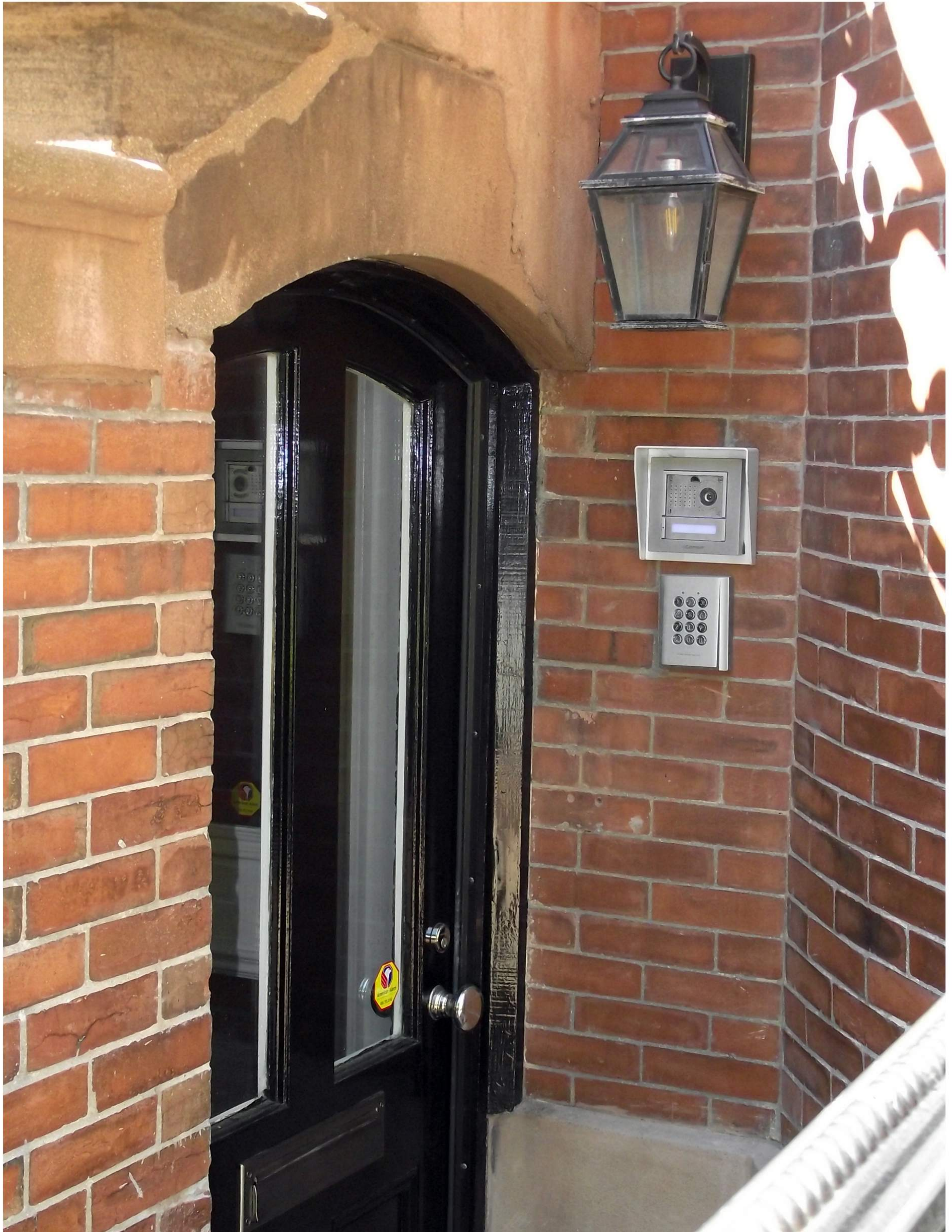
158 West Canton Street: Garden Level Entry Door Door and exterior trim precedent at neighboring building (166 West Canton)