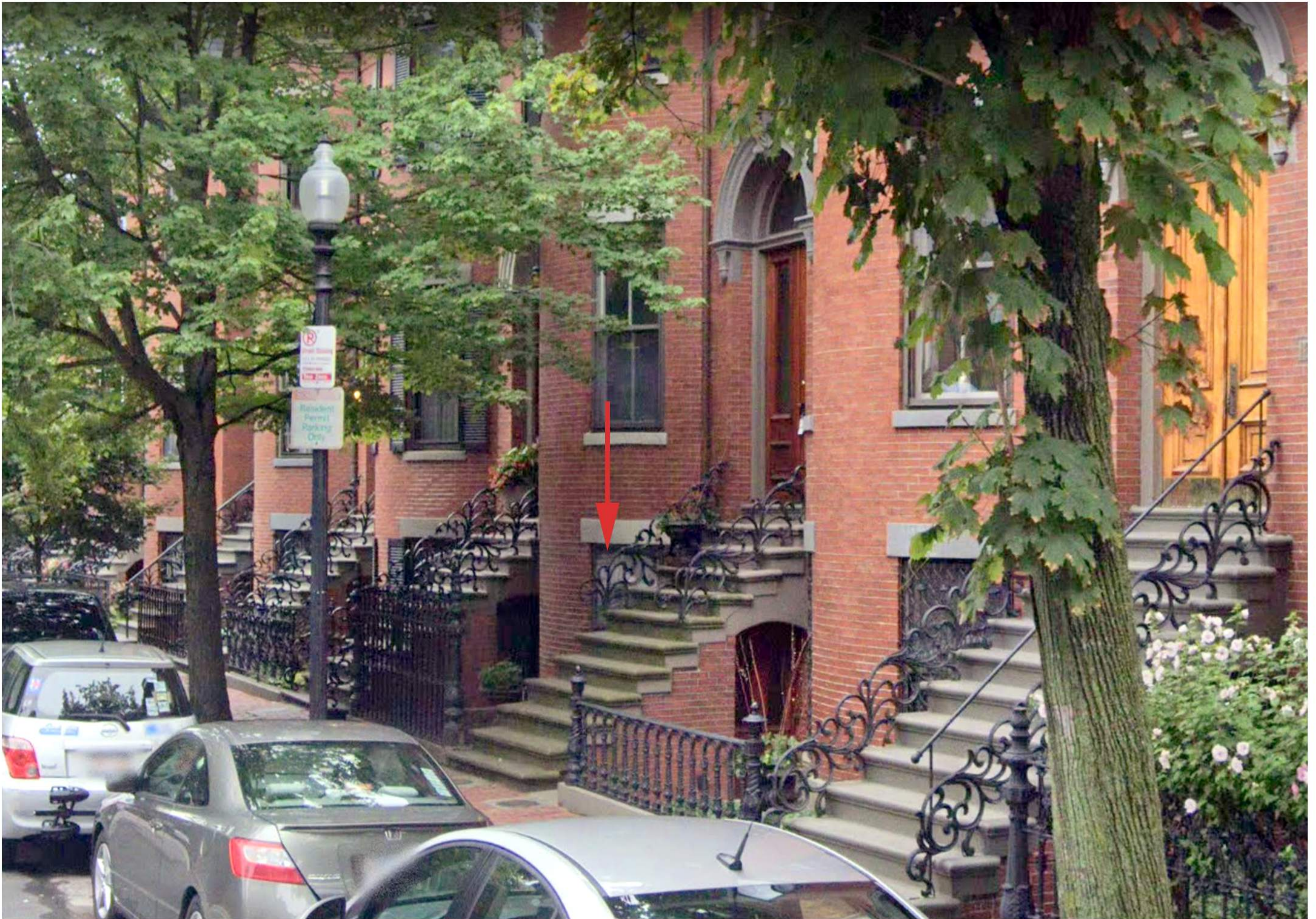
158 West Canton Street: Decorative Metal Railings Existing conditions before start of construction (2018) showing incomplete half railings