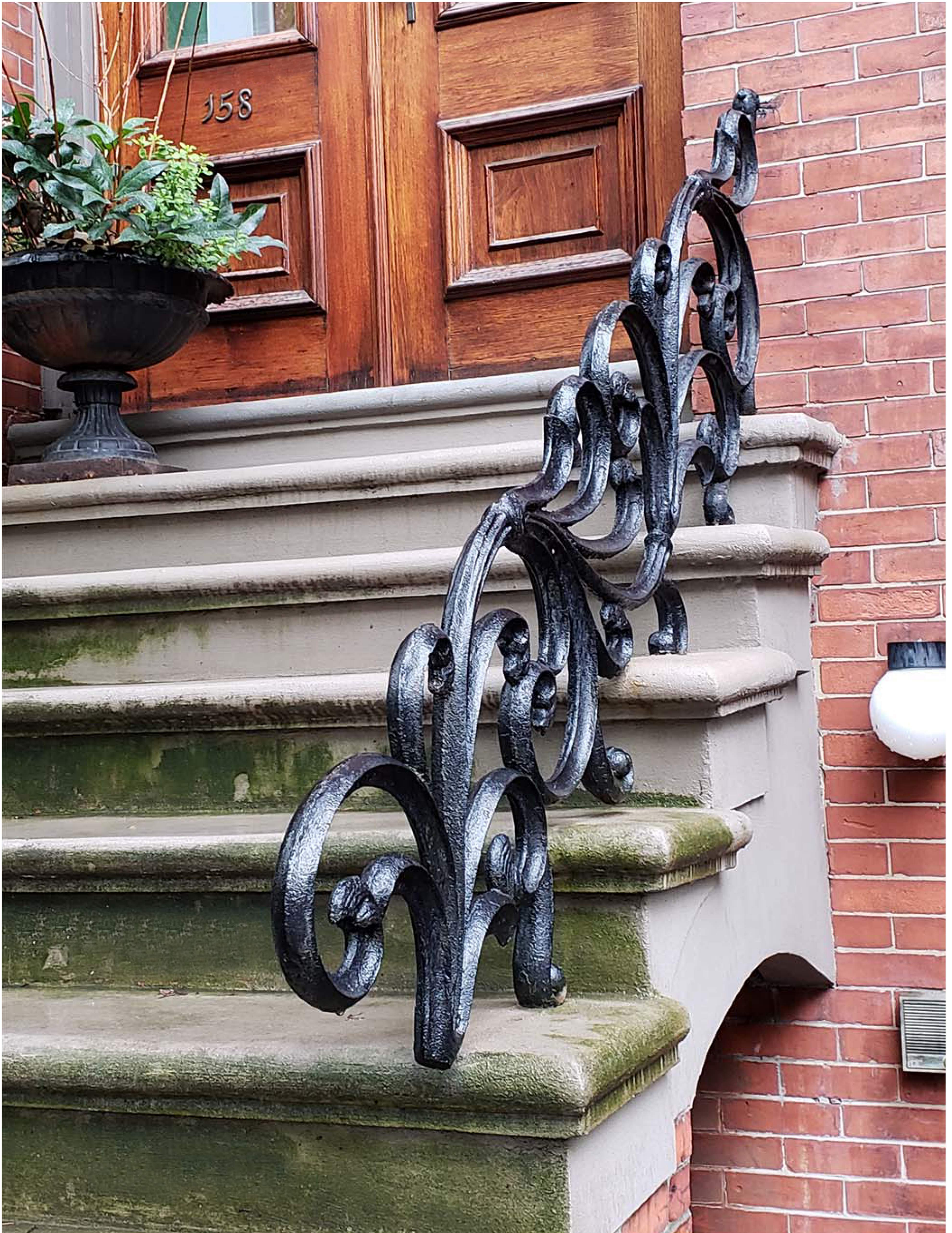
158 West Canton Street: Decorative Metal Railings Existing conditions before start of construction (2018) showing incomplete railings