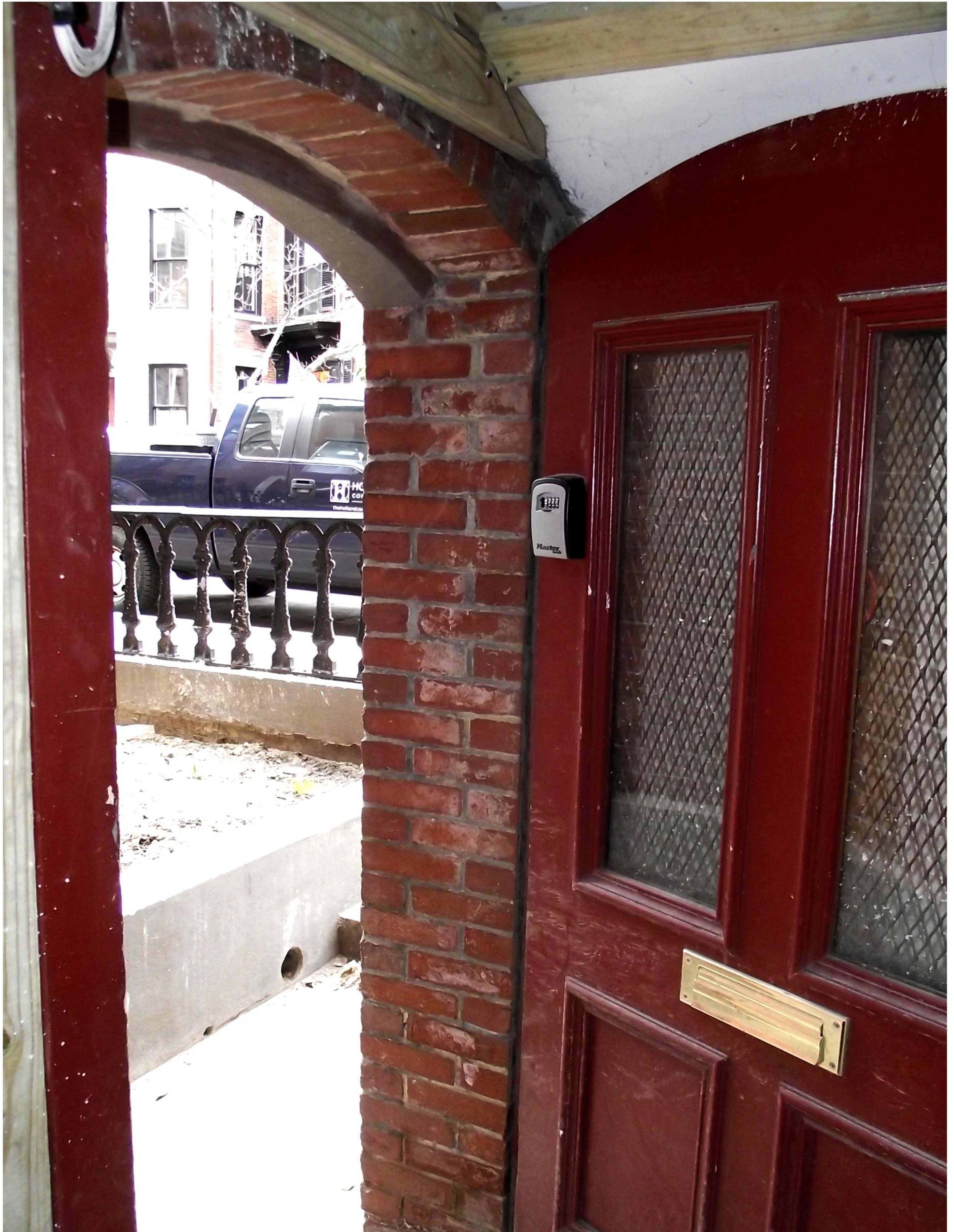
158 West Canton Street: Garden Level Entry Door Existing conditions during construction (2020)