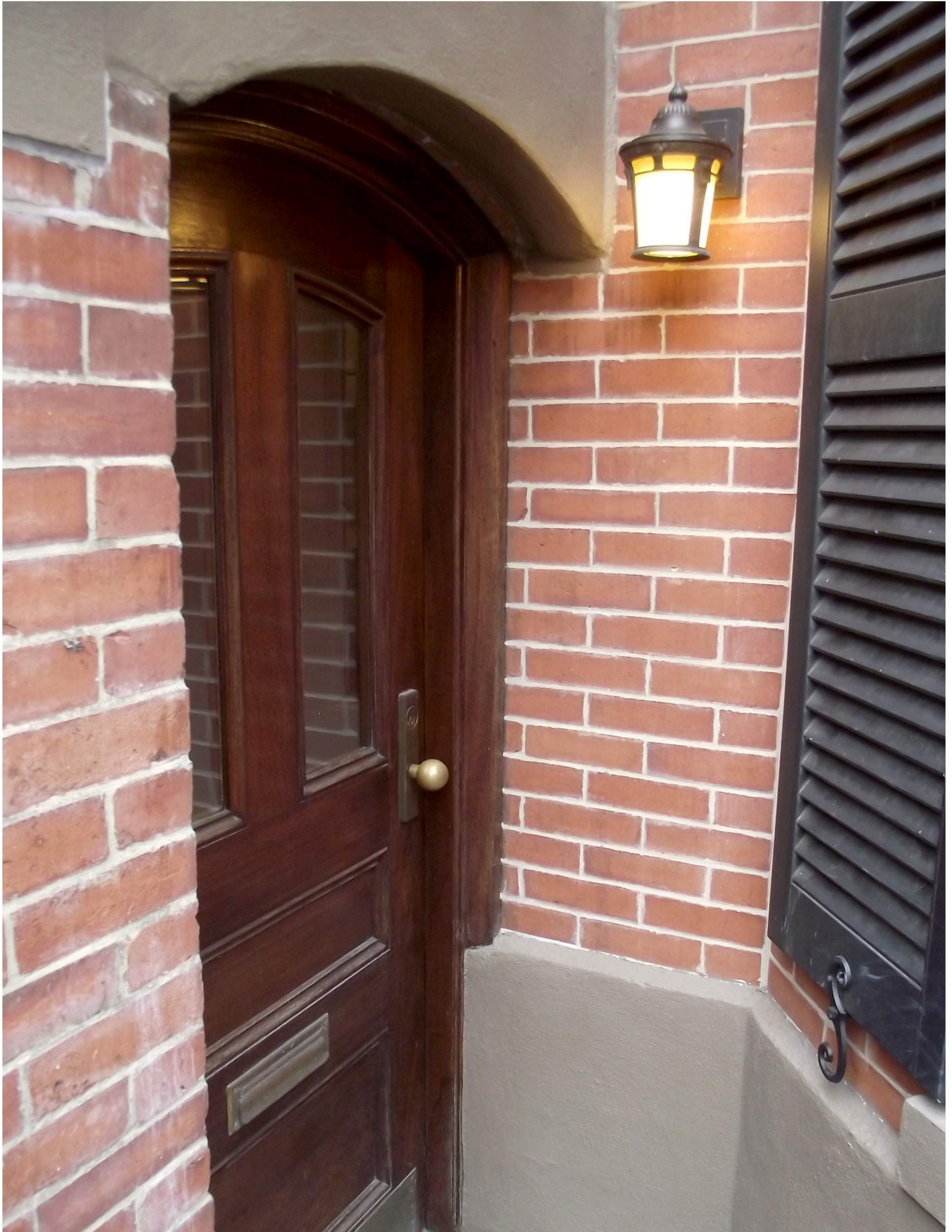
158 West Canton Street: Garden Level Entry Door Door and exterior trim precedent at neighboring building (154 West Canton)