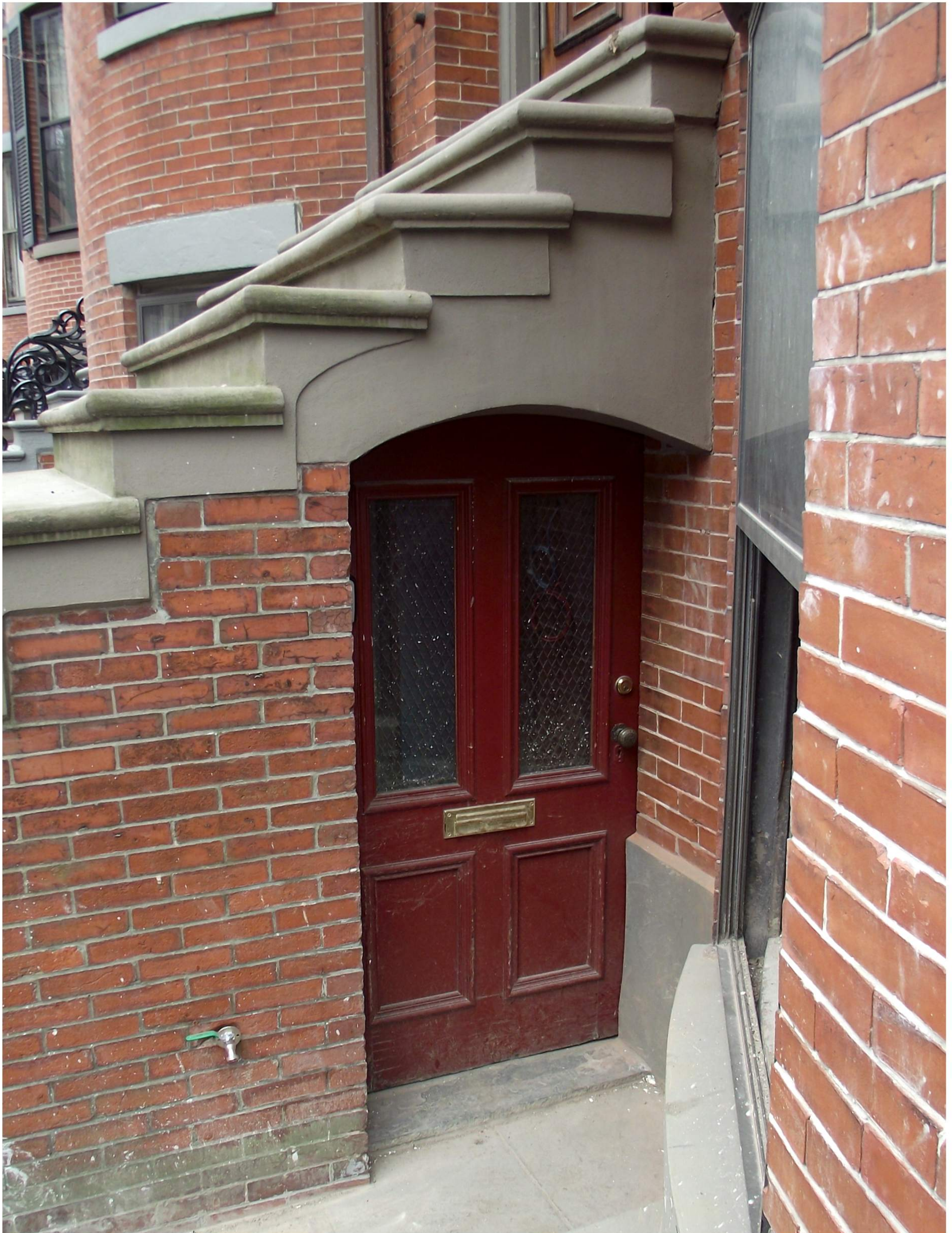
158 West Canton Street: Garden Level Entry Door Existing conditions during construction (2020)