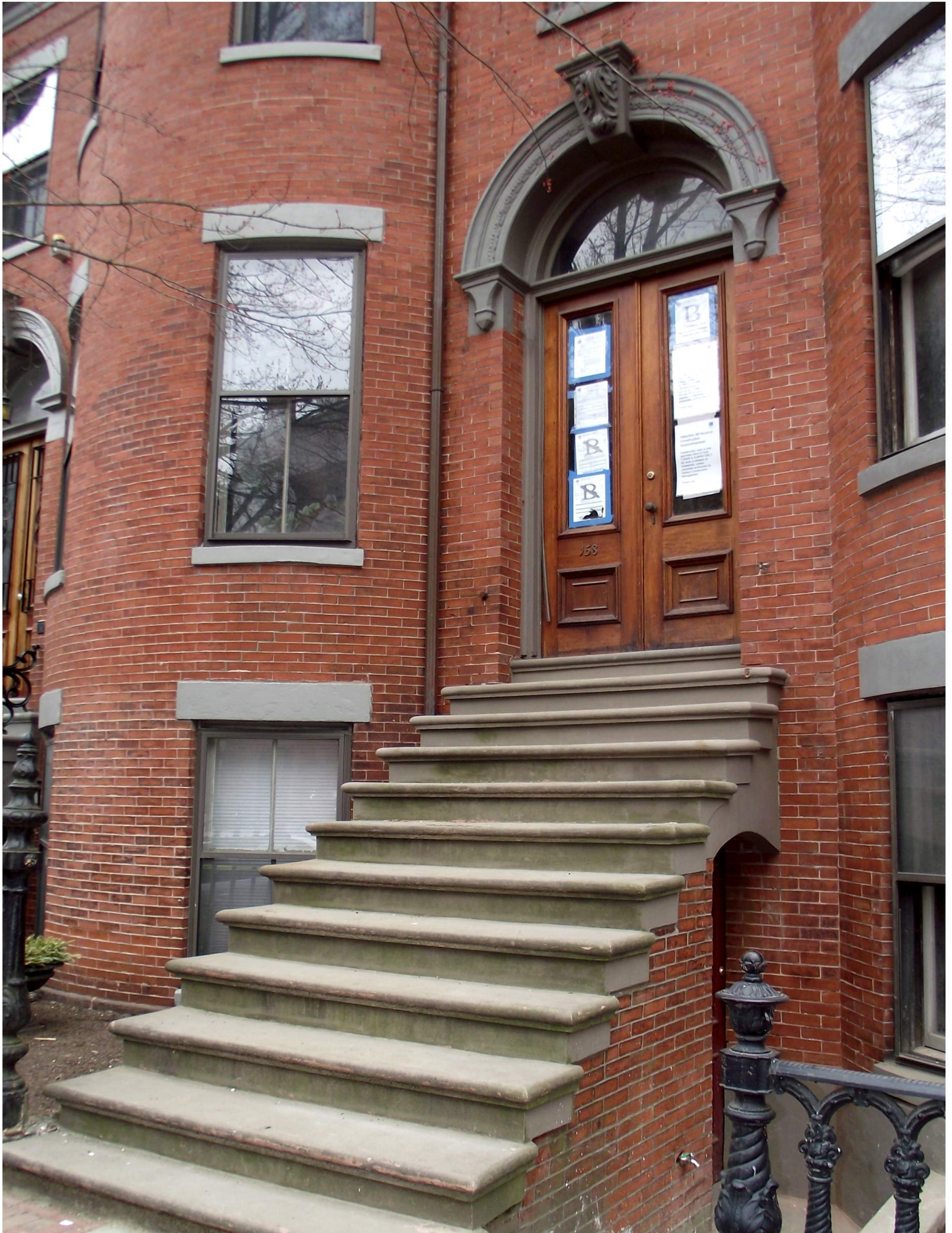
158 West Canton Street: Decorative Metal Railings Existing conditions during construction (2020) showing half railings removed