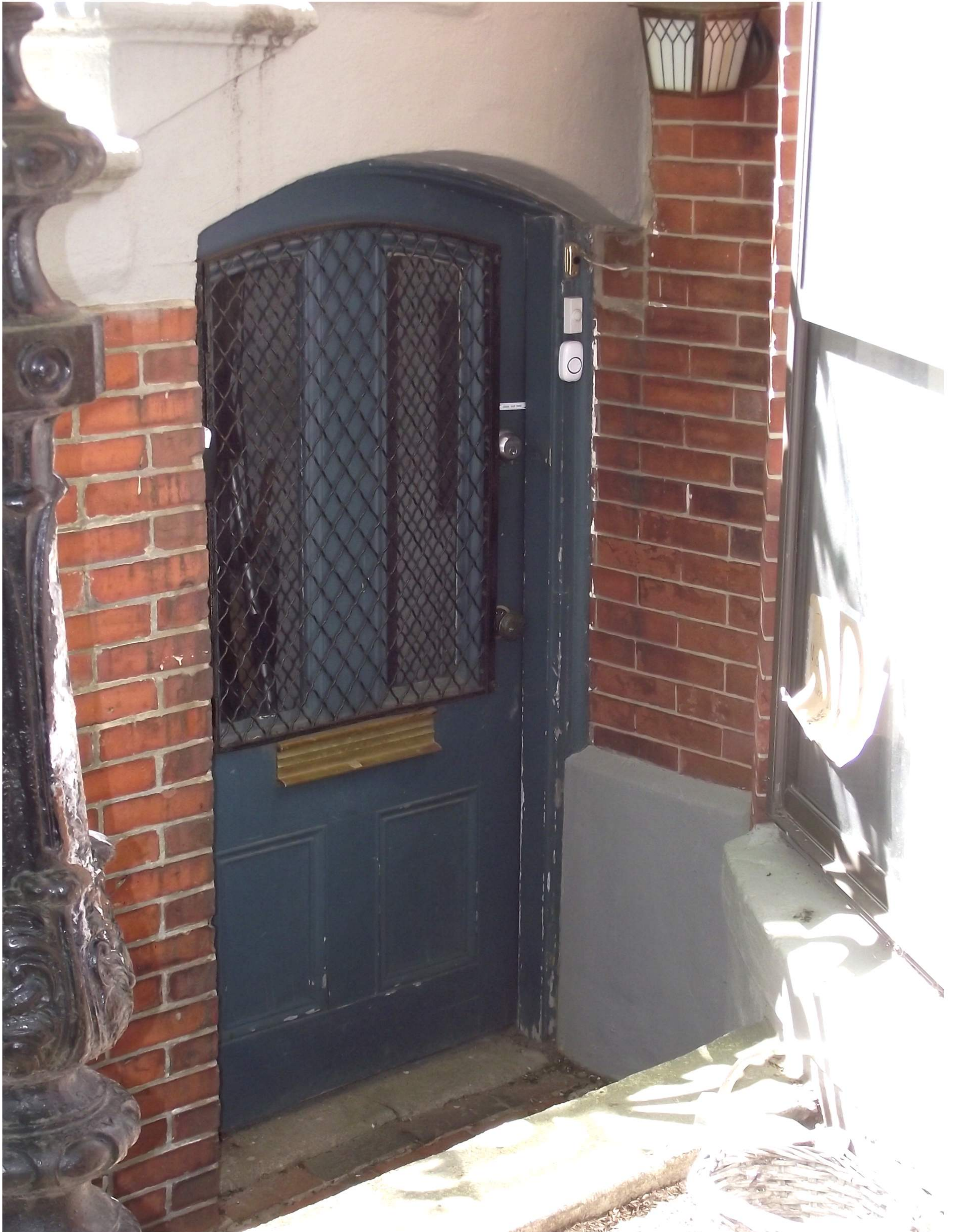
158 West Canton Street: Garden Level Entry Door Door and exterior trim precedent at neighboring building (156 West Canton)