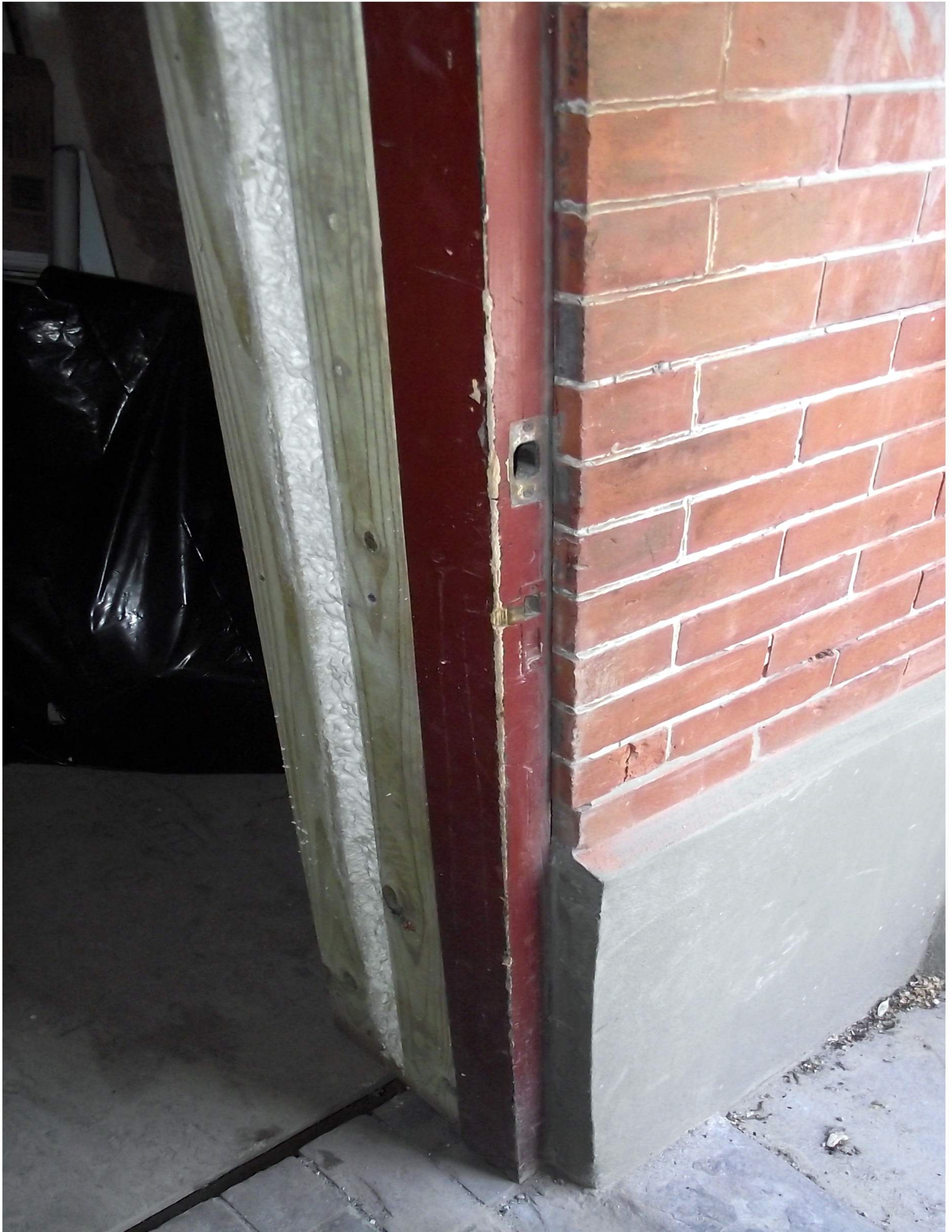
158 West Canton Street: Garden Level Entry Door Existing conditions during construction (2020)