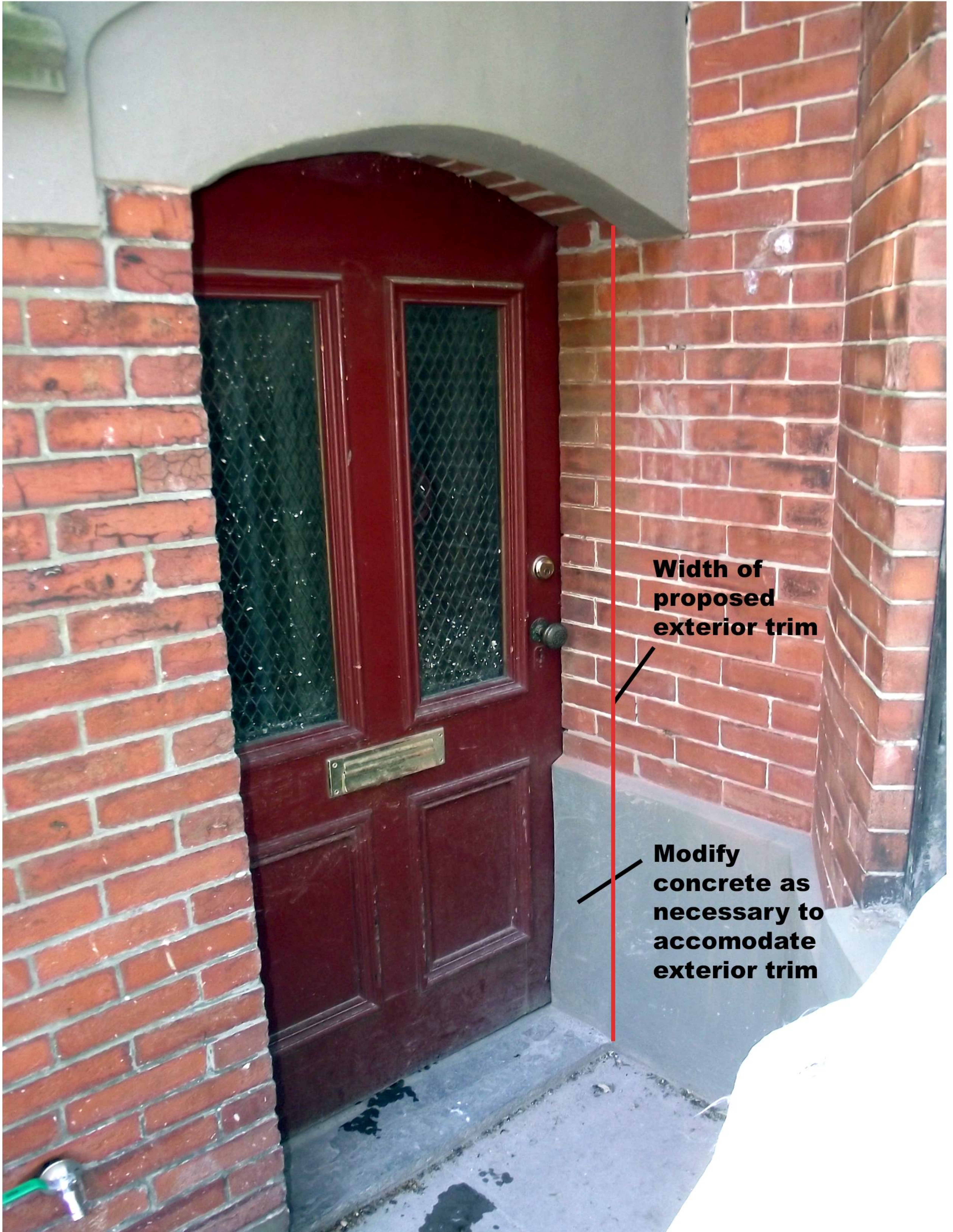
158 West Canton Street: Garden Level Entry Door Proposed exterior trim detail