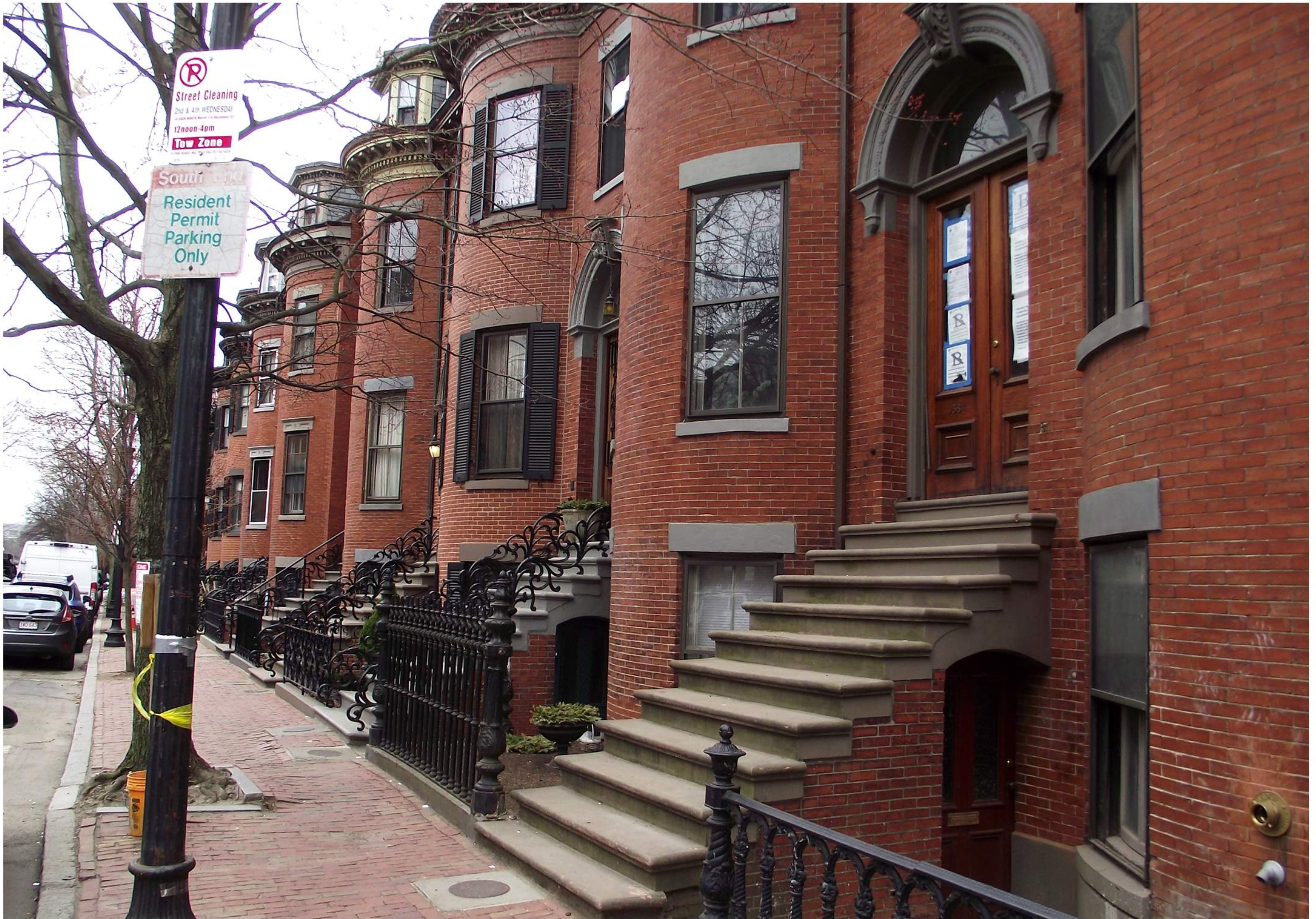
158 West Canton Street: Decorative Metal Railings Existing conditions during construction (2020) showing half railings removed