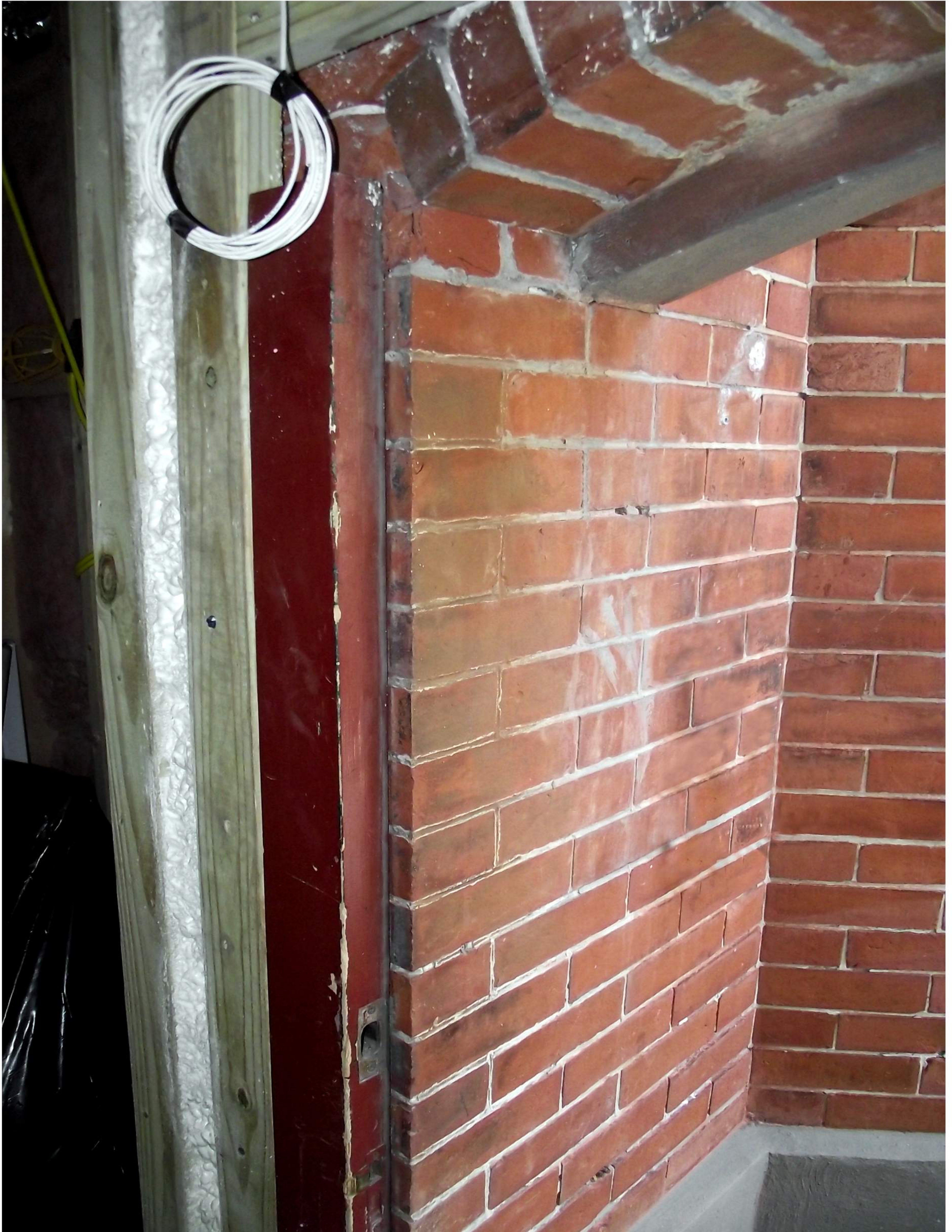
158 West Canton Street: Garden Level Entry Door Existing conditions during construction (2020)