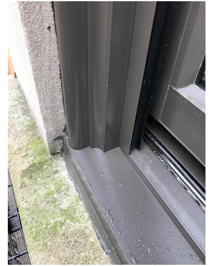
DETAIL D - PROPOSED WINDOW BRICK MOLD AT JAMB / SILL NOTE: SILL PANNING DETAIL MATCHES HISTORIC PHOTOGRAPH