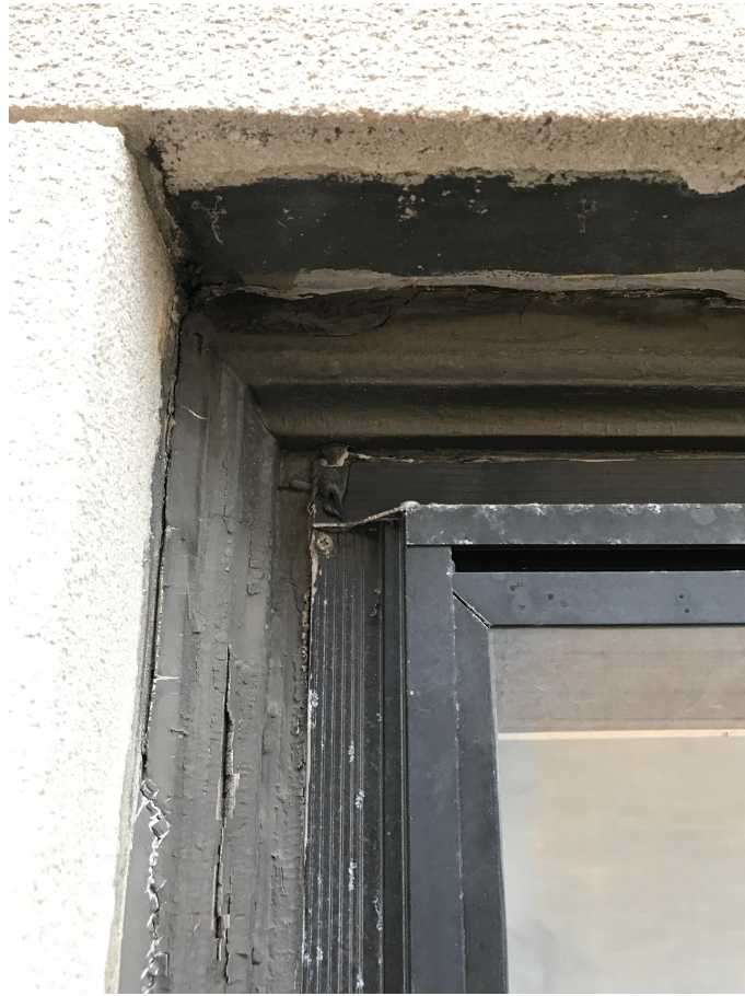
DETAIL A - EXISTING WINDOW BRICK MOLD AT JAMB / HEAD