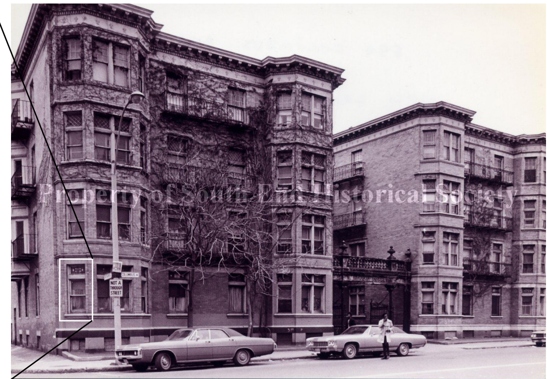
HISTORIC SILL PANNING. NEW ALUMINUM WINDOW TO MATCH. SEE DETAIL D