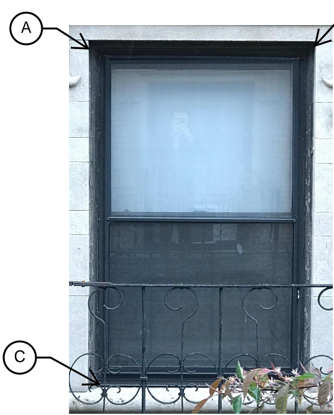
TYPICAL EXISTING WINDOW