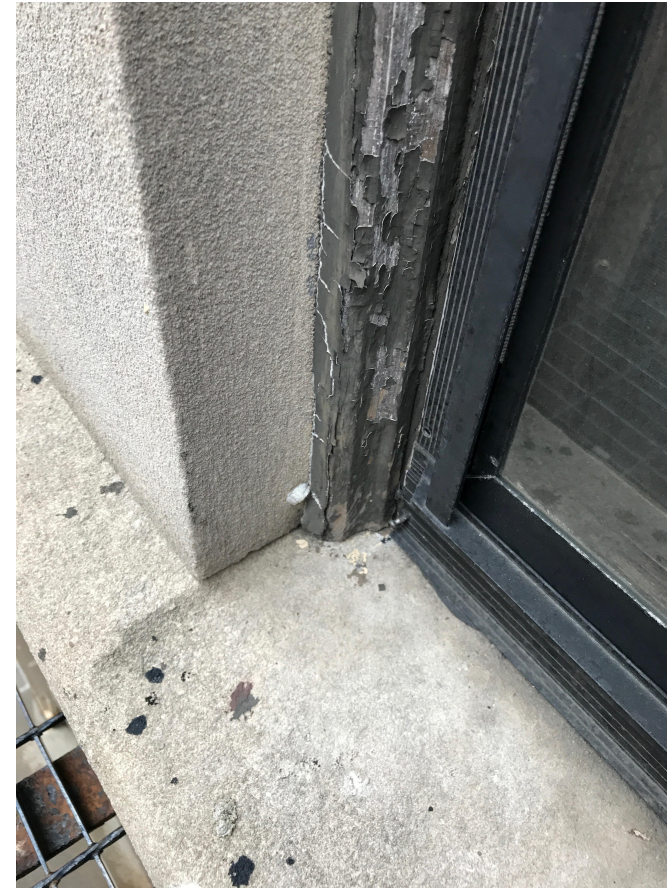
DETAIL C - EXISTING WINDOW BRICK MOLD AT JAMB / SILL