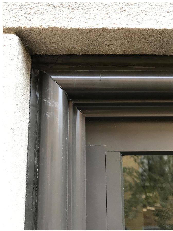
DETAIL B - PROPOSED WINDOW BRICK MOLD AT JAMB / HEAD