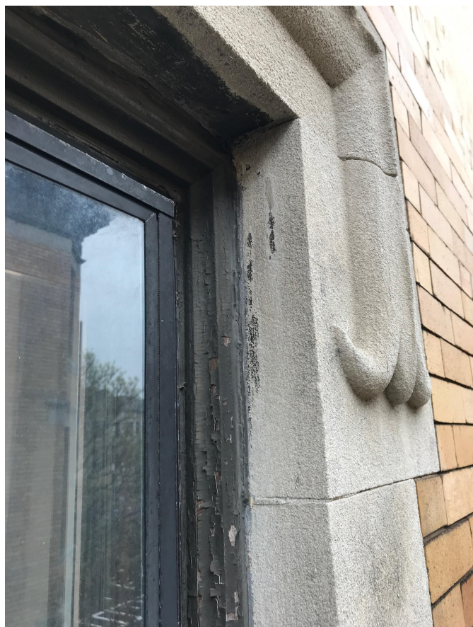
DETAIL E - EXISTING WINDOW BRICK MOLD AT JAMB / HEAD