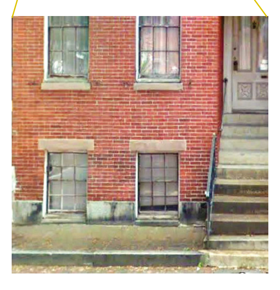
46 Clarendon Project Site