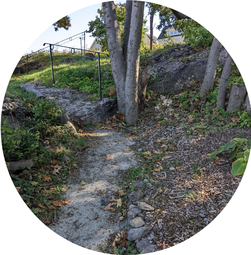
Savin Hill Wildlife Garden, Dorchester