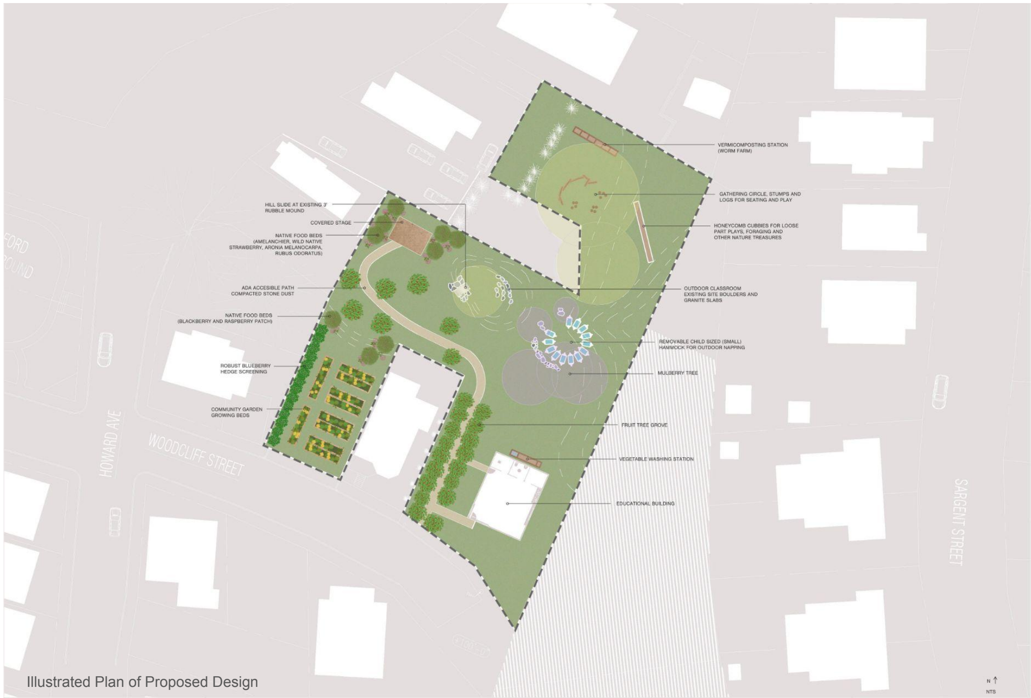
Illustrated Plan of Proposed Design