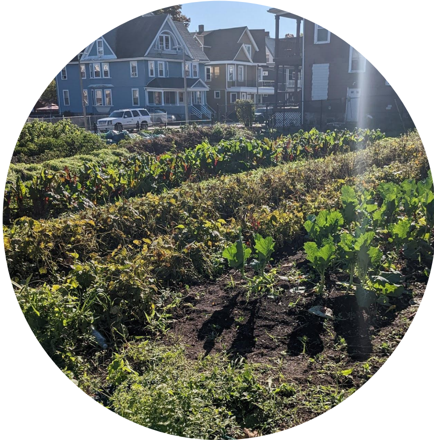
East Cottage Farm, Roxbury