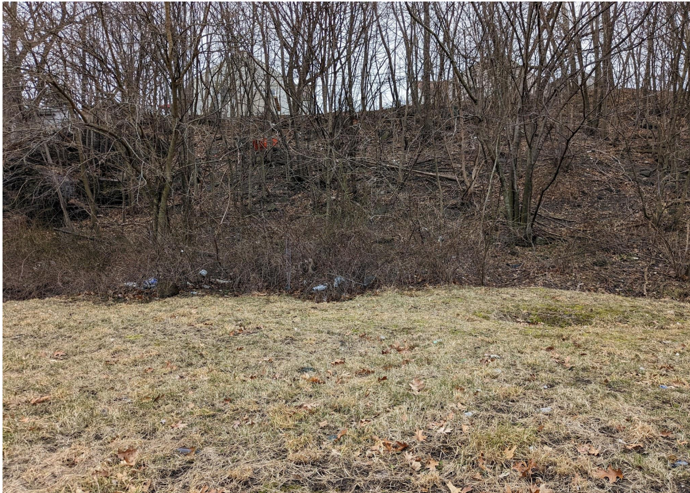
View from 78 Woodcliff Street towards Sargent Street