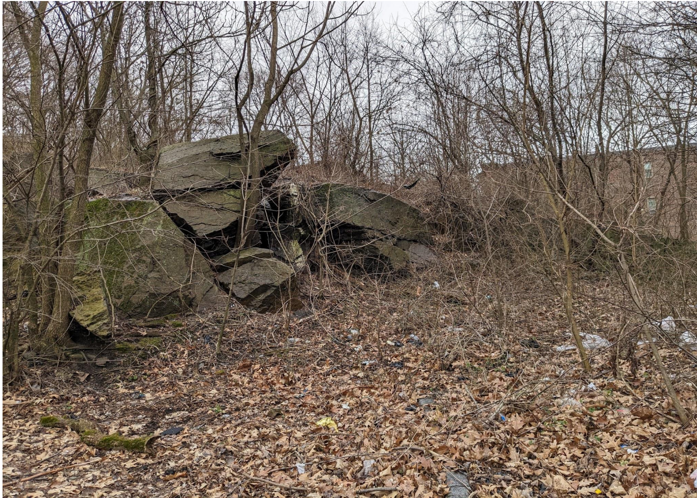
View from end of Woodcliff Street towards Woodledge Street