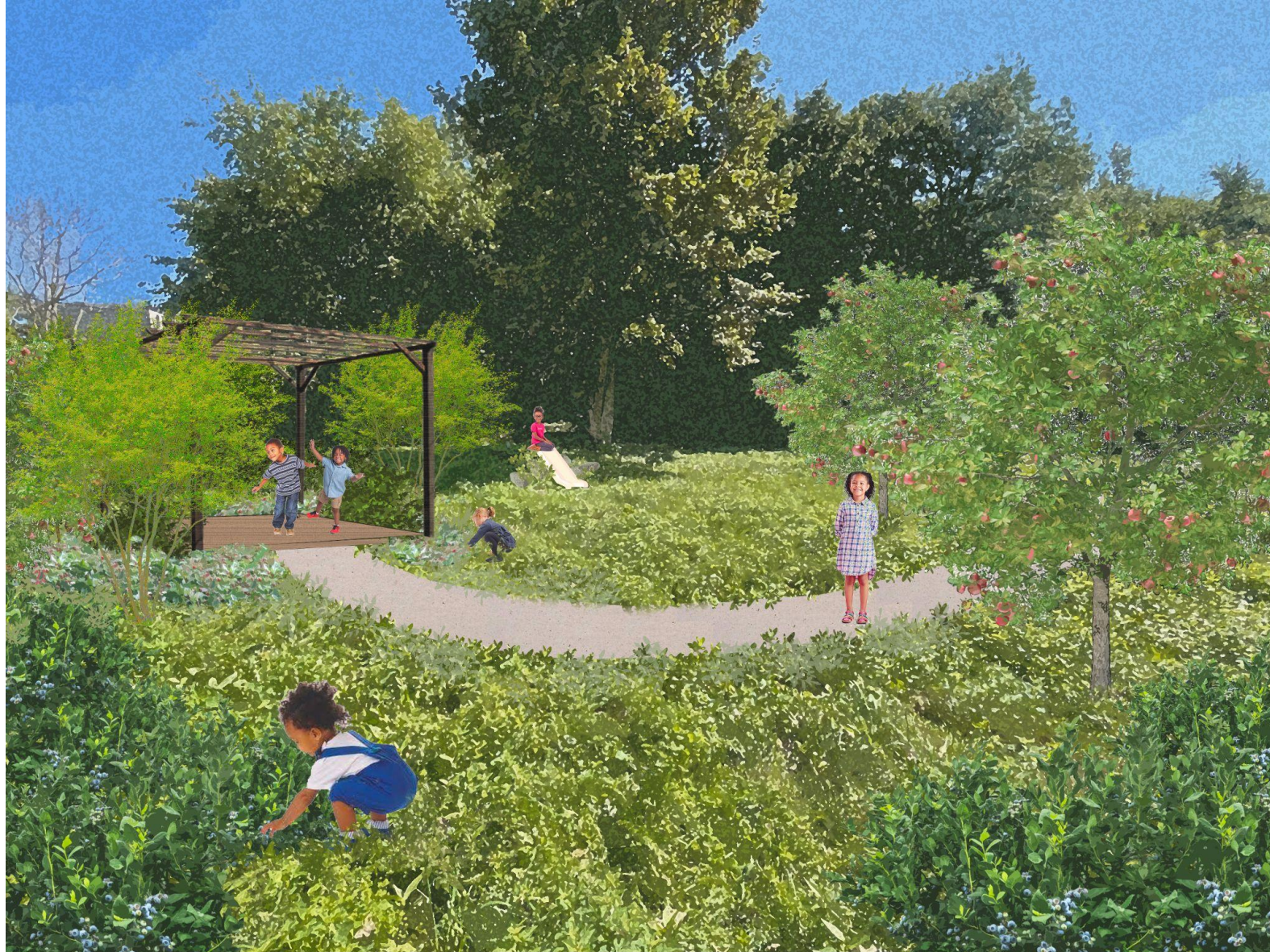
Illustrated Collage of Proposed Design