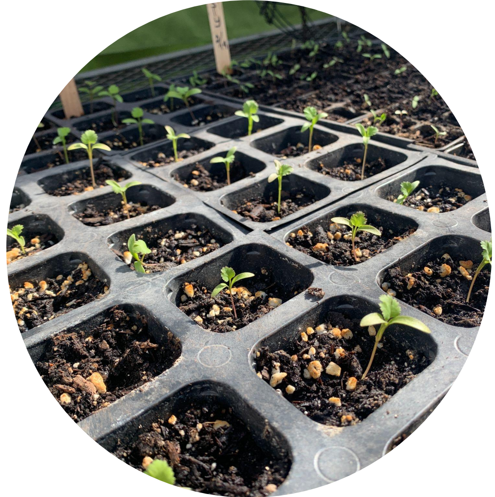
Eastie Farm, East Boston