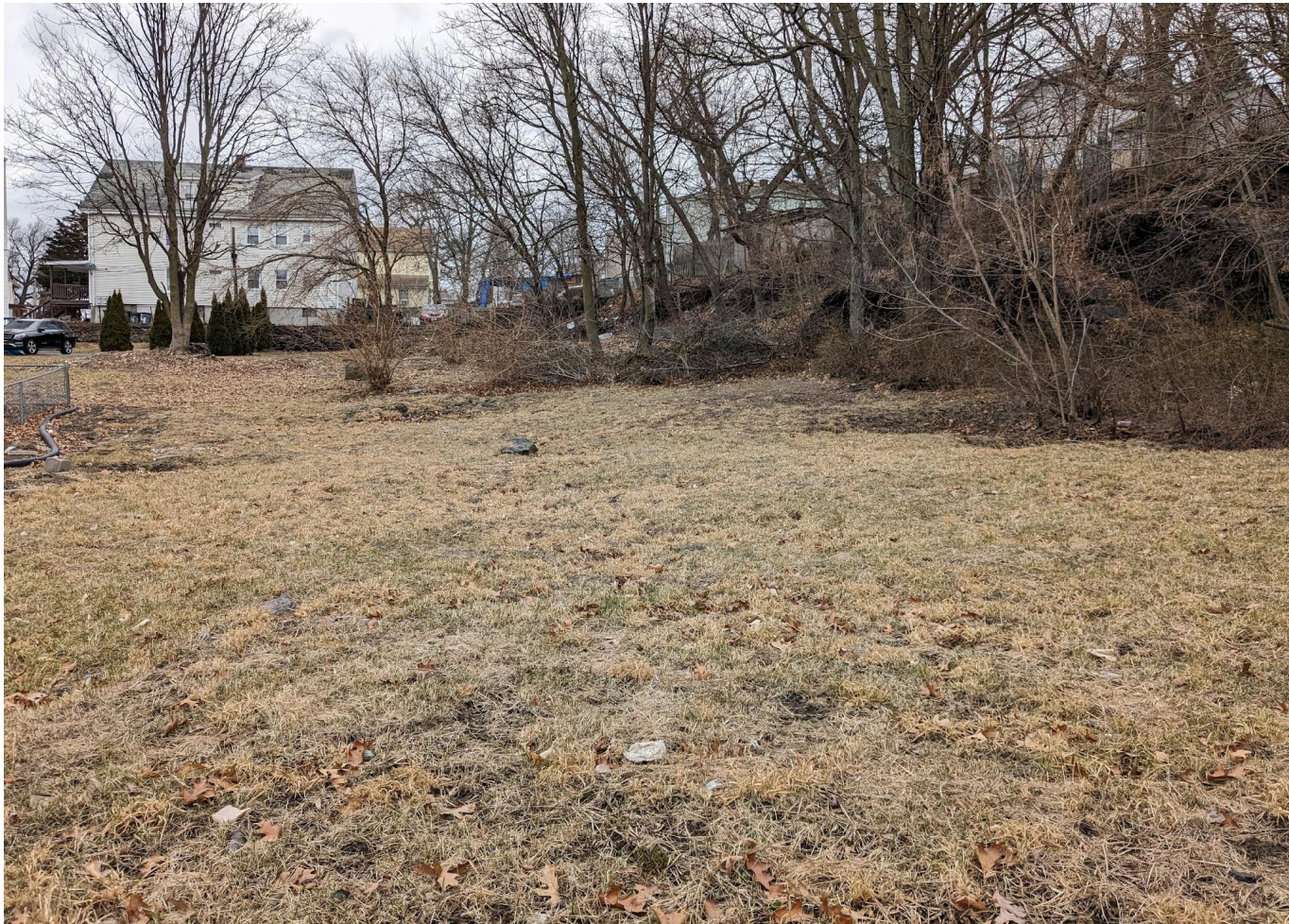
View from 78 Woodcliff Street towards Letterfine Terrace