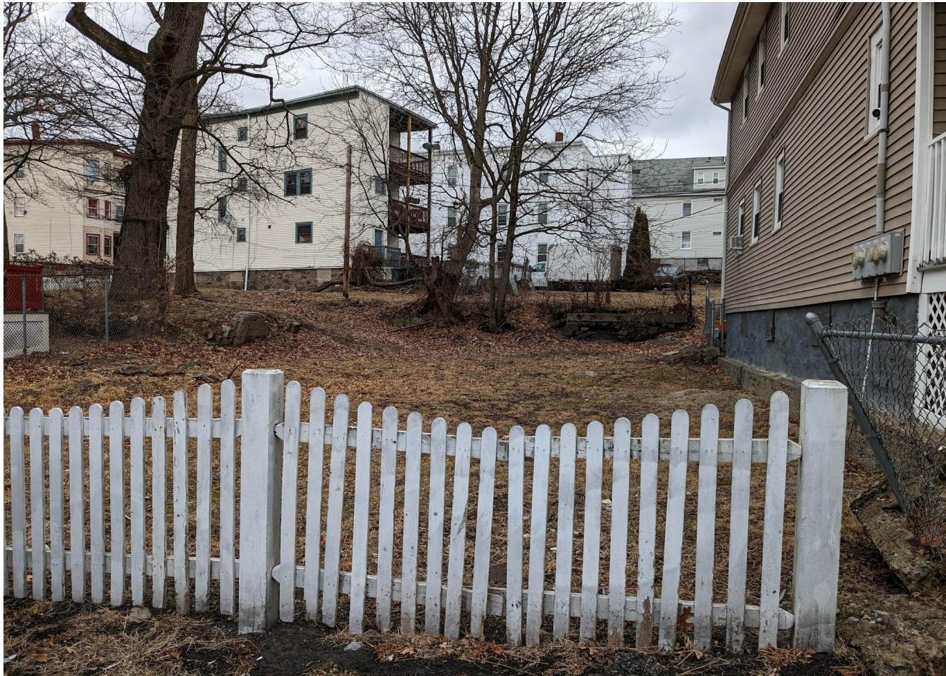
View from Woodcliff Street towards Letterfine Terrace