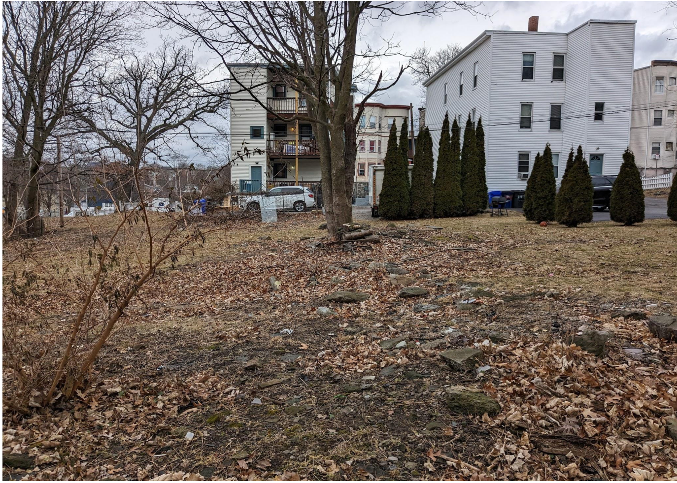
View towards Howard Avenue