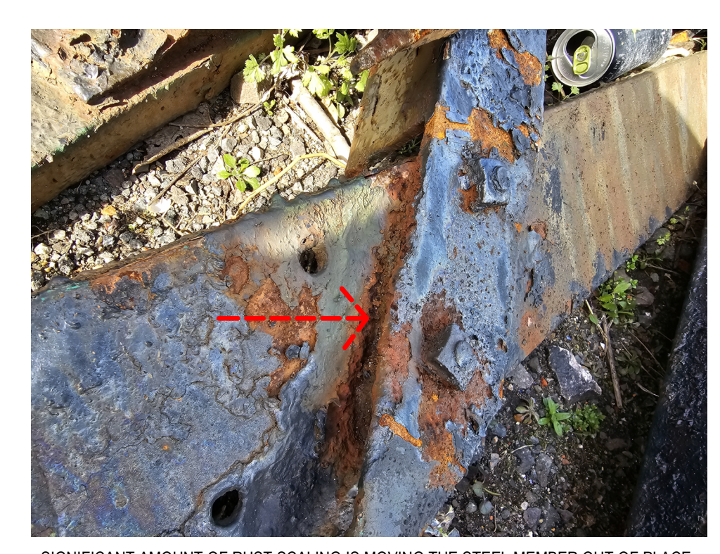
SIGNIFICANT AMOUNT OF RUST SCALING IS MOVING THE STEEL MEMBER OUT OF PLACE