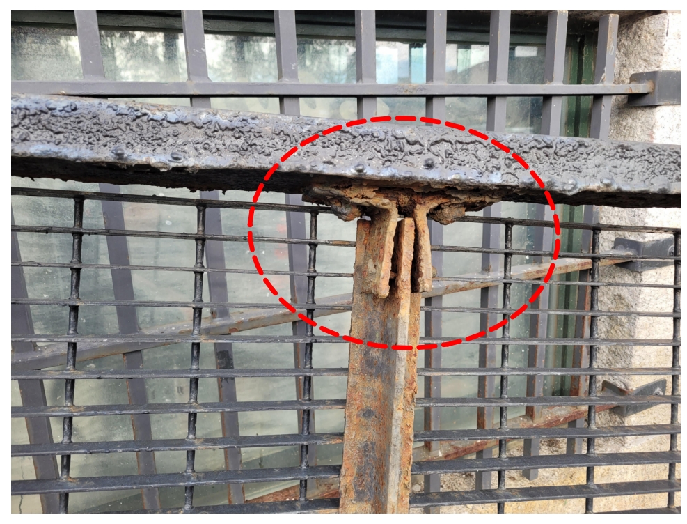
RUST SCALING AT STEEL ANGLES - ANGLES MOVING OUT OF PLACE