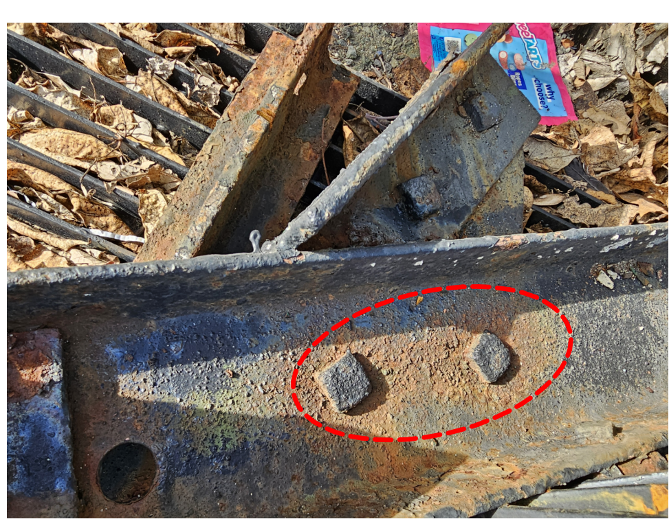
SQUARE BOLT FROM THE 70'S NO LONGER USED. CURRENTLY, THERE IS NO TOOL TO PERFORM PULL TEST ON THESE BOLTS