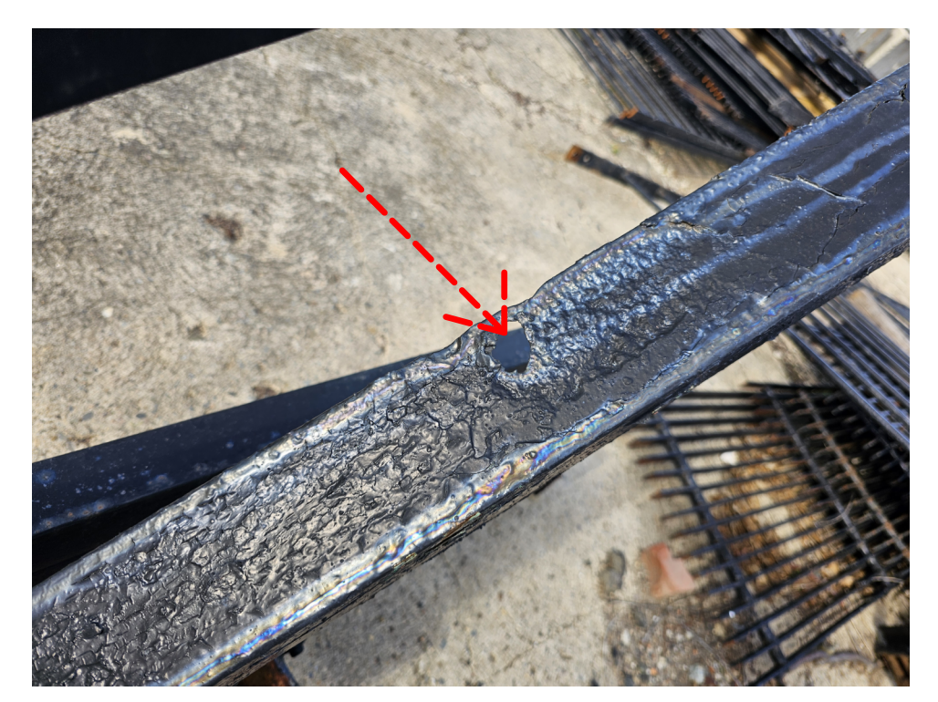
CONSIDERABLE SECTION LOSS ON STEEL MEMBER