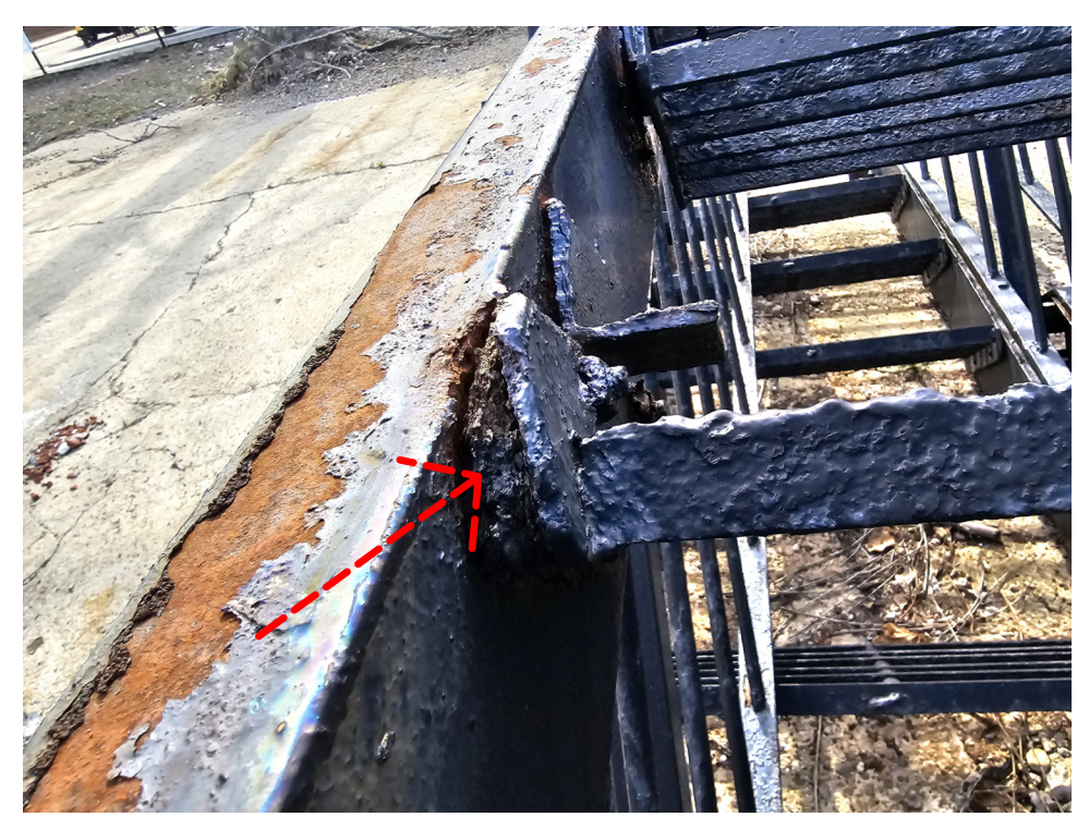
SIGNIFICANT RUST SCALING MOVING STEEL COMPONENTS OUT OF PLACE