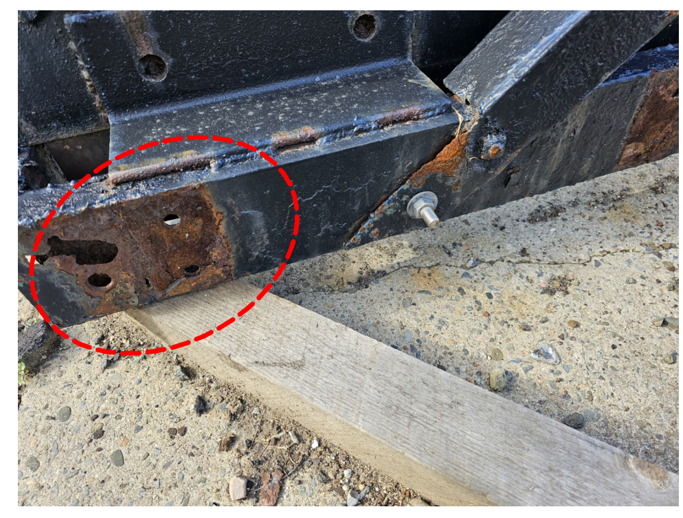
CONSIDERABLE SECTION LOSS ON STEEL MEMBER