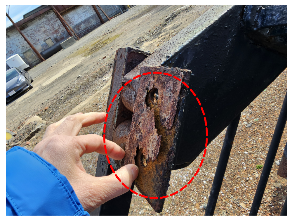
CONSIDERABLE SECTION LOSS DUE TO RUST SCALING