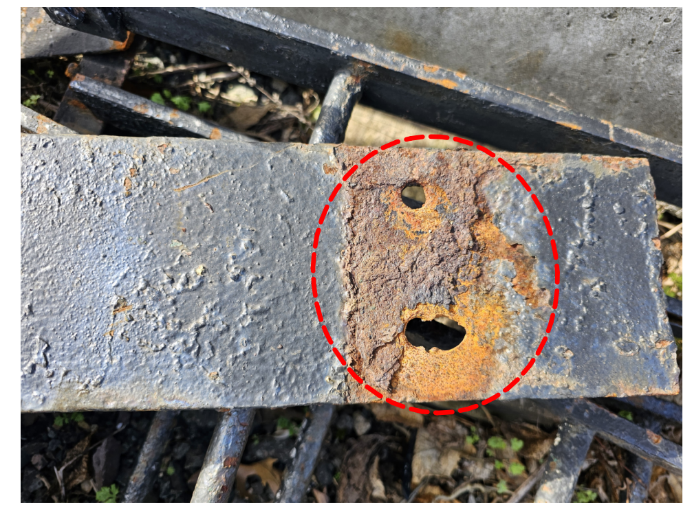
STEEL CHANNEL DETERIORATION - CONSIDERABLE SECTION LOSS DUE TO RUST SCALING