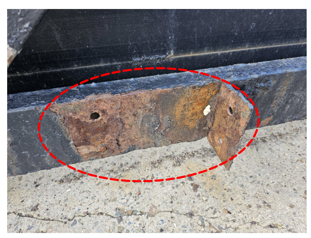
CONSIDERABLE SECTION LOSS ON STEEL MEMBER