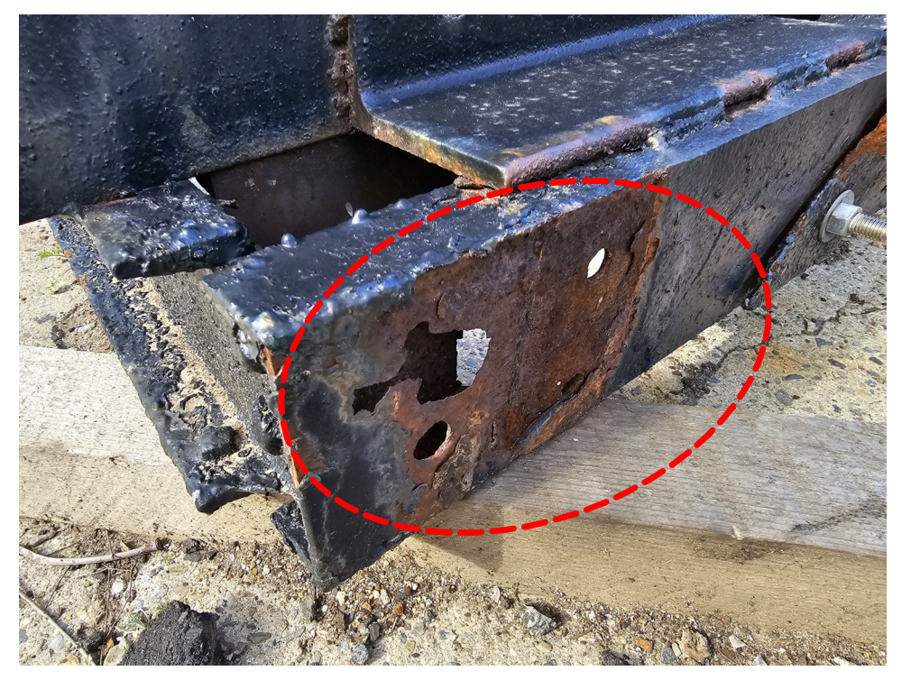
CONSIDERABLE SECTION LOSS ON STEEL MEMBER