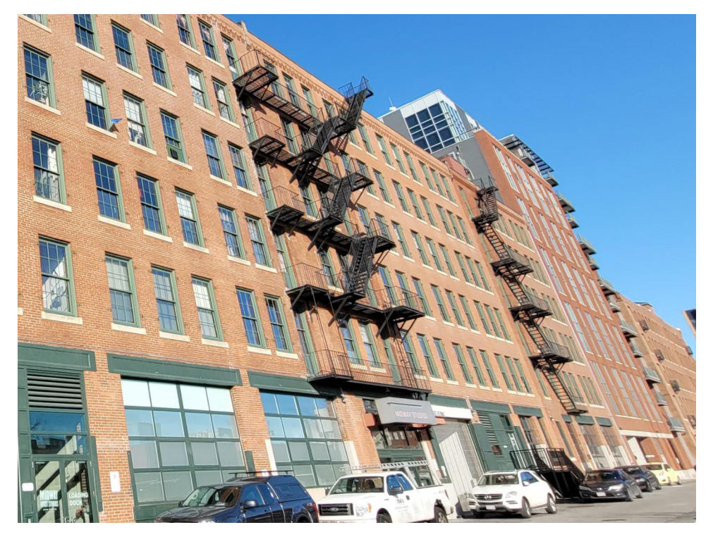
MEDALLION AVE FACADE