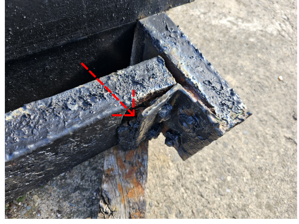
SIGNIFICANT RUST SCALING MOVING STEEL COMPONENTS OUT OF PLACE