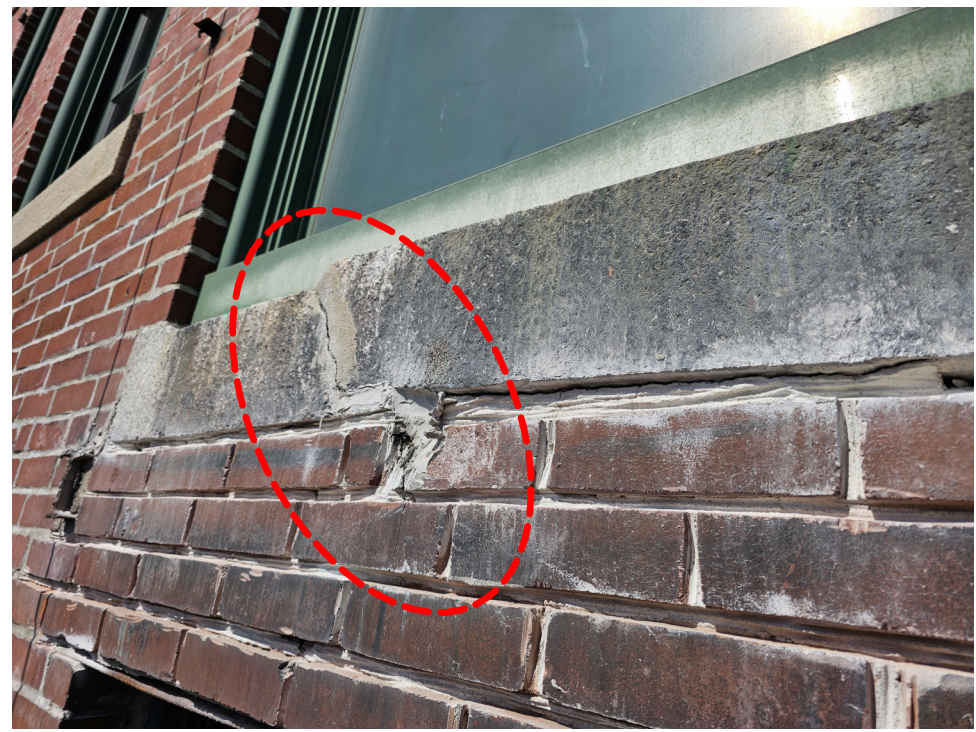
PHASE 1: MASONRY REPAIRS AROUND FIRE ESCAPE A