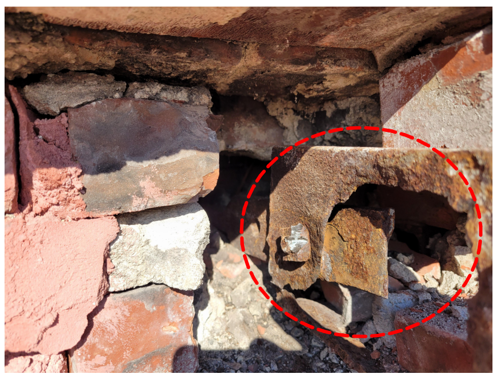
STEEL CHANNEL DETERIORATION - CONSIDERABLE SECTION LOSS DUE TO RUST SCALING