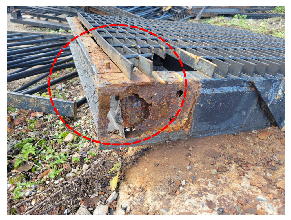
STEEL CHANNEL DETERIORATION - CONSIDERABLE SECTION LOSS DUE TO RUST SCALING