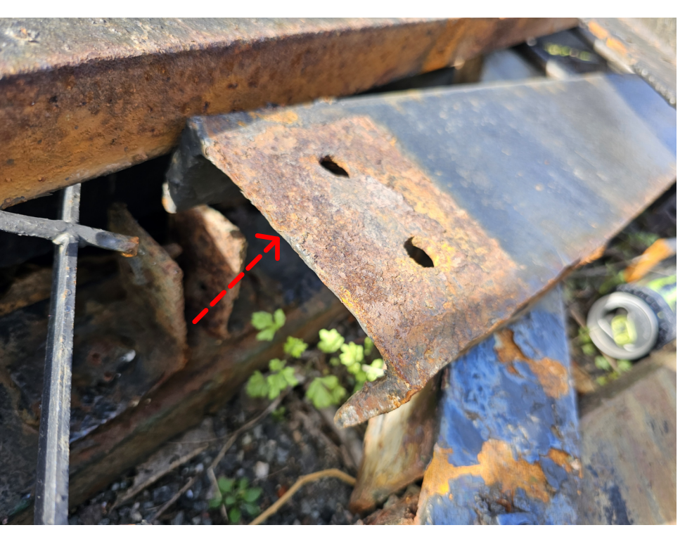
STEEL CHANNEL DETERIORATION - CONSIDERABLE SECTION LOSS DUE TO RUST SCALING