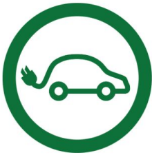
Figure 1: City of Boston's Wayfinding Logo for General Service EVSE Signage.

Signage shall be placed at the parking entrance notifying the presence of EVSE. The City of Boston's Wayfinding Logo sign shall be used for General Service EVSE signage. A link to a high resolution graphic can be found at www.boston.gov/recharge-boston