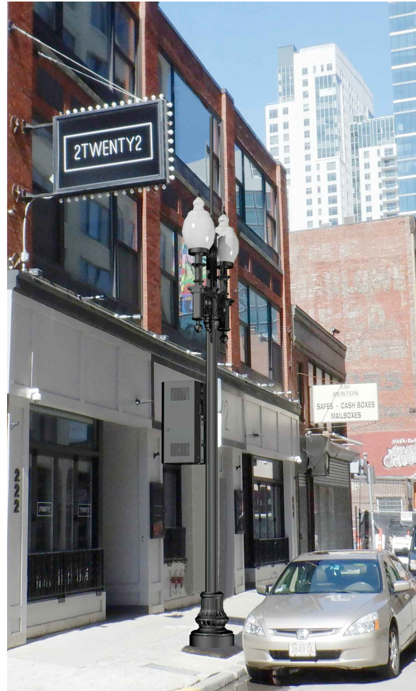
PROPOSED PHOTOGRAPHIC SIMULATION

N:\Engineering\Crown Castle\EXHIBIT EXAMPLES FOR CITY OF BOSTON\AA - AUTOCAD\EXHIBIT X-20.dwg