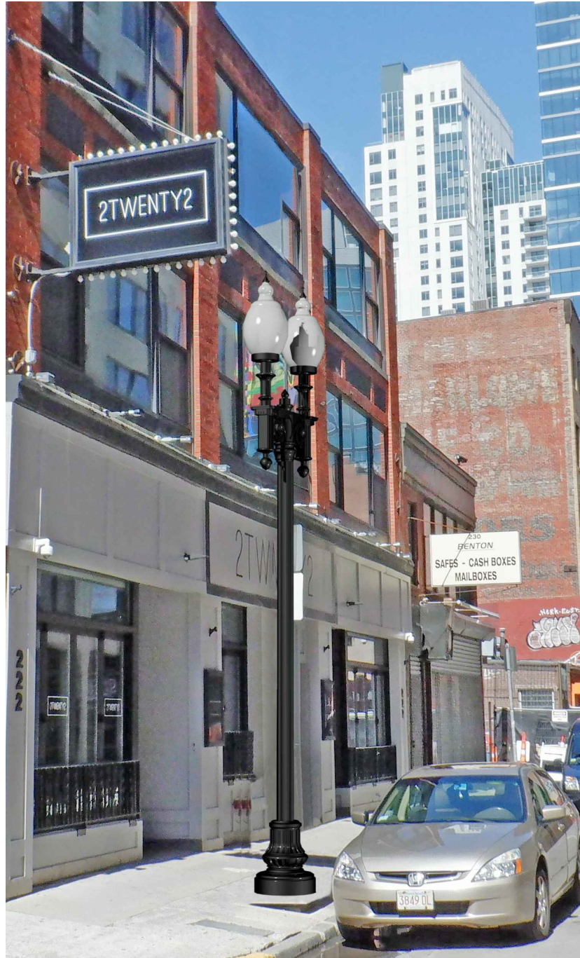
EXISTING PHOTOGRAPHIC VIEW