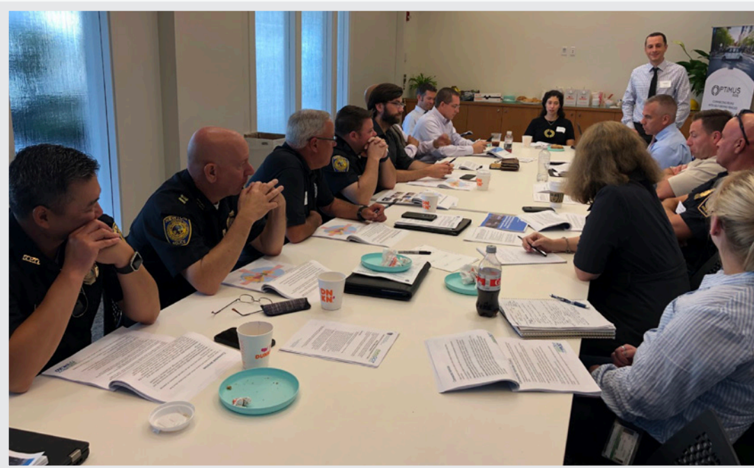
First responders workshop co-hosted by Optimus Ride, MassDOT, and the City of Boston's Office of New Urban Mechanics.

To achieve this, participants received a primer on how connected and autonomous vehicles function, covering topics from the SAE automation levels, basic sensor components, to the testing program in Massachusetts. Attendees also received facilities tours and garage visits to learn more about the manufacturing and R&D process. At the end of the day, participants had a Q&A session with members of the Optimus Ride engineering and operations team to learn more about our First Responder Plan and provide feedback from their point of view. Optimus Ride's First Responder Plan will be published in early 2020 by MassDOT and the City of Boston as part of our Memorandum of Agreement to Test Automated Driving Systems on Public Ways in Massachusetts.