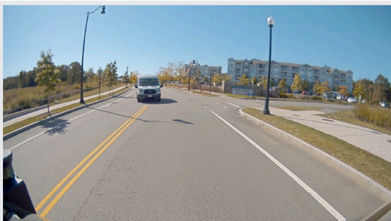
A photo of an oncoming vehicle captured by the Optimus Ride system as it begins encroaching into the path of an Optimus Ride vehicle. (Scenario 2)

During live vehicle testing and operation, our Safety Drivers are given the utmost discretion to prioritize safety by taking over controls and/or braking in these scenarios. They have been trained thoroughly to recognize potentially unsafe behaviors on the road which are external to our own vehicle's operation. These edge-case scenarios, such as the two above, are then reported to our operations team, who then turns these into actionable insights for our engineering team to digest and design a safe autonomous response.